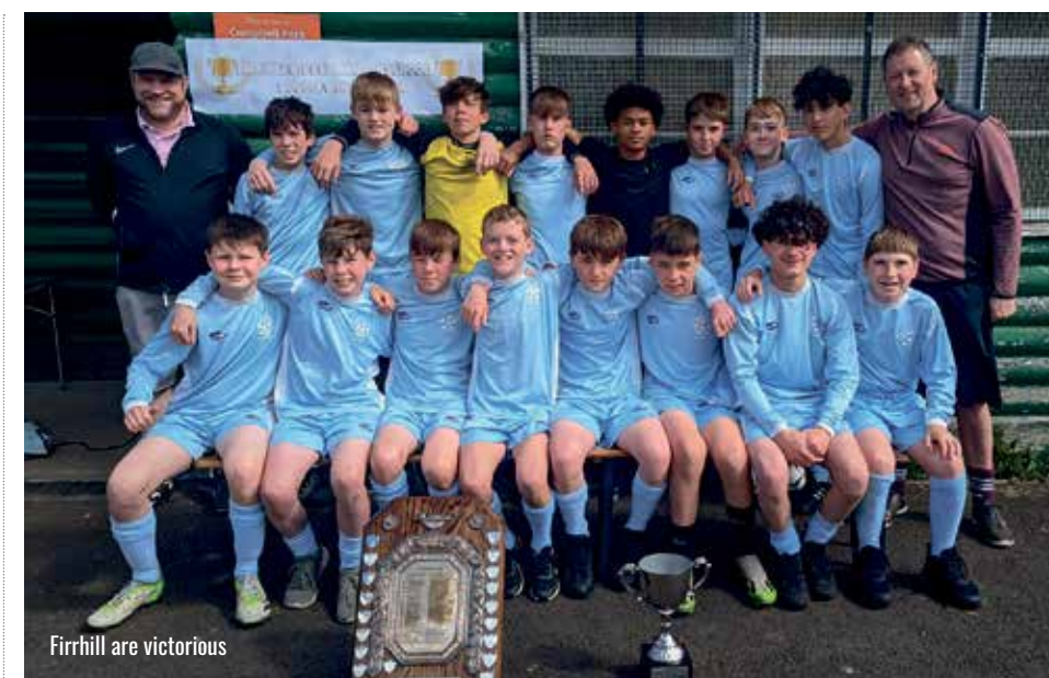
Firrhill are victorious

"Another key factor in the success has been the two parent coaches who have shown