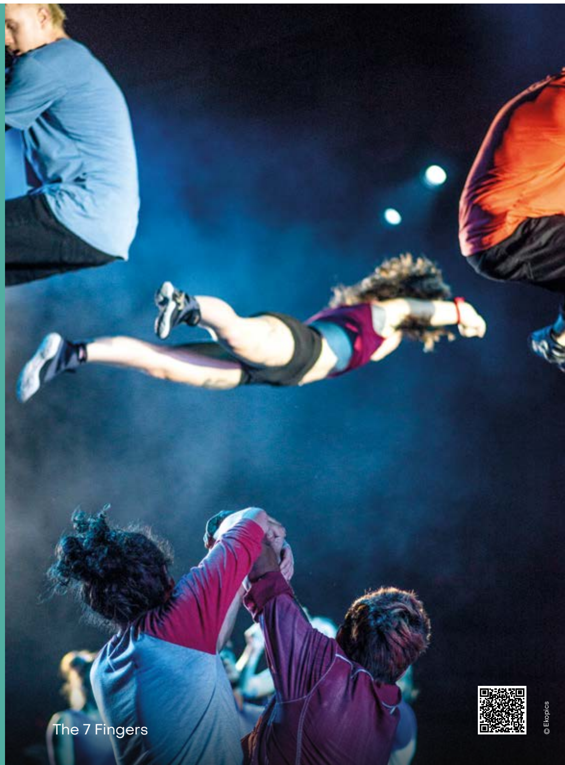
The 7 Fingers

underbellyedinburgh.co.uk/events/event/the-7-fingers-duel-reality ■ 7fingers.com