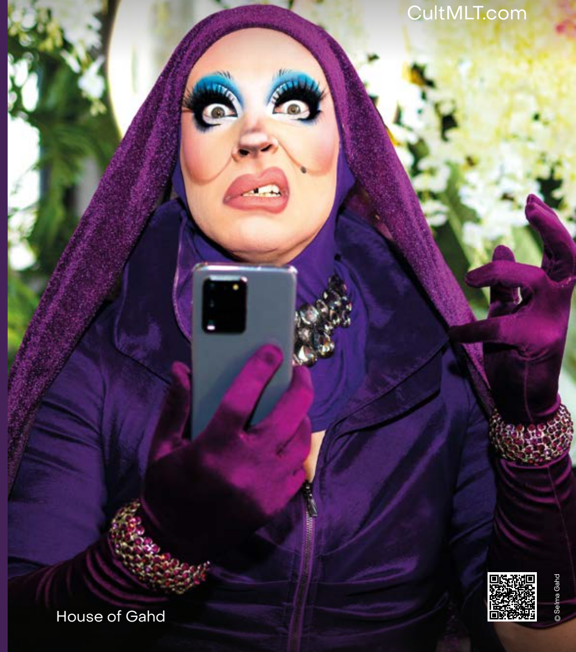
House of Gahd