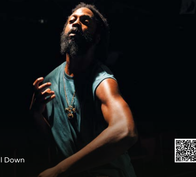
We All Fall Down