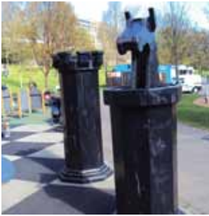
West Princes Street Gardens