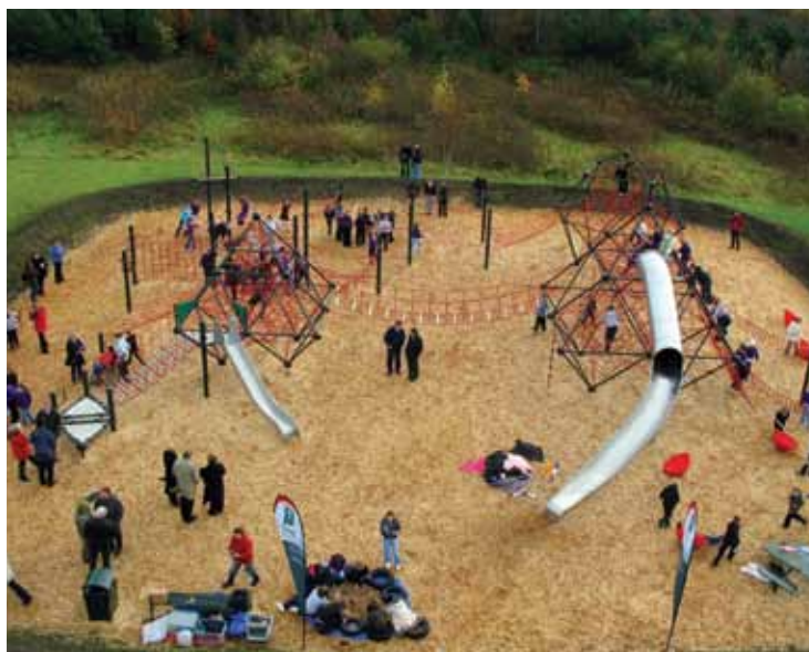
Craigmillar Castle Park

Any play area scoring less than 50 would be regarded as Fair, but these have no impact in meeting the play access standard.