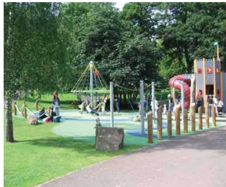
West Princes Street Gardens

Map 2 shows the distribution of the city's play areas after the 5 year programme has been implemented. The proportion of homes falling within the standard has increased from 67% in 2011 to 80% in 2016.