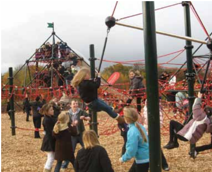
Craigmillar Castle Park