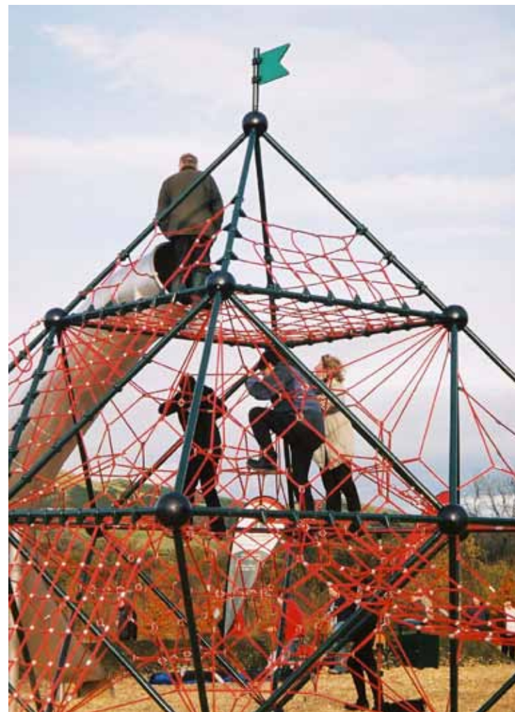
Craigmillar Castle Park