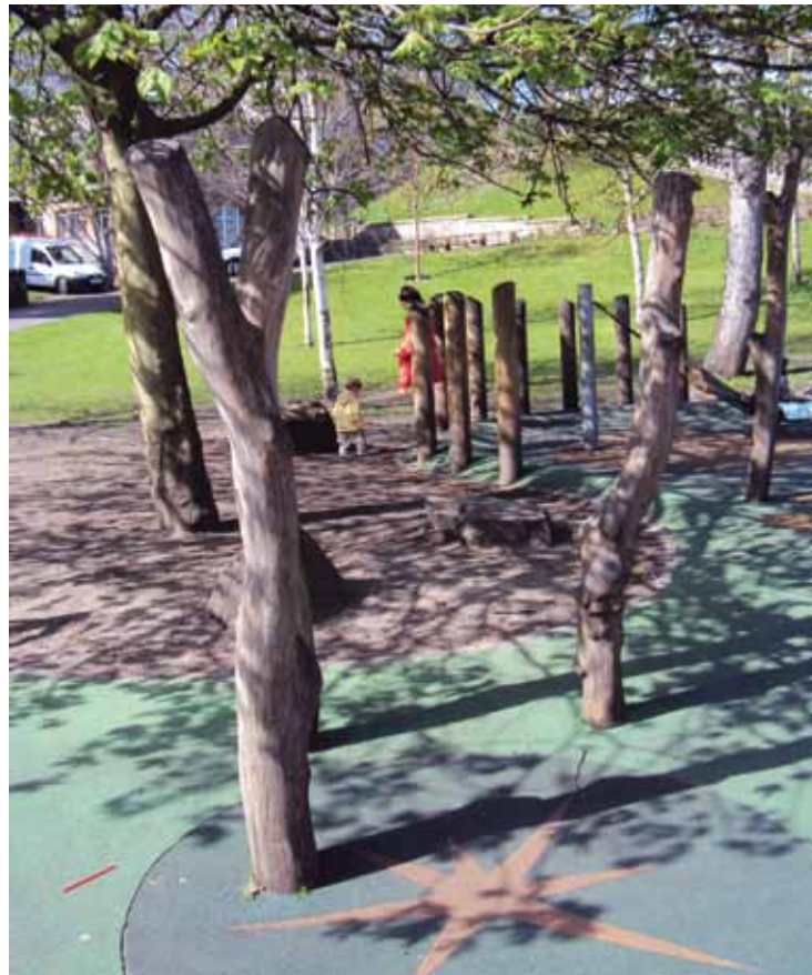
West Princes Street Gardens