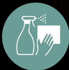
Frequent sanitising of common areas