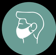
Mandatory face coverings