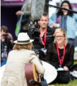
Photo of Cerys Matthews at EIBF 2013