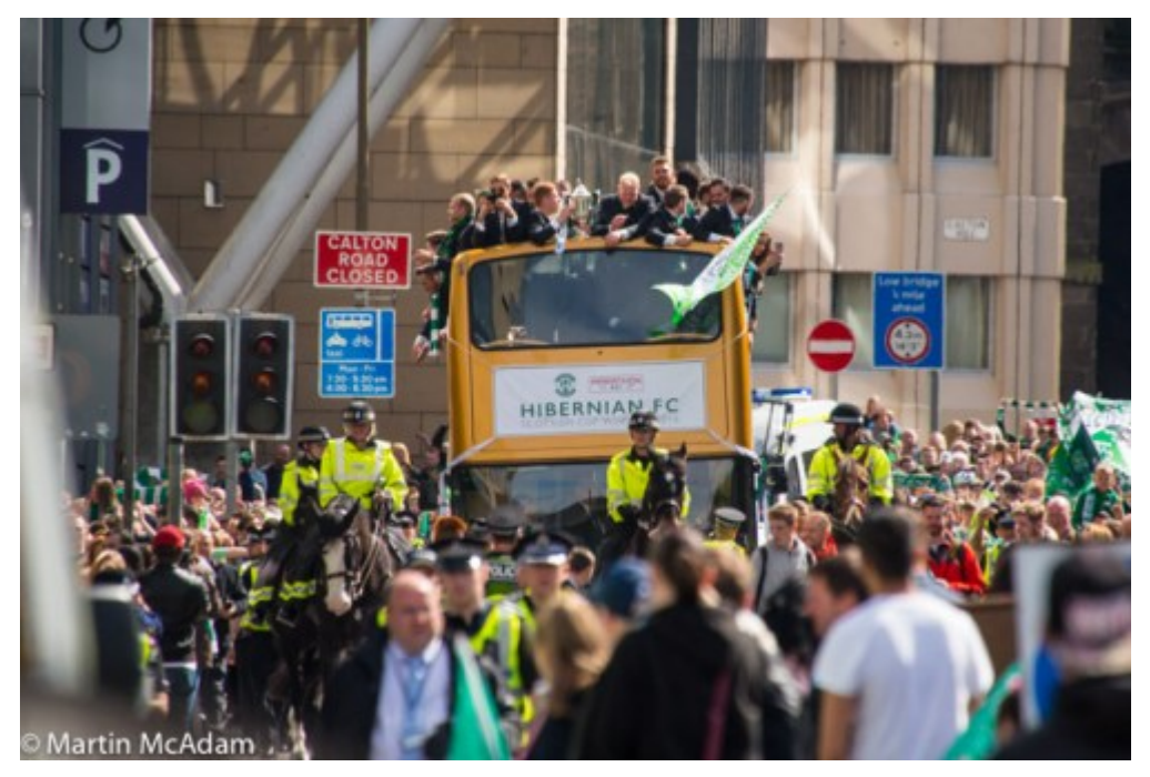
Hibs winning the cup