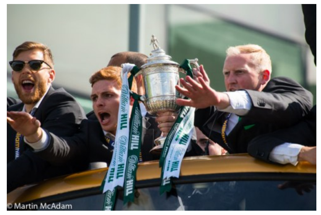
Hibs winning the cup