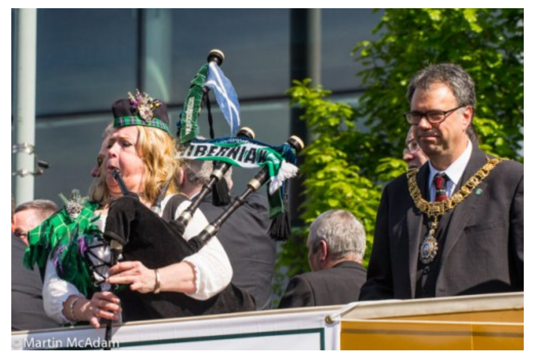
Hibs winning the cup