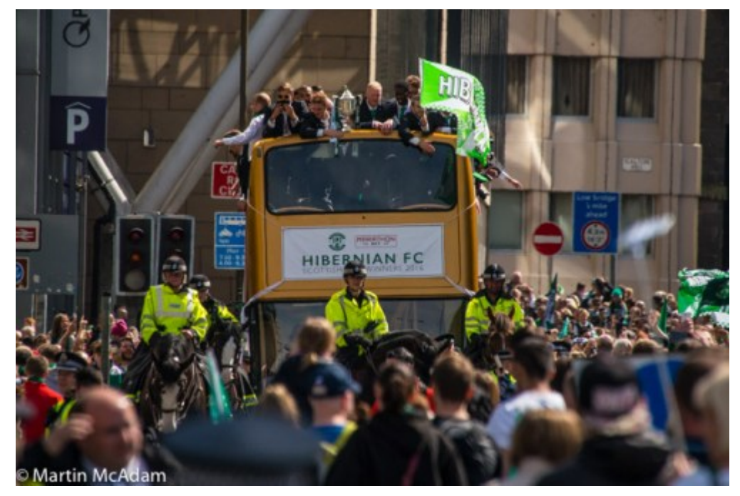
Hibs winning the cup