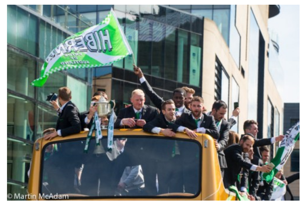
Hibs winning the cup