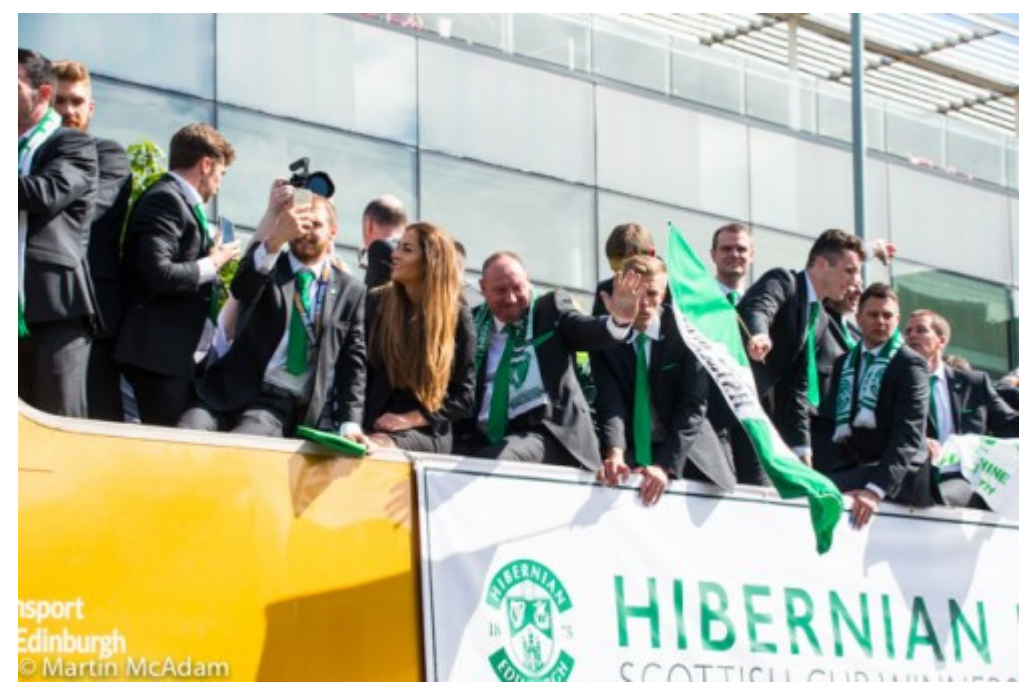
Hibs winning the cup