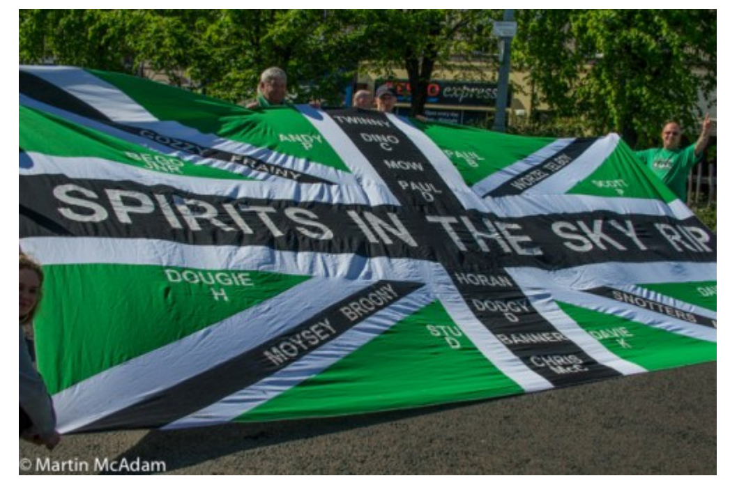
Hibs winning the cup