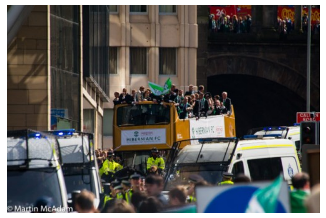
Hibs winning the cup