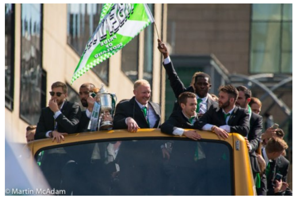
Hibs winning the cup