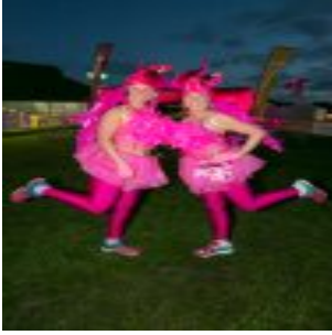
MOONWALK SCOTLAND 2017