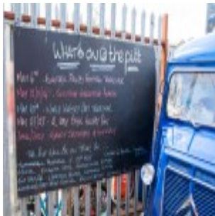
Pitt Street Market