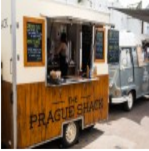
Pitt Street Market