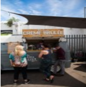
Pitt Street Market