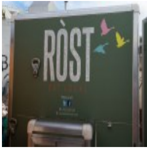
Pitt Street Market