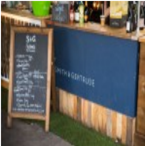
Pitt Street Market