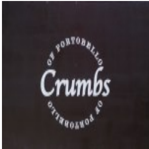
Pitt Street Market