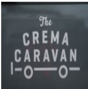
Pitt Street Market

The Pitt, Edinburgh Food and Drinks Yard, is at 125 Pitt Street EH6 4DE from 12 noon each Saturday and Sunday. More information here.