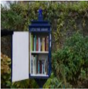
Little library in Starbank Park