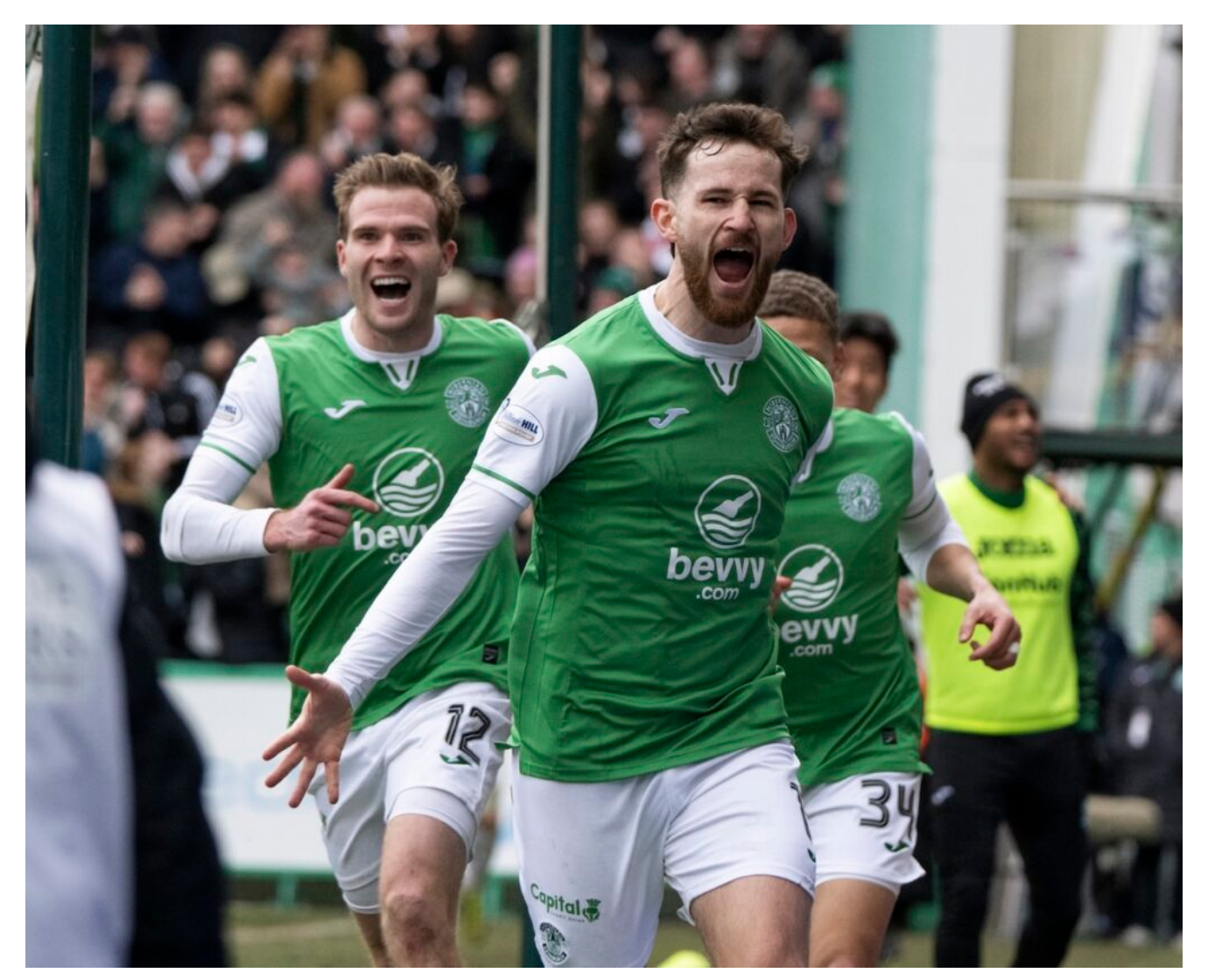
Hibs take all 3 points at Easter Road with a 2-1 win over city rivals, Hearts