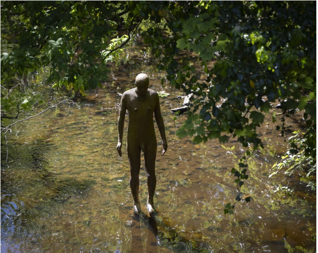
The Antony Gormley statue on the Water of Leith is almost totally uncovered due to low water levels. Picture Alan Simpson 16/5/2025