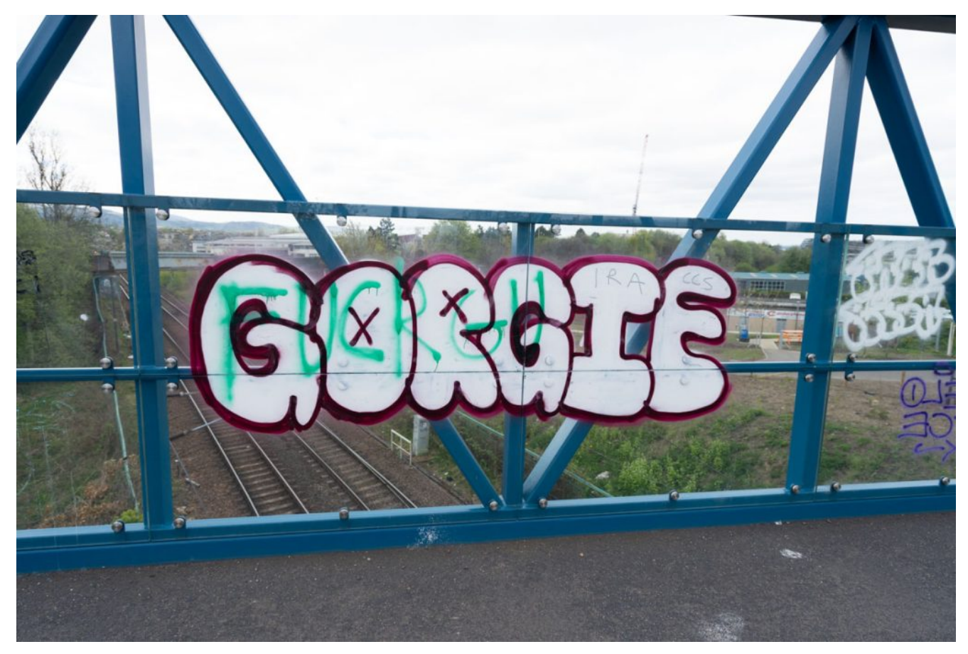
Graffiti Roseburn to Union Canal.