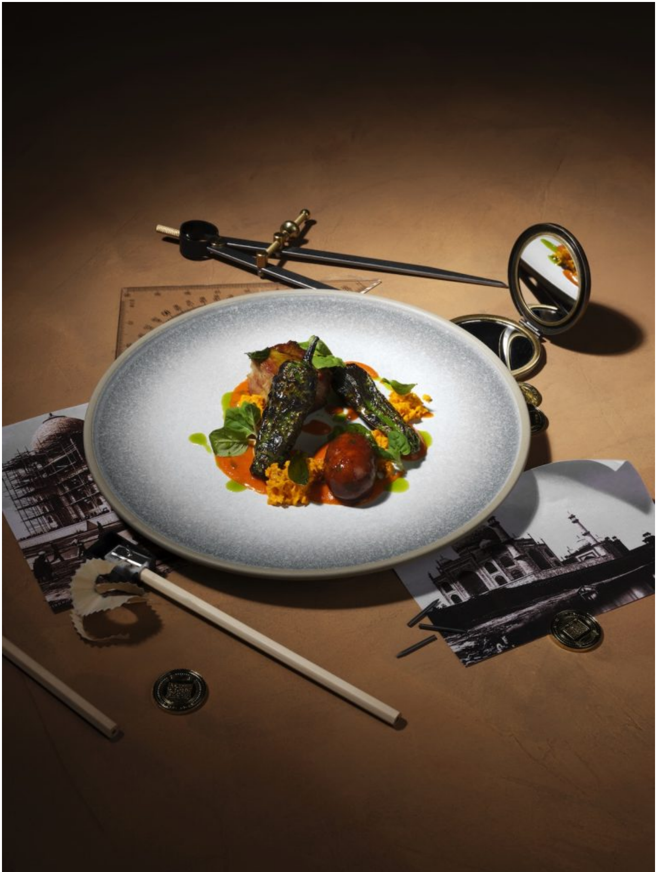
Course 5 Taj Mahal