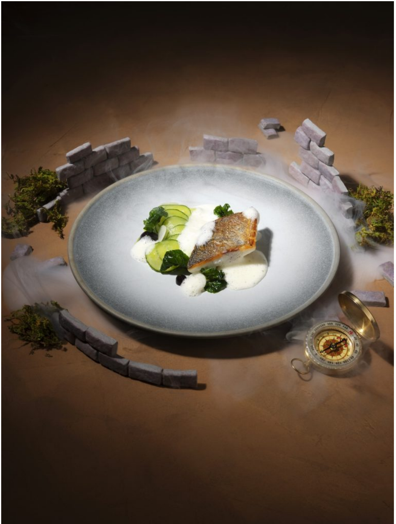
Course 4 Great Wall of China