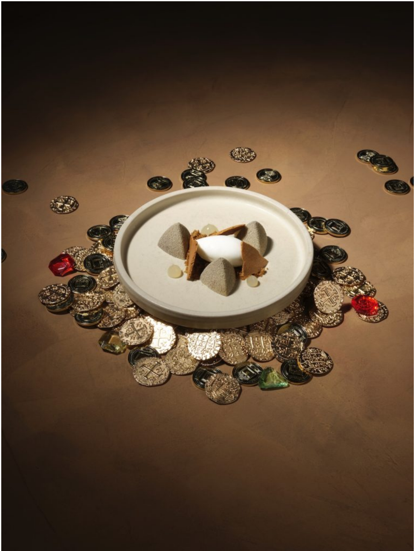
Course 6 Great Pyramids of Giza