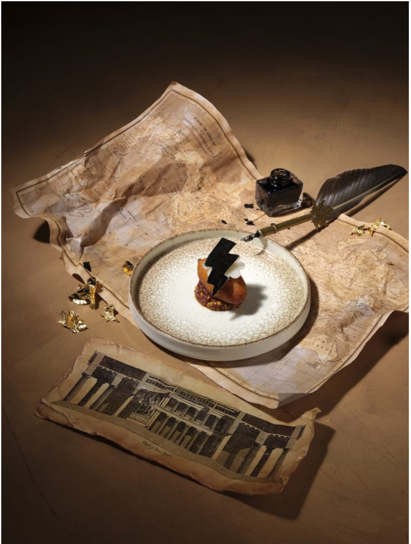
Course 1 State of Zeus