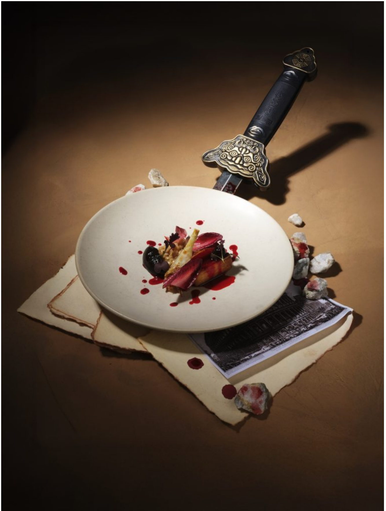
Course 2 The Colosseum