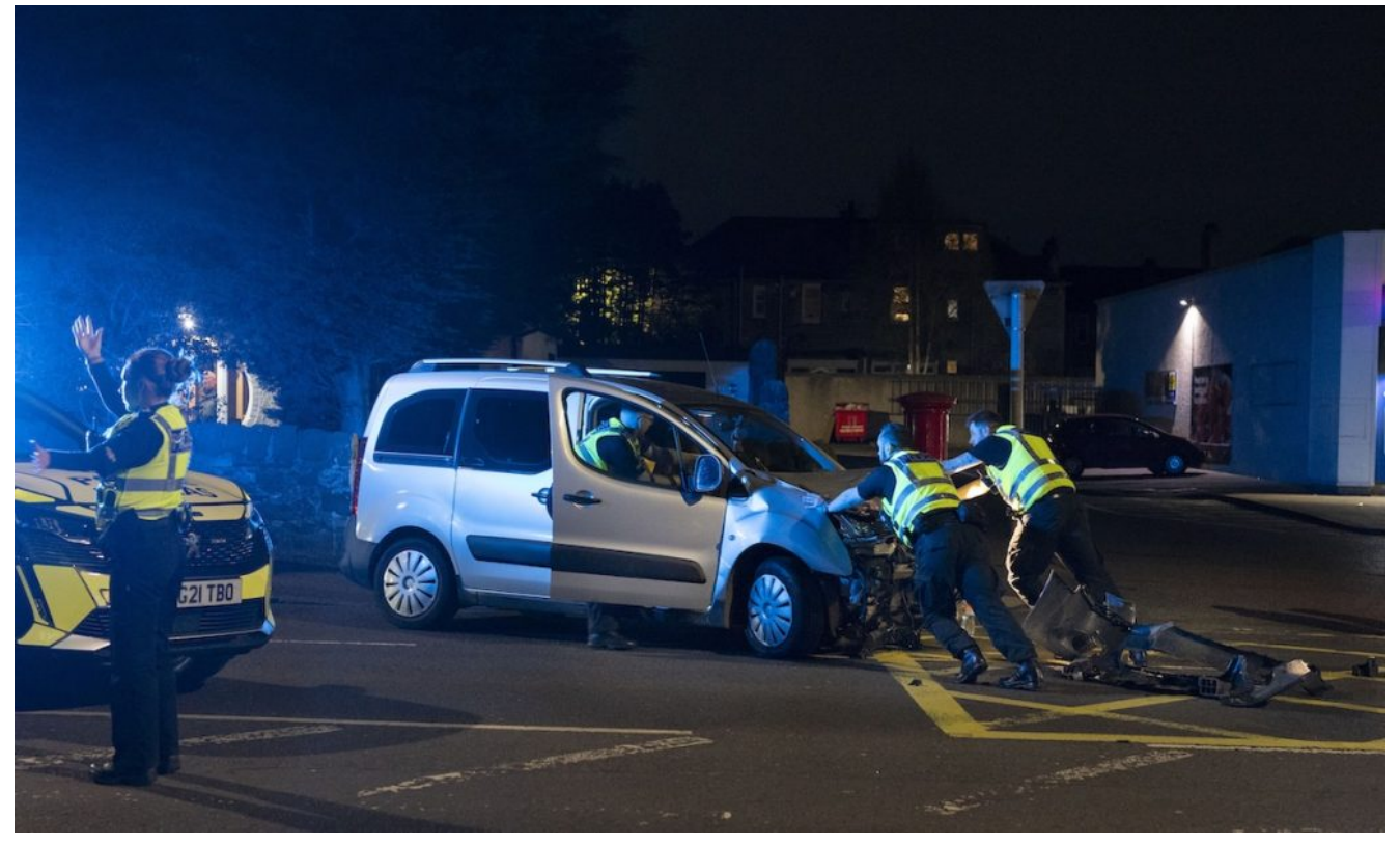
RTC Queensferry Road at Parkgrove Picture Alan Simpson 11/4/2024