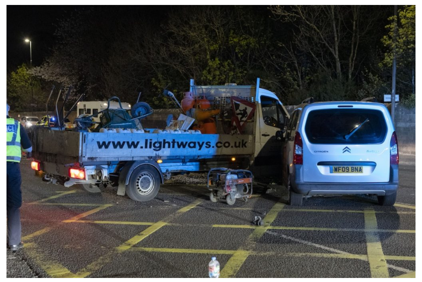
RTC Queensferry Road at Parkgrove 11/4/2024