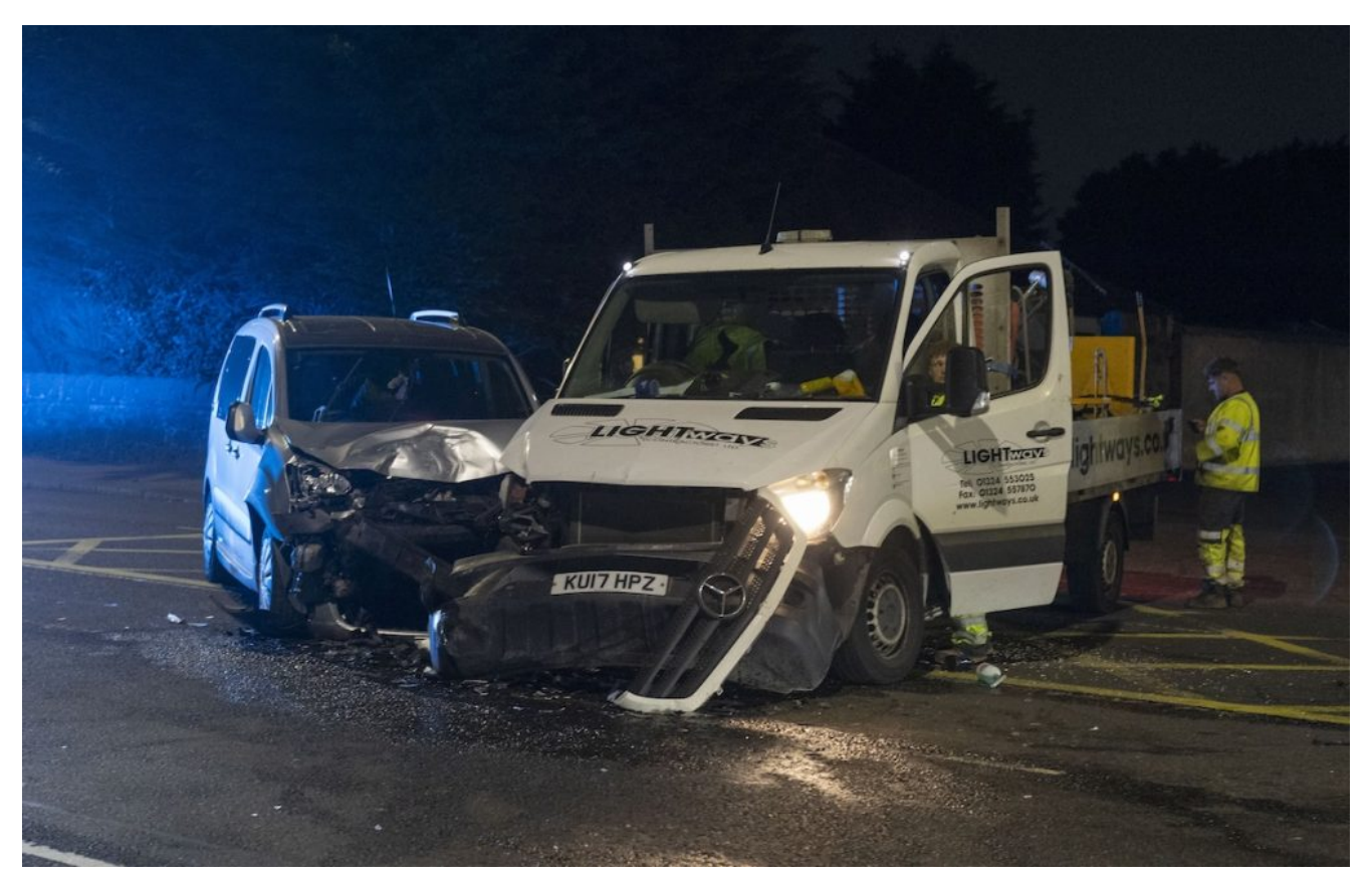
RTC Queensferry Road at Parkgrove 11/4/2024