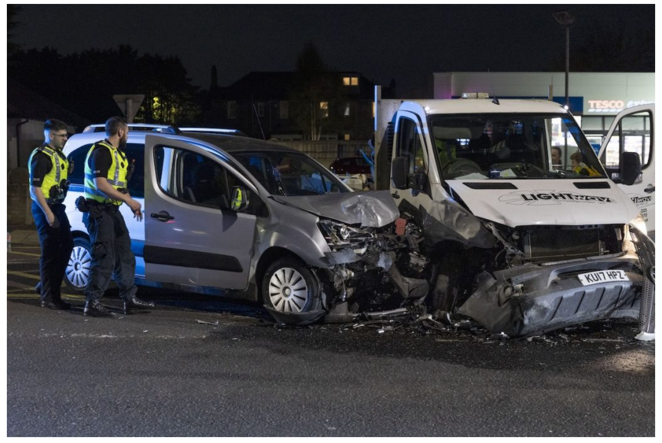
RTC Queensferry Road at Parkgrove Picture Alan Simpson 11/4/2024