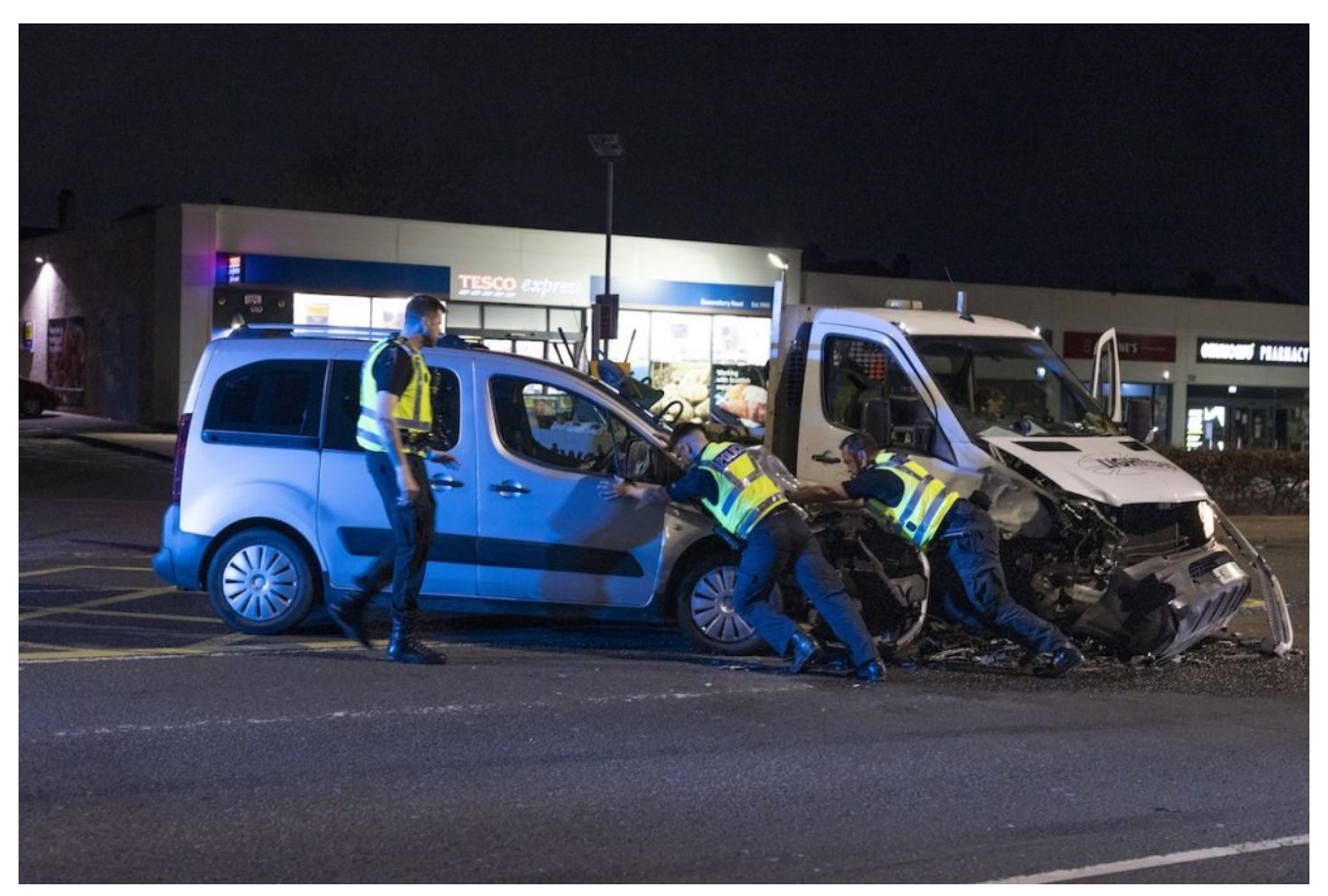
RTC Queensferry Road at Parkgrove Picture Alan Simpson 11/4/2024