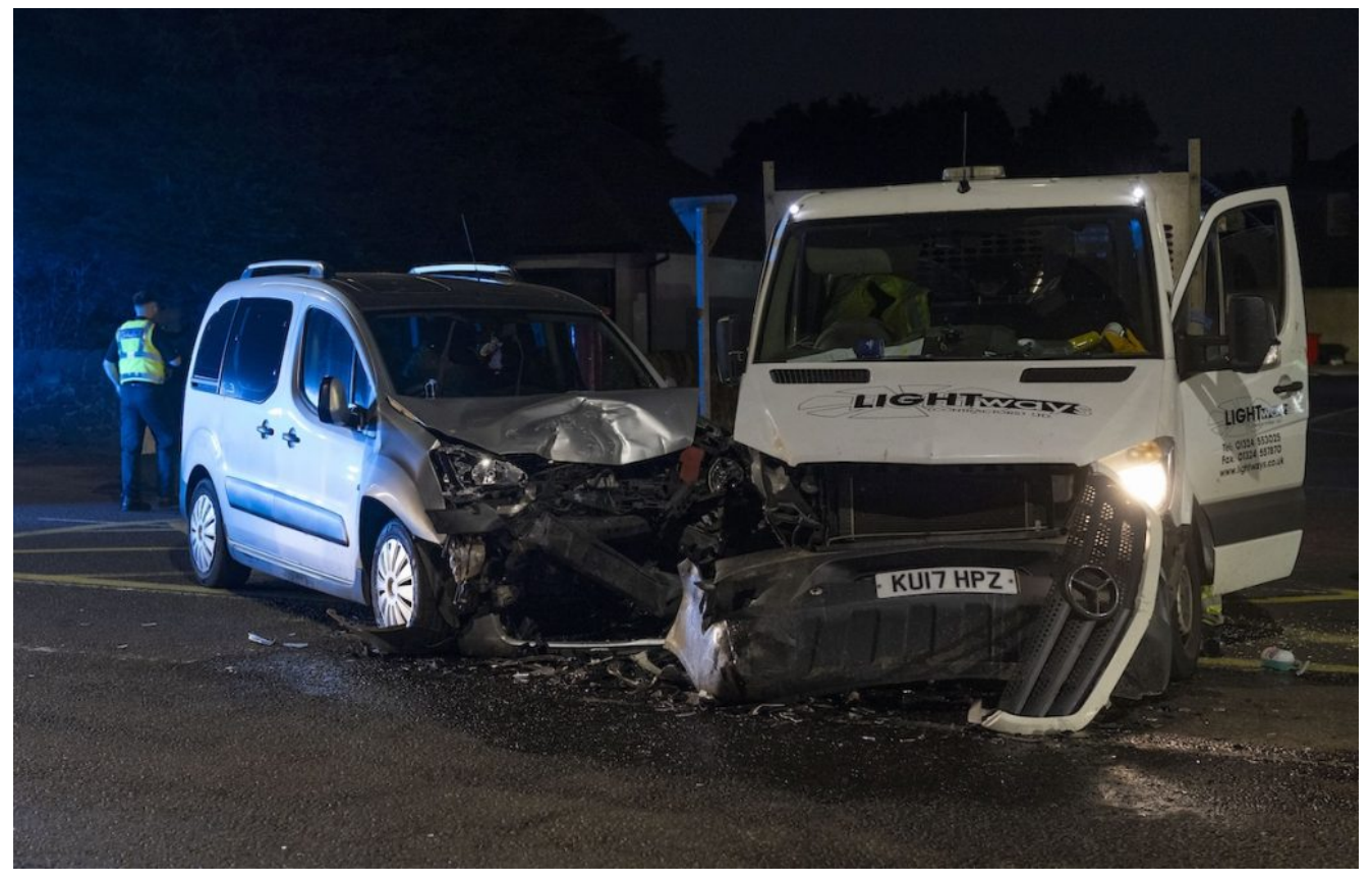
RTC Queensferry Road at Parkgrove Picture Alan Simpson 11/4/2024