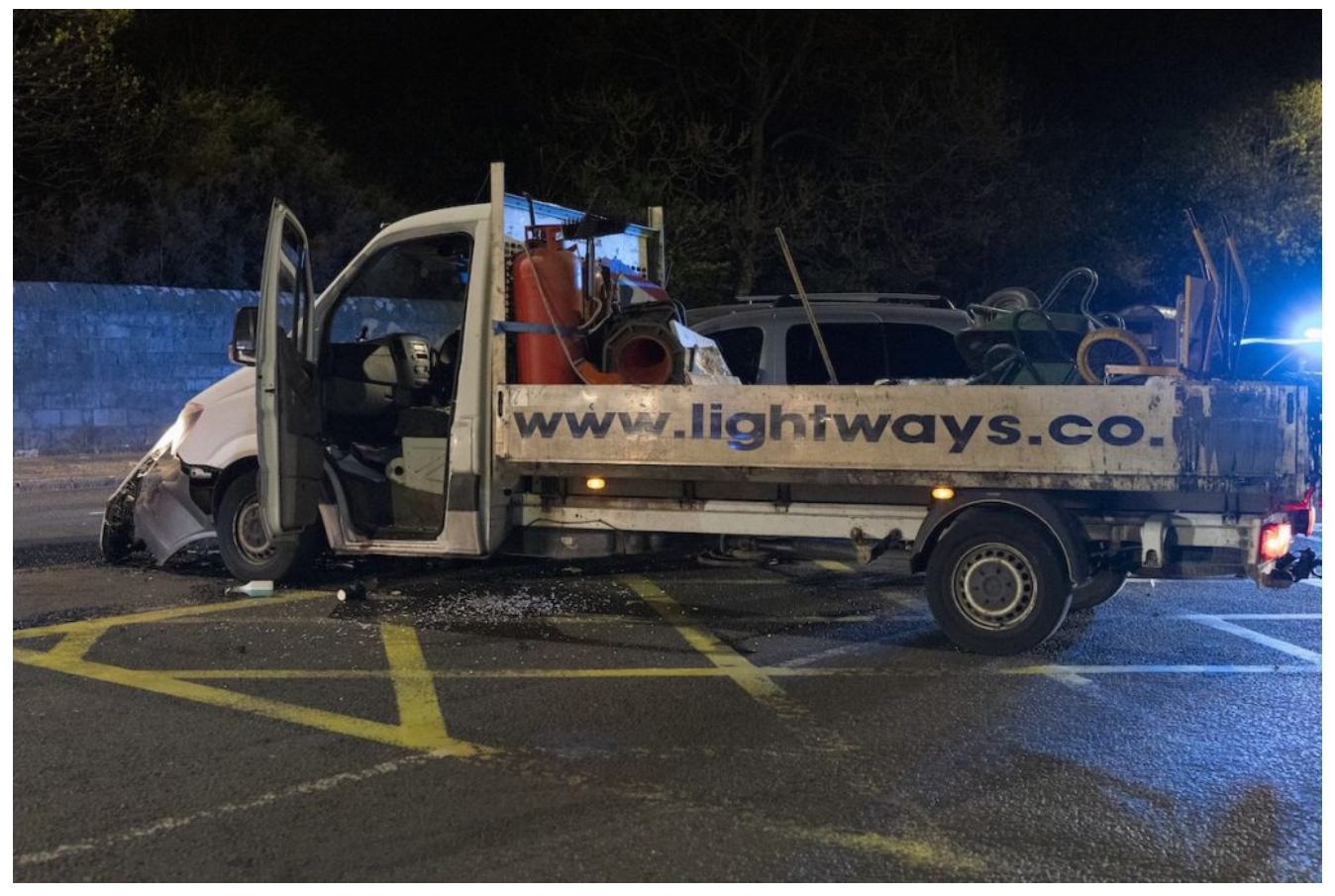
RTC Queensferry Road at Parkgrove 11/4/2024