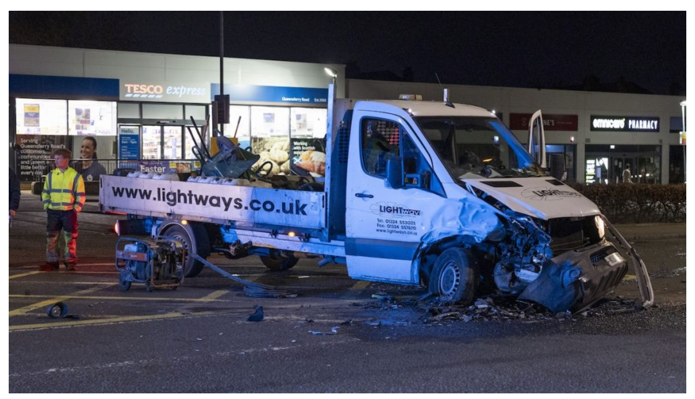
RTC Queensferry Road at Parkgrove 11/4/2024