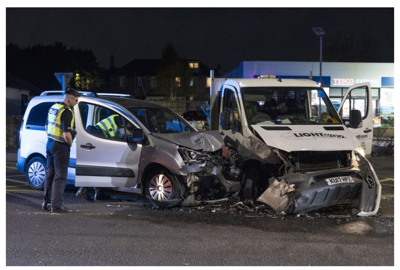
RTC Queensferry Road at Parkgrove Picture Alan Simpson 11/4/2024