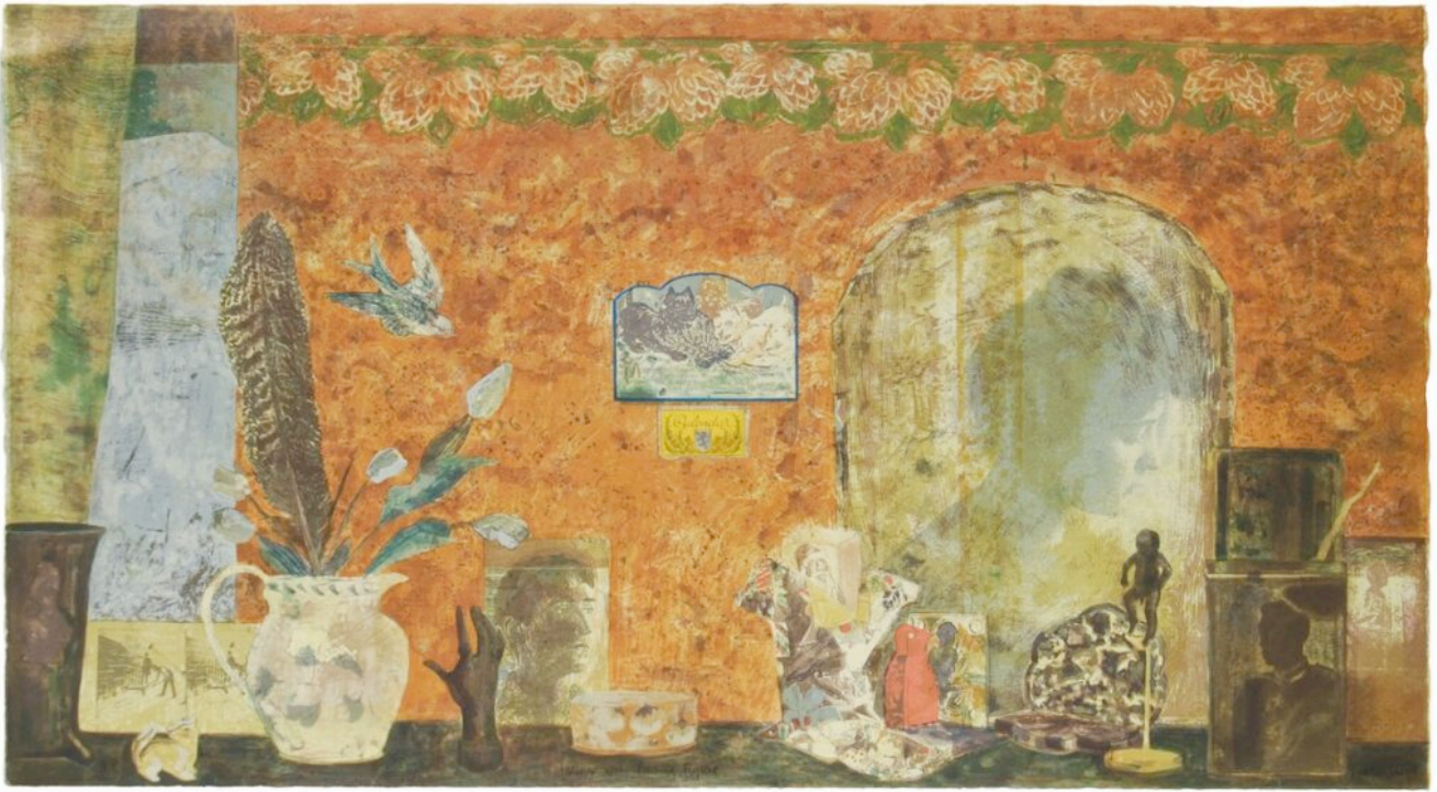
EP Collection Victoria Crowe, Interior with Passing Figure