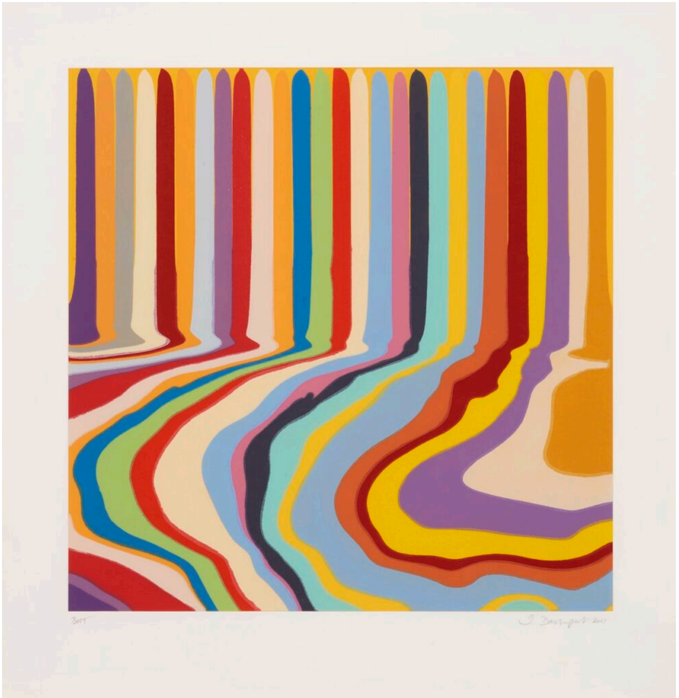
Jerwood Collection Davenport Colorplan Series. Citric Etching