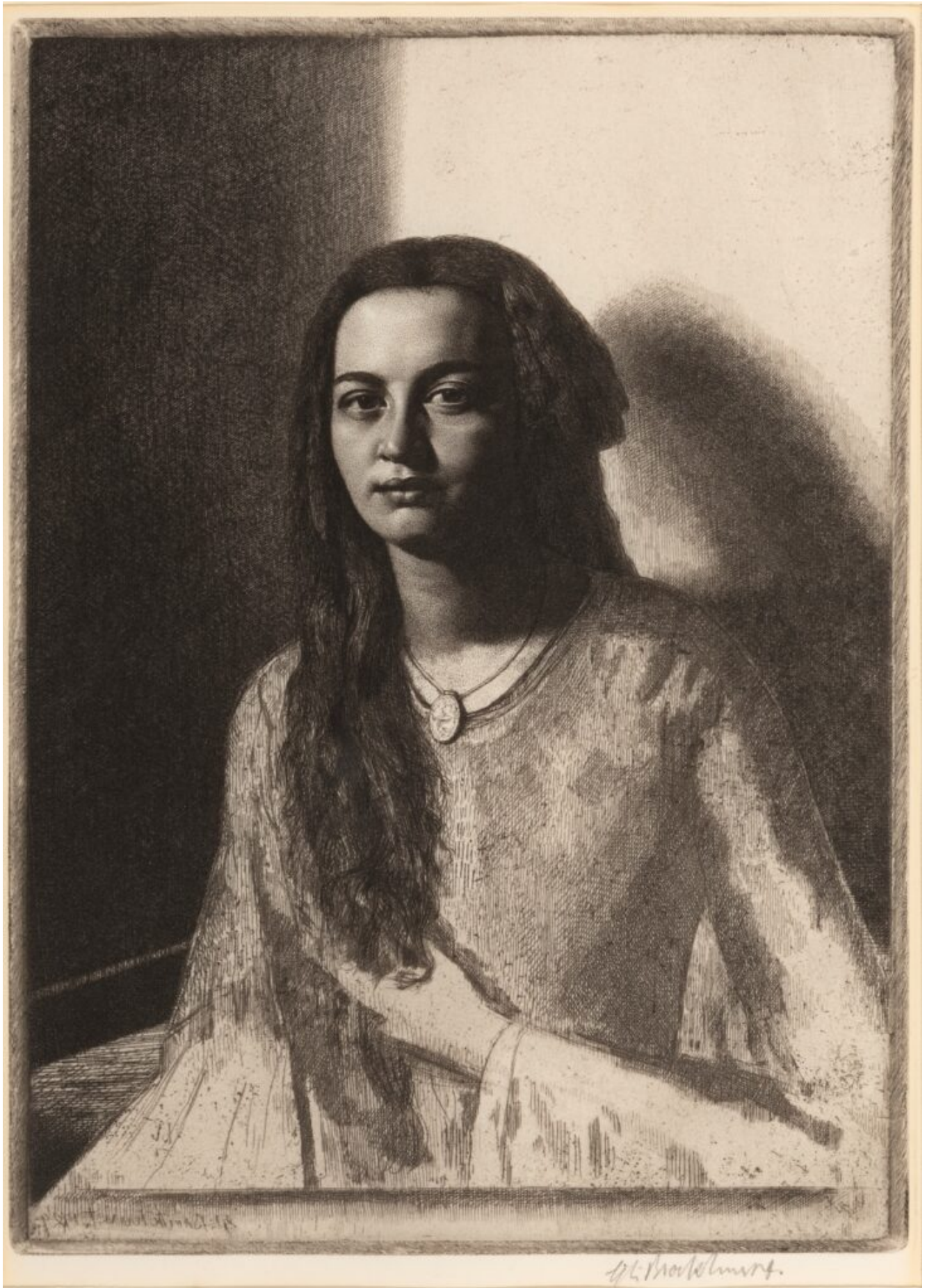
Jerwood Collection Brockhurst Una