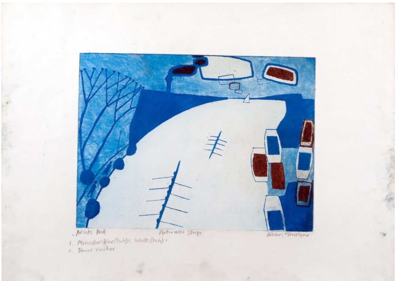
Jerwood Collection Trevelyan Activated Sludge