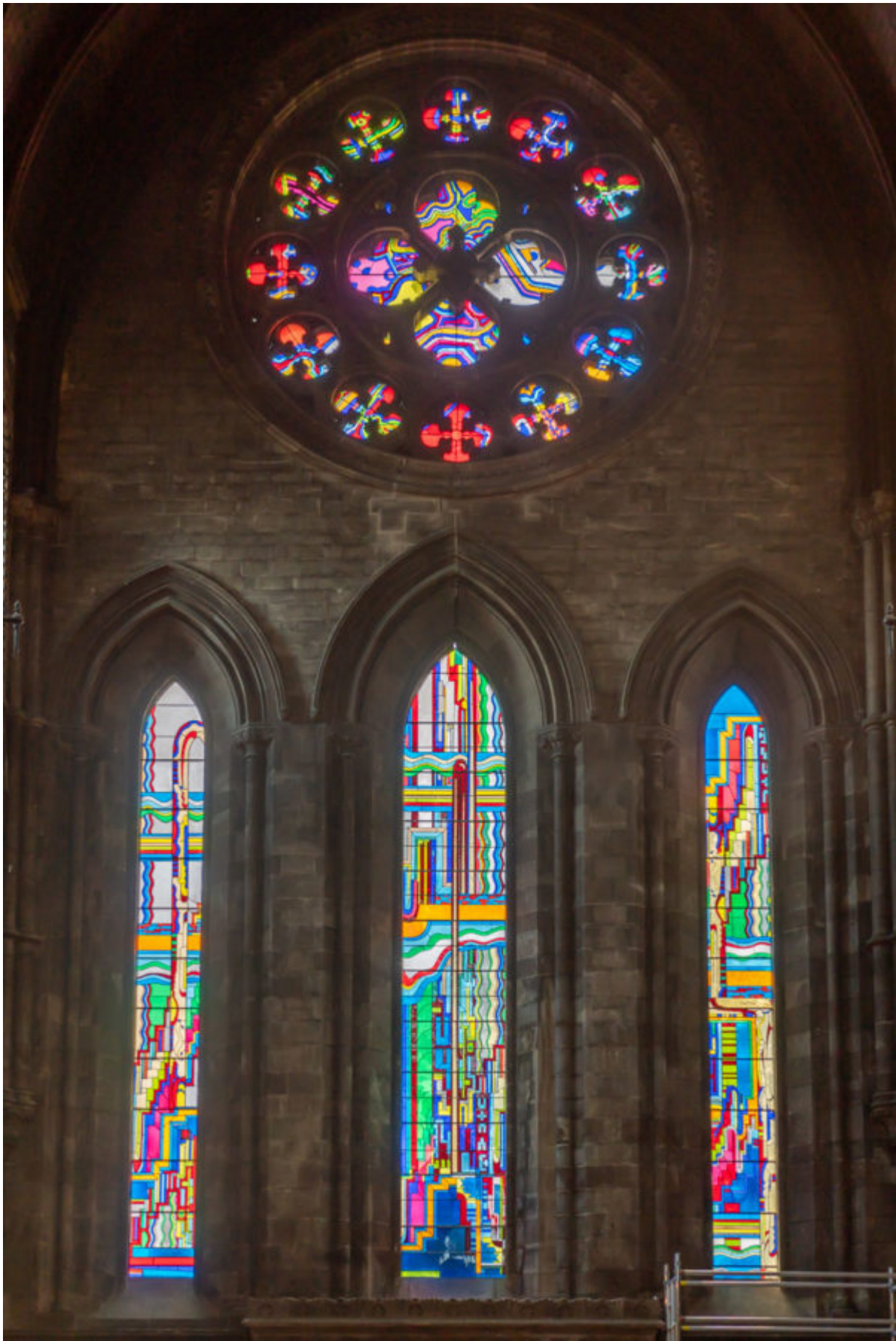
The Millennium Windows – designed by Sir Eduardo Paolozz in St Mary's Episcopal Cathedral.