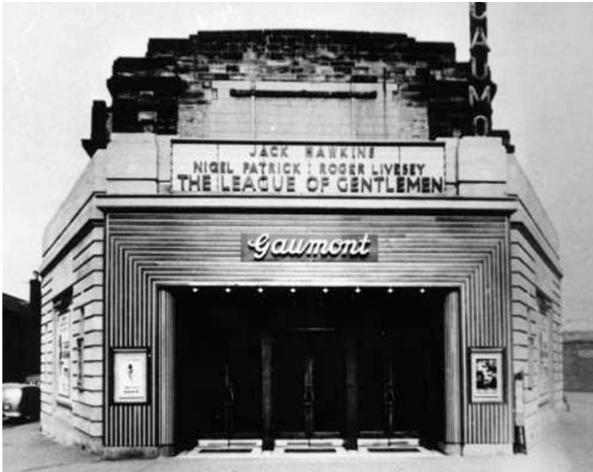
Rutland / Gaumont Cinema, 4-8 Canning Street, Edinburgh.