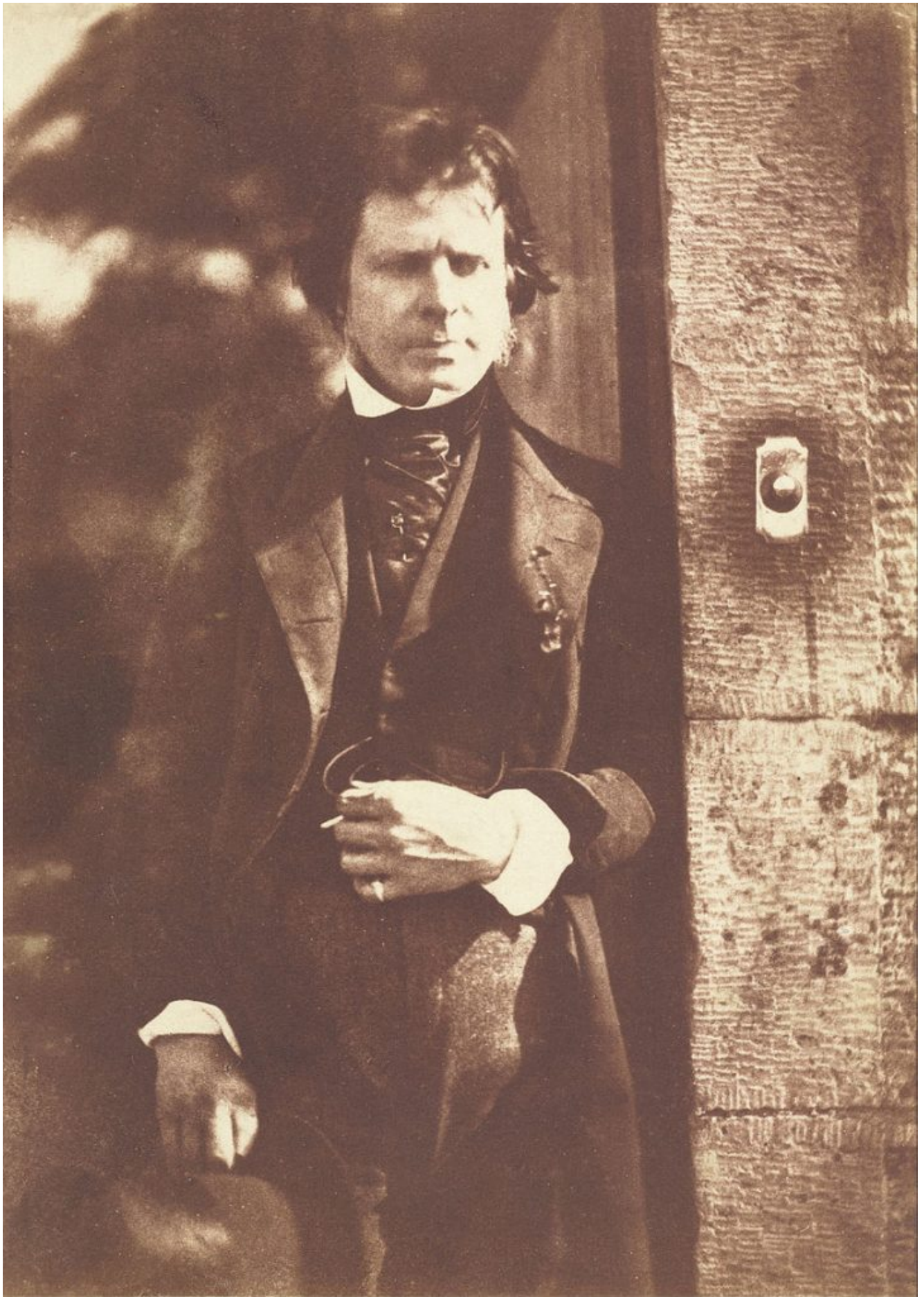
David Octavius Hill 17 May 1870 18th In 1843, after intense debate, 121 ministers and 73