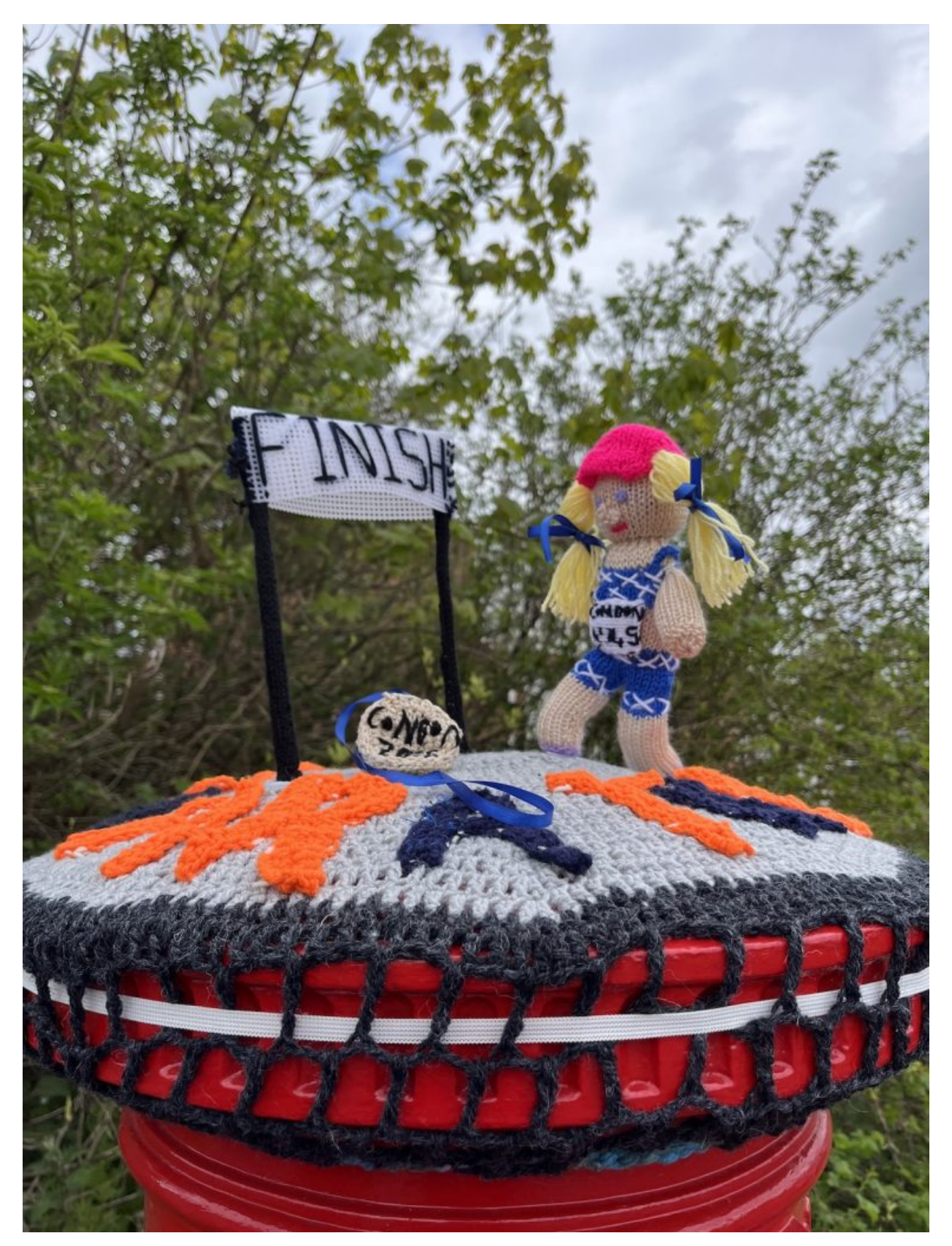
She has been a dedicated supporter of the charity "Walk the Walk," which organises the Moonwalk in Edinburgh and elsewhere, and she has participated in numerous charity events in Scotland and elsewhere for almost two decades.