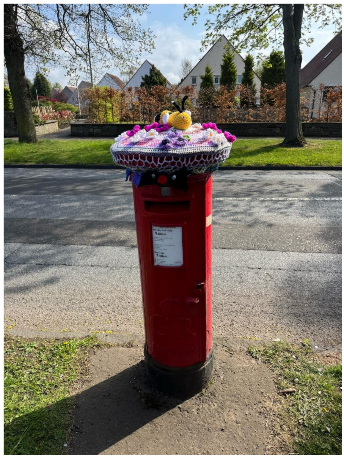
Postbox on Ravelston Dykes