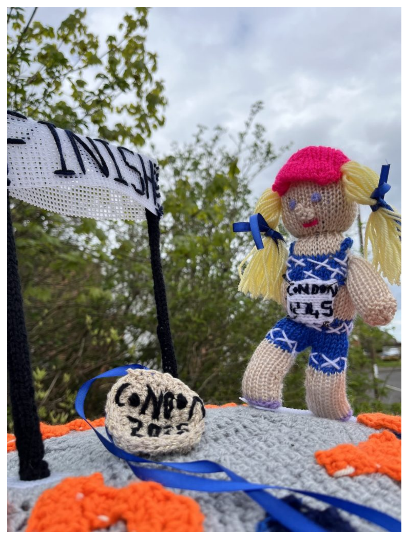
Margaret's marathon creation in Tranent