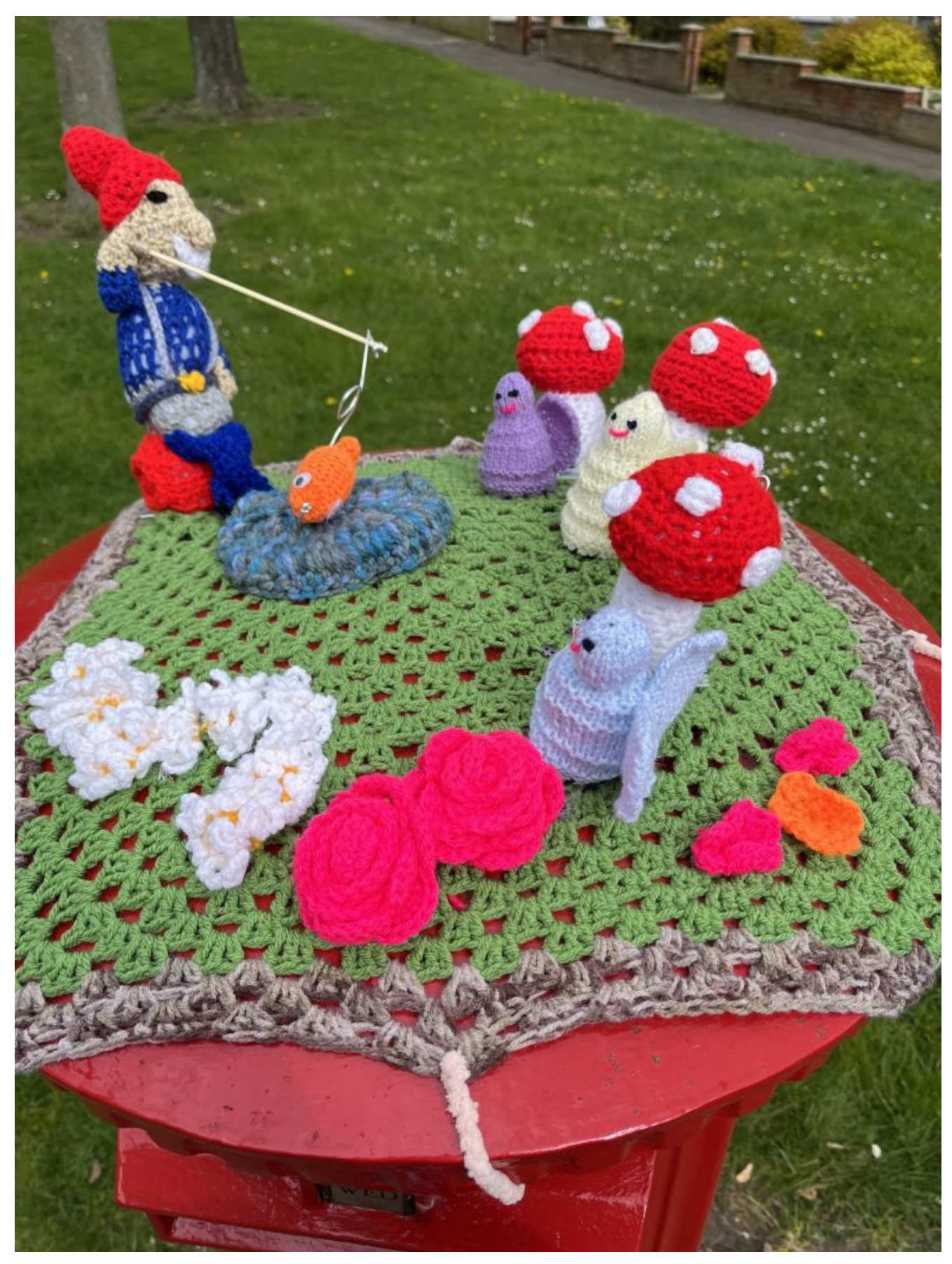
The topper in Carlaverock Avenue in Tranent