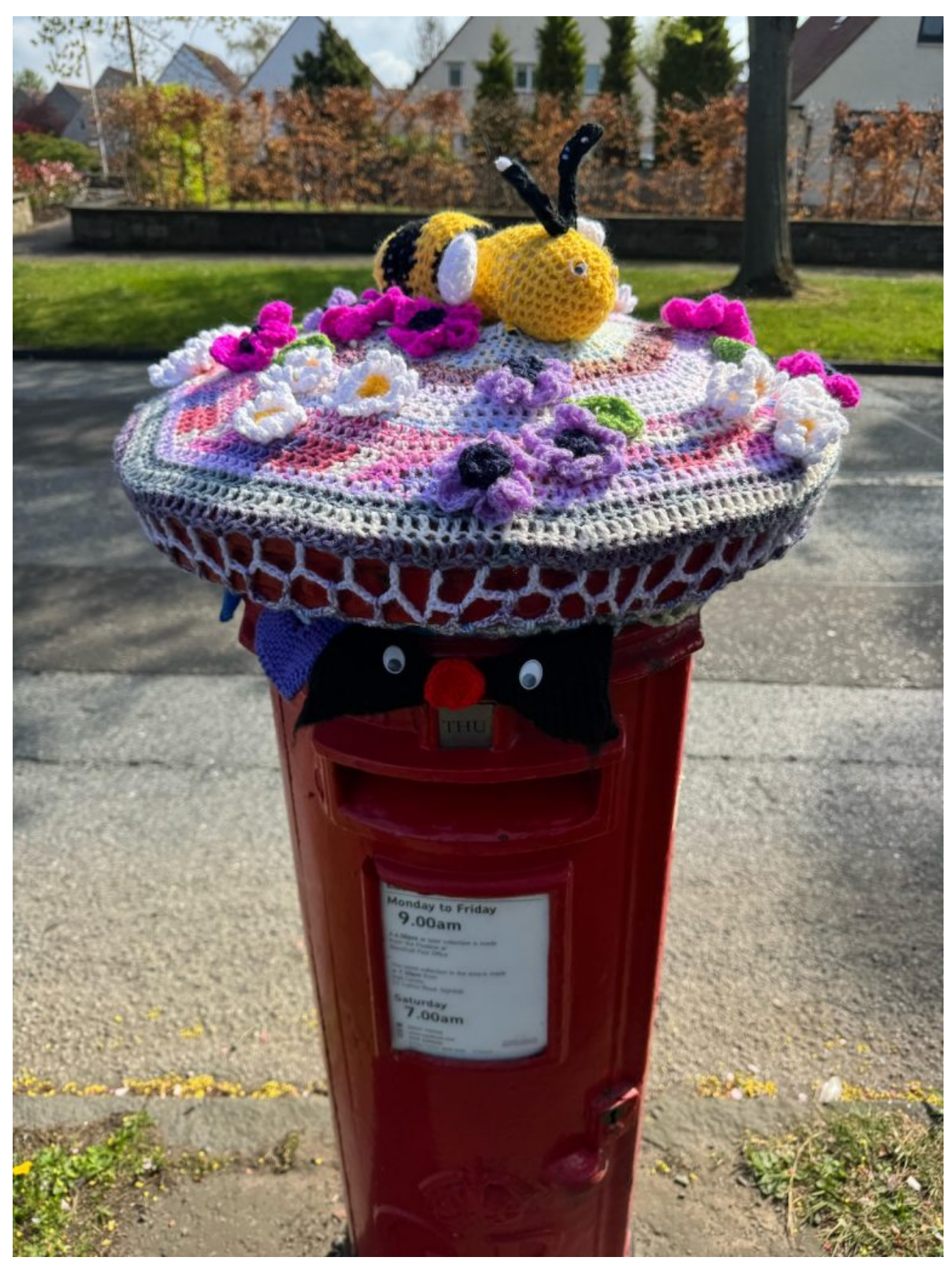
Postbox on Ravelston Dykes