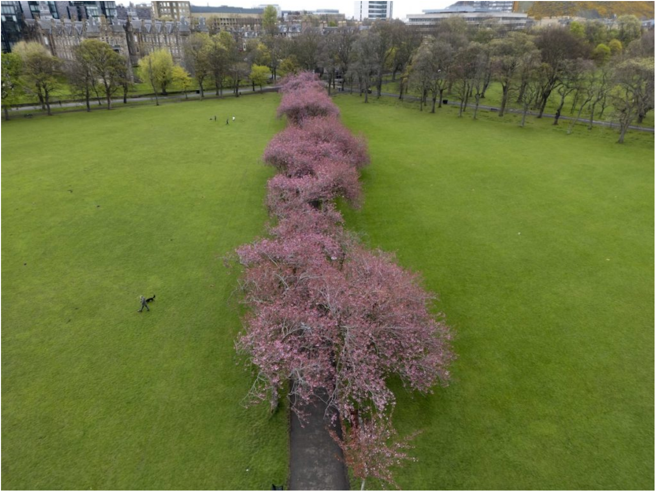
Blossom in The Meadows 15/4/2024