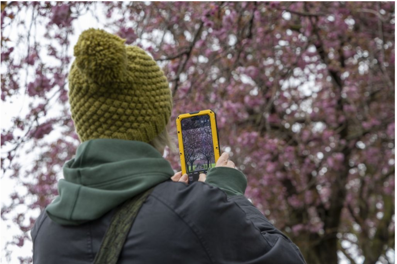
Blossom in The Meadows Picture Alan Simpson 15/4/2024