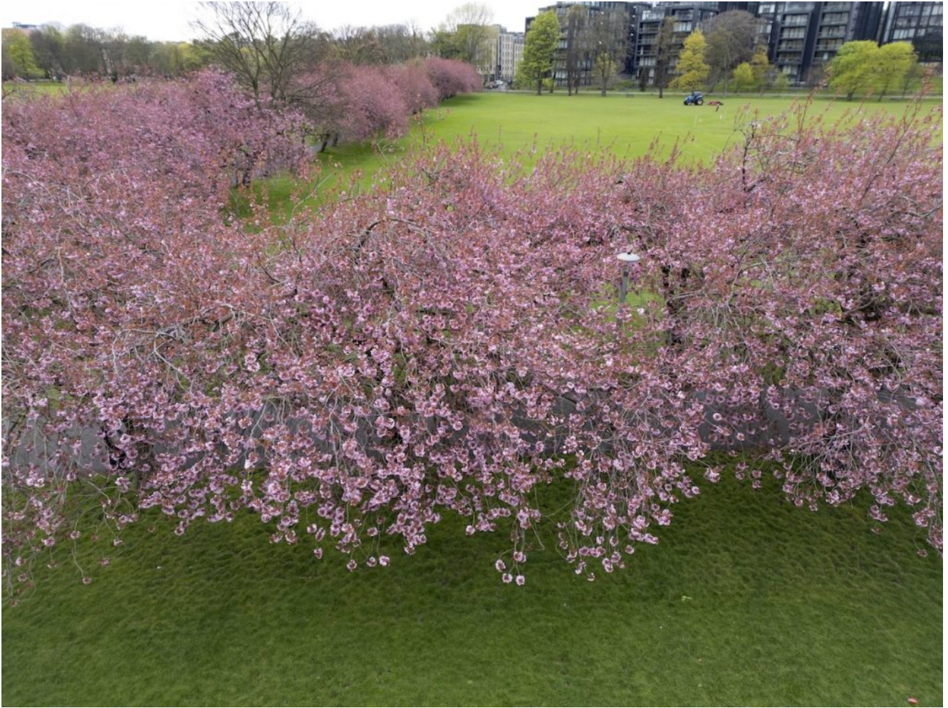
Blossom in The Meadows Picture Alan Simpson 15/4/2024