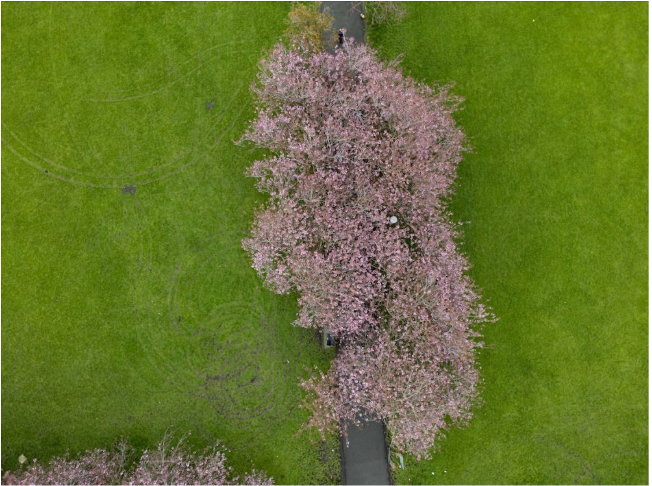
Blossom in The Meadows 15/4/2024