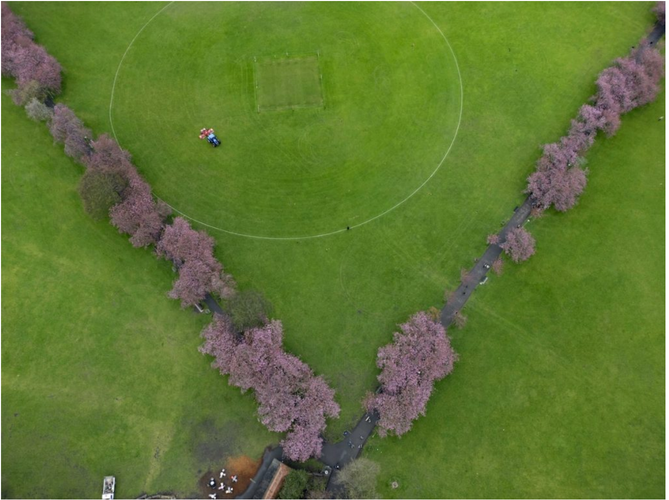
Blossom in The Meadows 15/4/2024