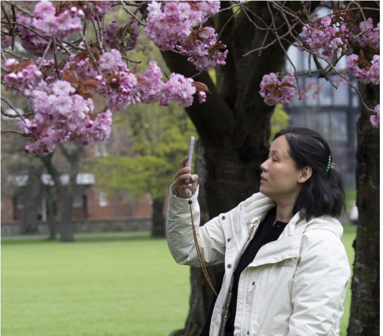
Blossom in The Meadows Picture Alan Simpson 15/4/2024