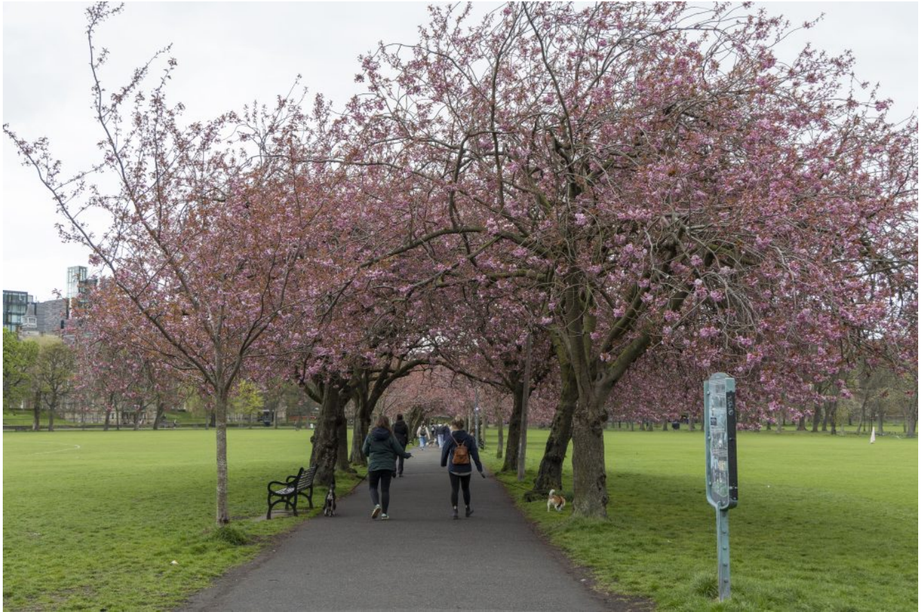
Blossom in The Meadows Picture Alan Simpson 15/4/2024