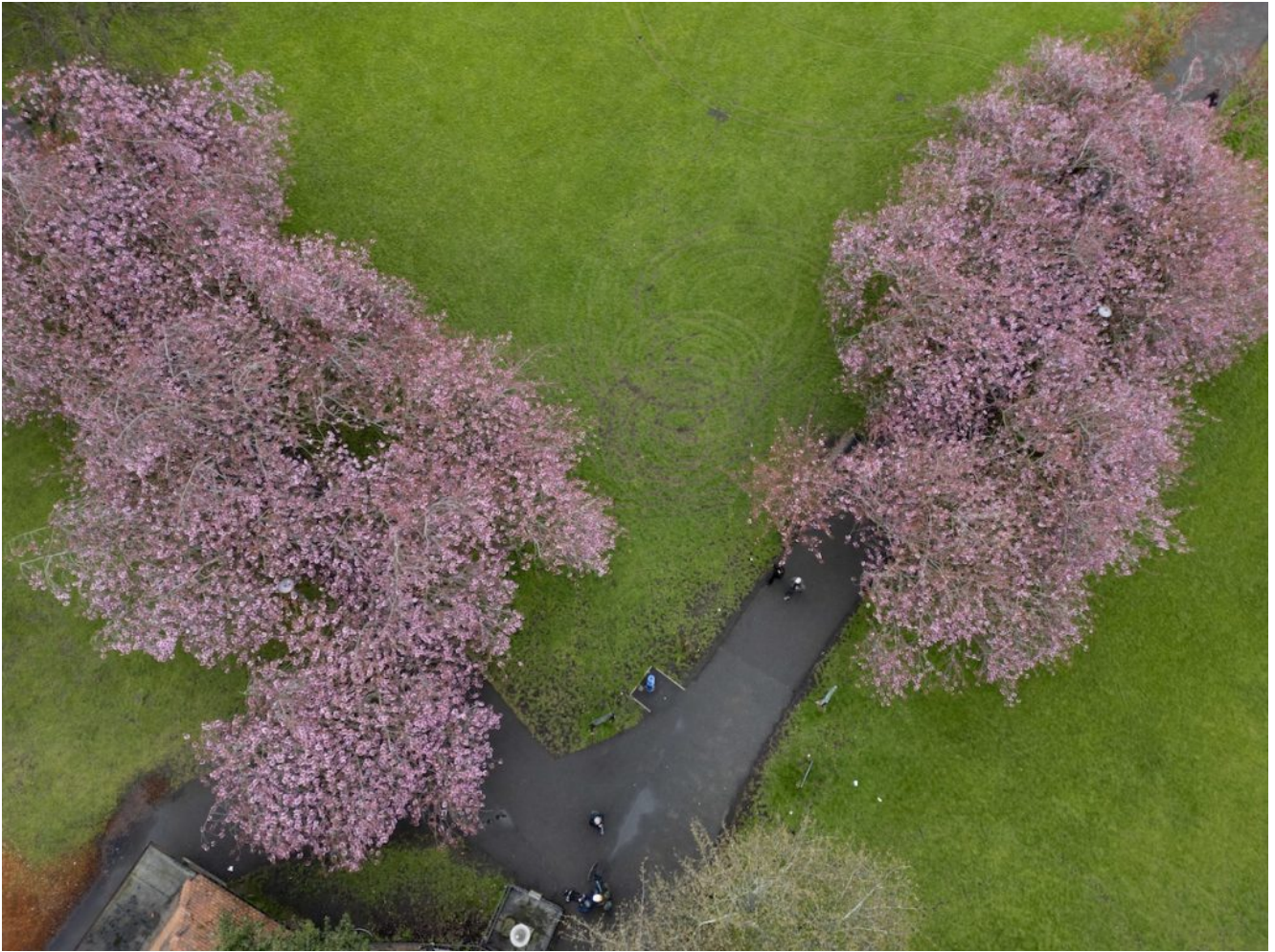
Blossom in The Meadows 15/4/2024