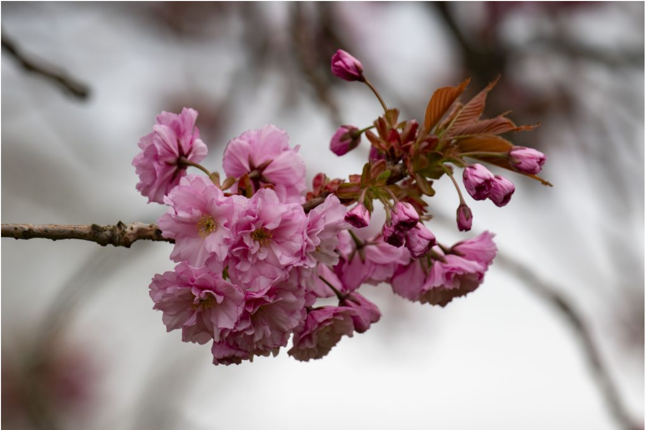
Blossom in The Meadows Picture Alan Simpson 15/4/2024