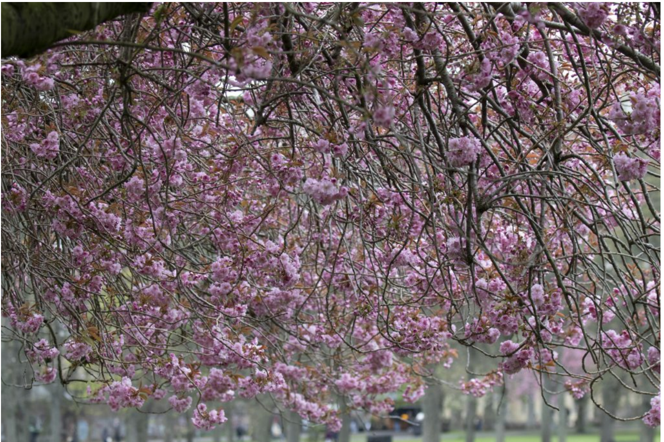
Blossom in The Meadows 15/4/2024