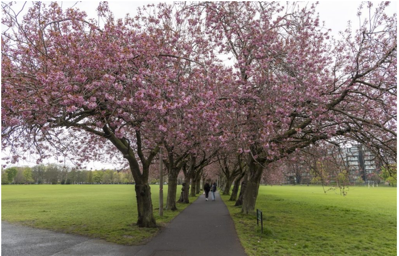
Blossom in The Meadows 15/4/2024