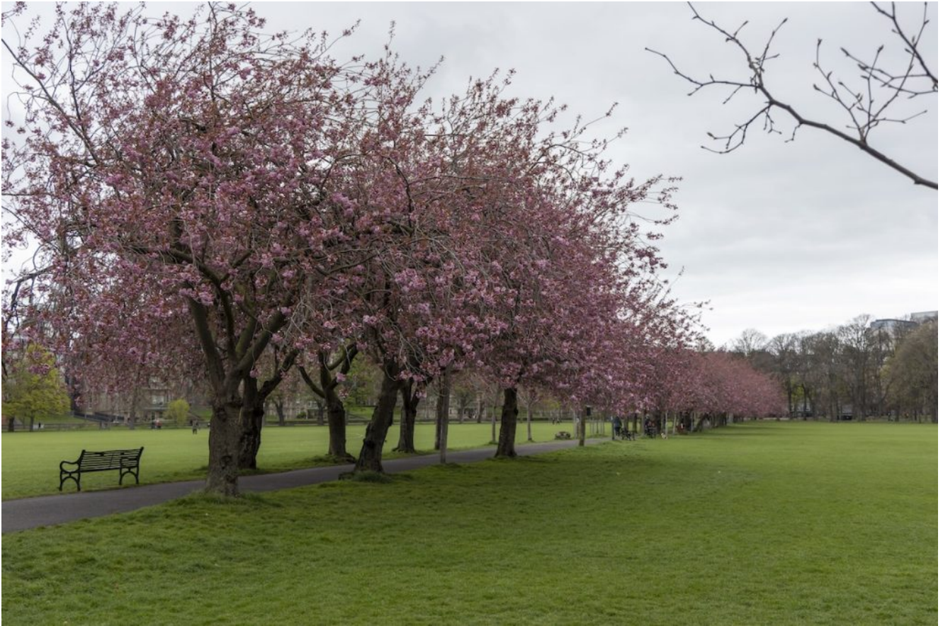
Blossom in The Meadows 15/4/2024