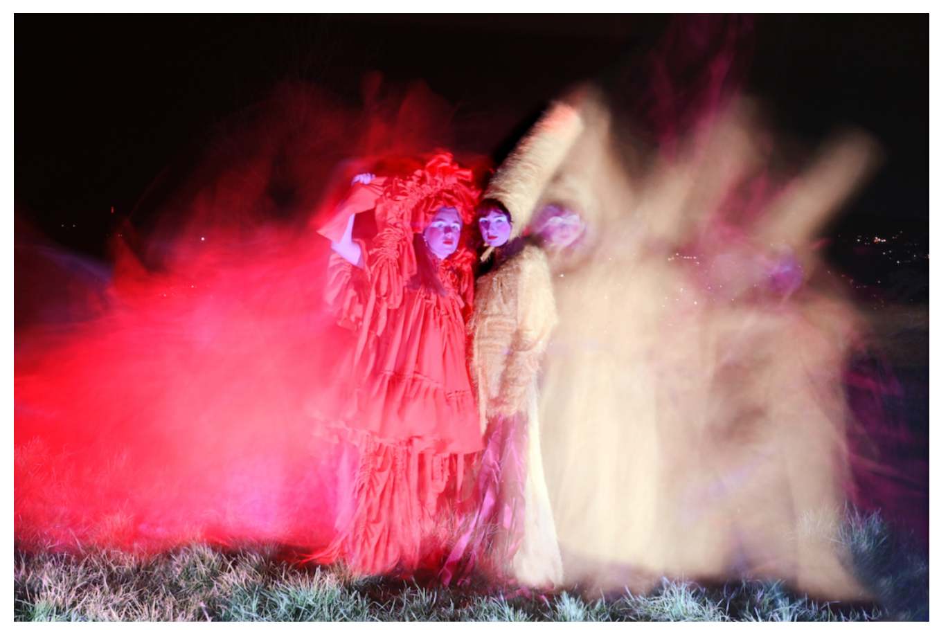
Mermaid Chunky