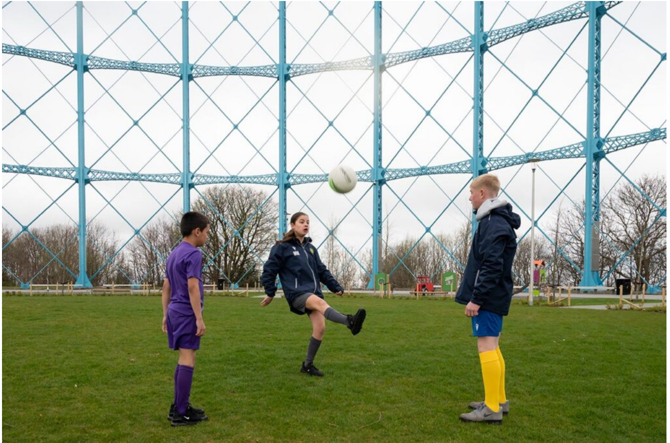
At Gasholder 1 on Friday ahead of the opening ceremony