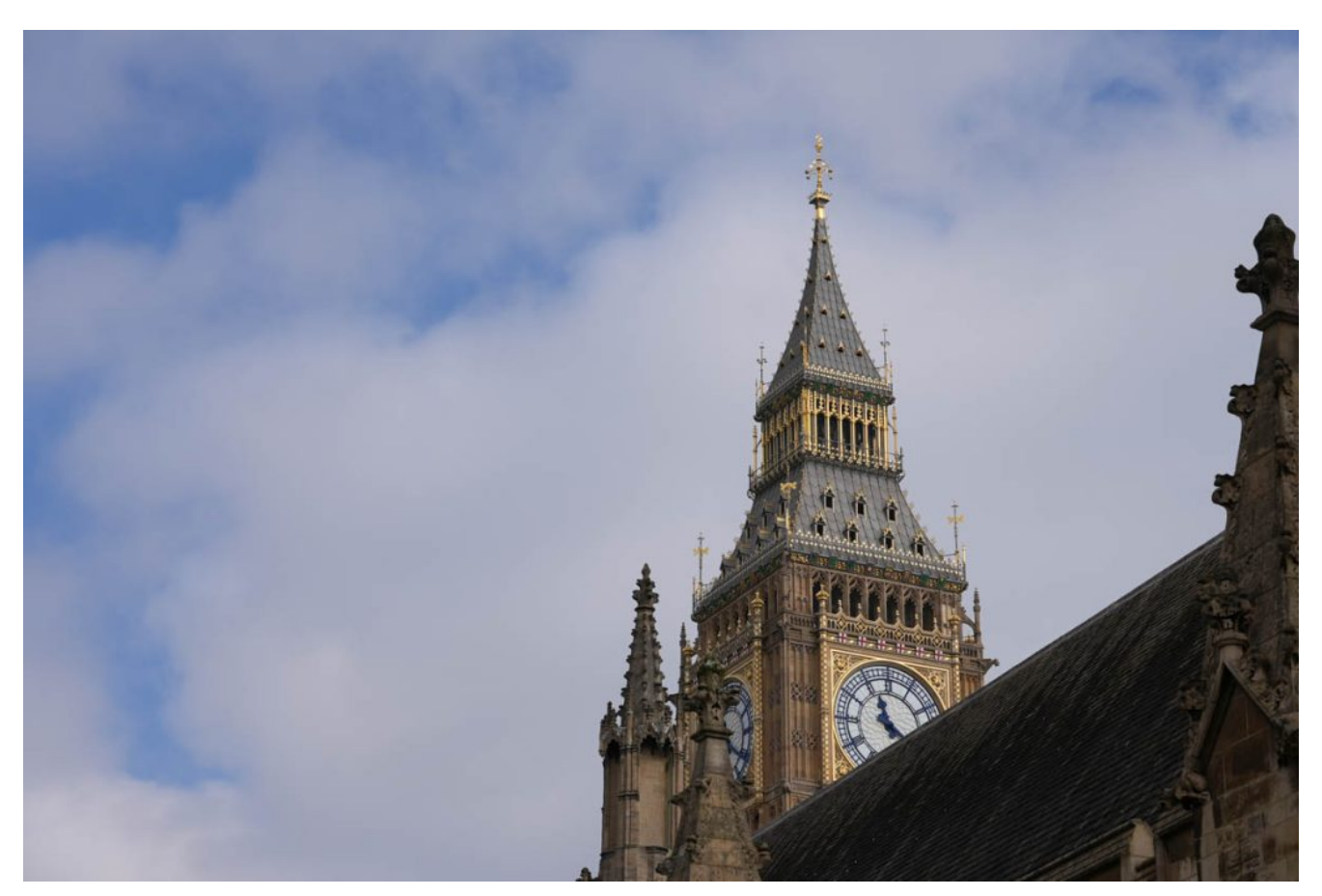
Big Ben Westminster

You can watch all the proceedings from Westminster <a href="here">here</a>.