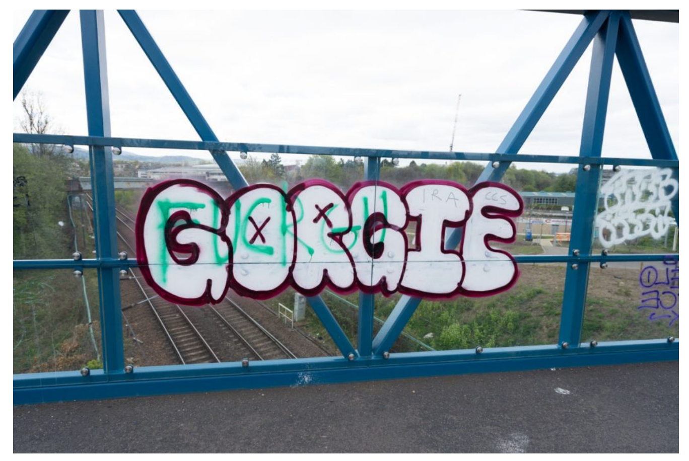
Grafitti Roseburn to Union Canal.