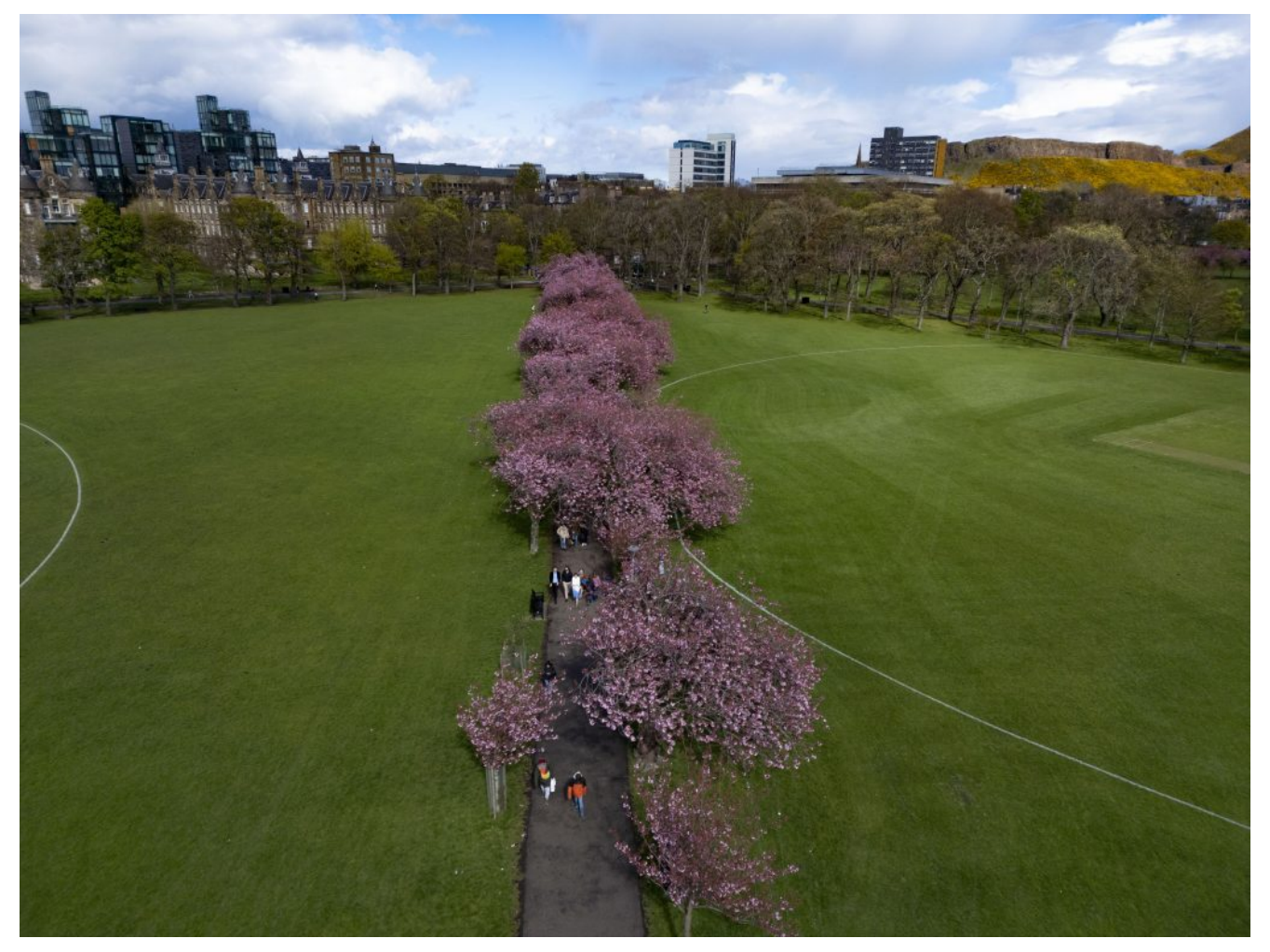
Aerial shot of the blossom in The Meadows 17/04/25

Click on the image below to see the latest collection of photos from The Meadows.