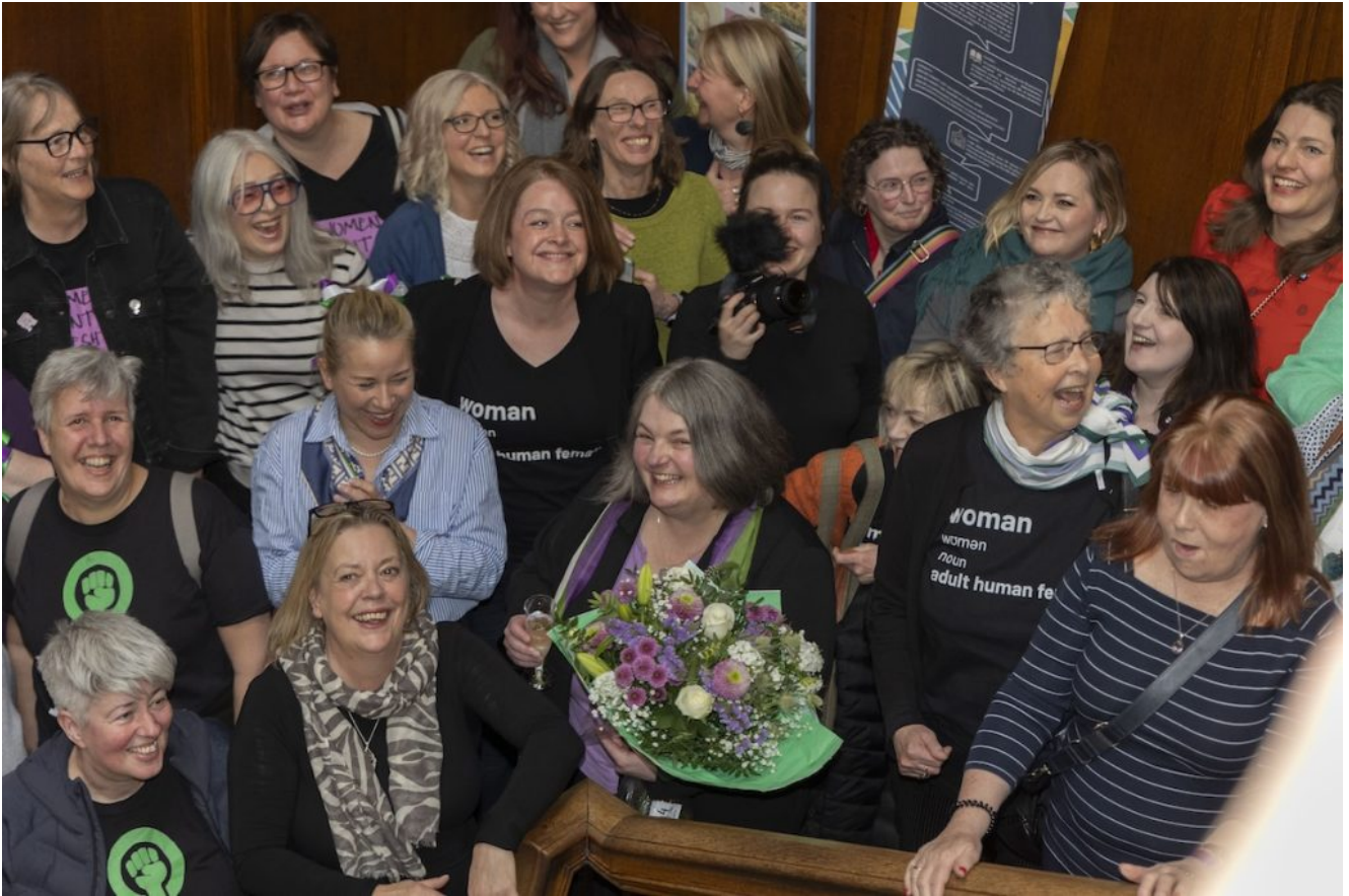
Jubilant scenes in Edinburgh after the Supreme Court ruling PHOTO Alan Simpson.