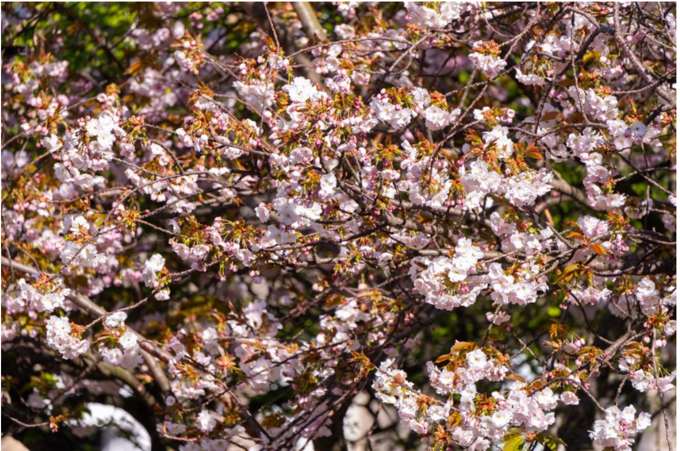
Cherry blossom coming into bloom in Moray Place