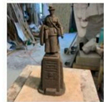
Clay Model studies