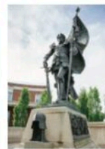
John Bull - Alexander Dalrymple