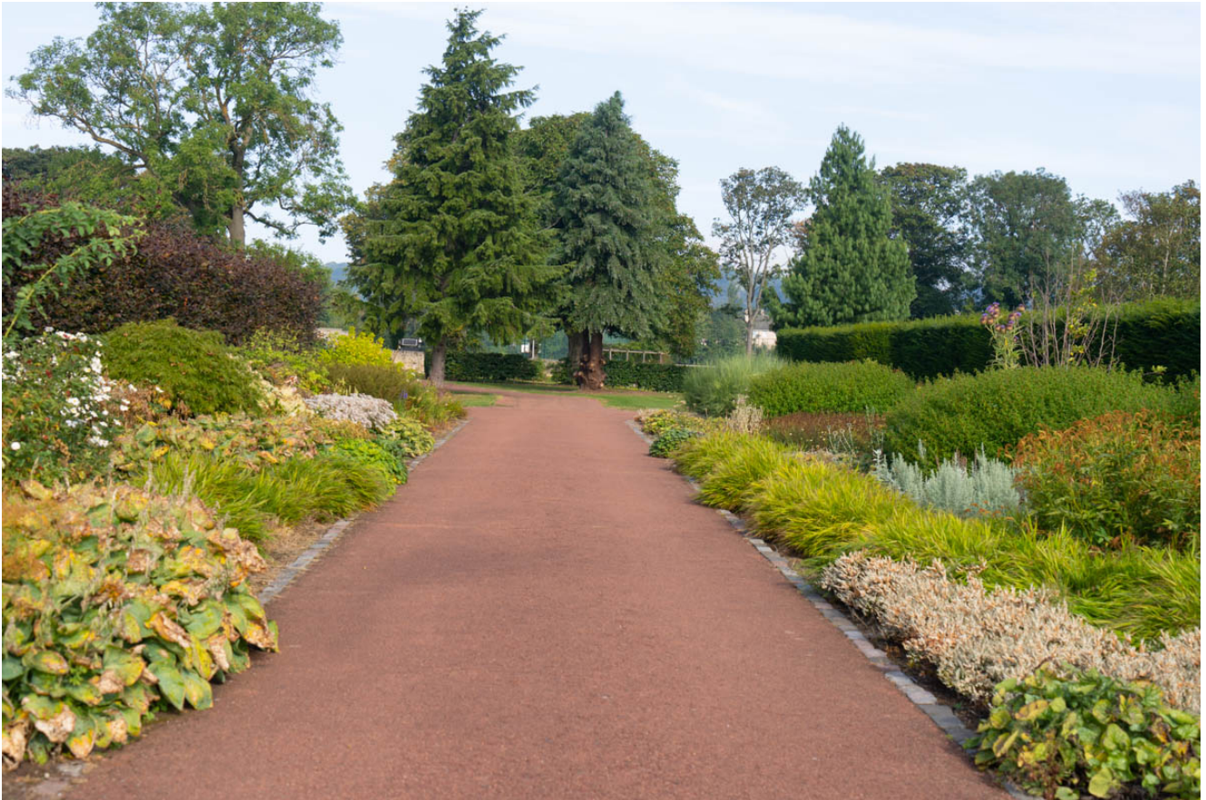
Saughton Park

other public spaces. Having rules means that the Council does not need to ask the Scottish Ministers for permission to make sure everyone uses our spaces properly and safely. The management rules shall apply to the city's public parks, beaches, and green spaces. This will include the Pentland Hills Regional Park. This is in line with the Scottish Outdoor Access Code .