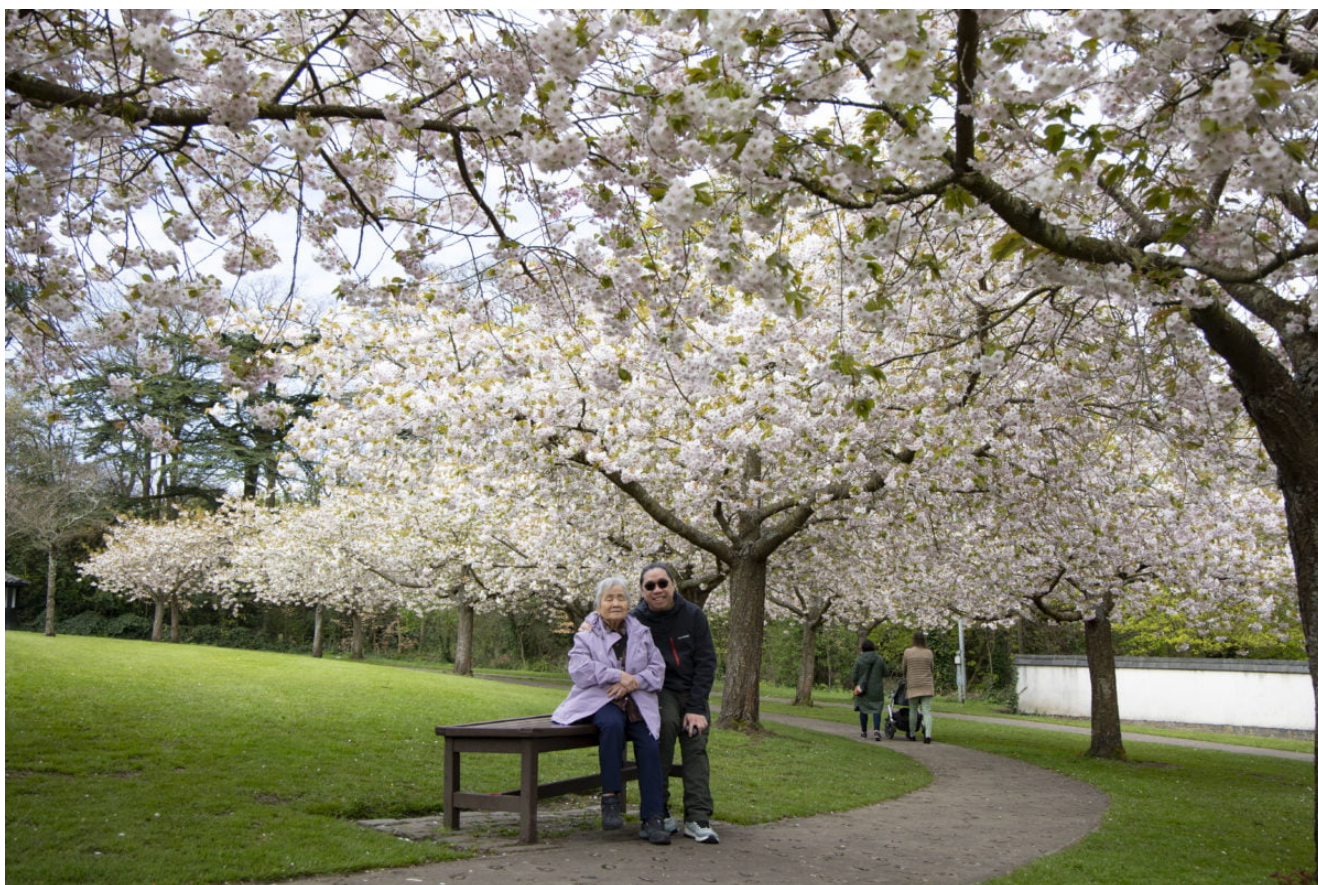
18/4/2024 Lauriston Castle Edinburgh Japan Sakura Festival.

It is a wee bit early for the blossom in the Japanese garden but you might be lucky.