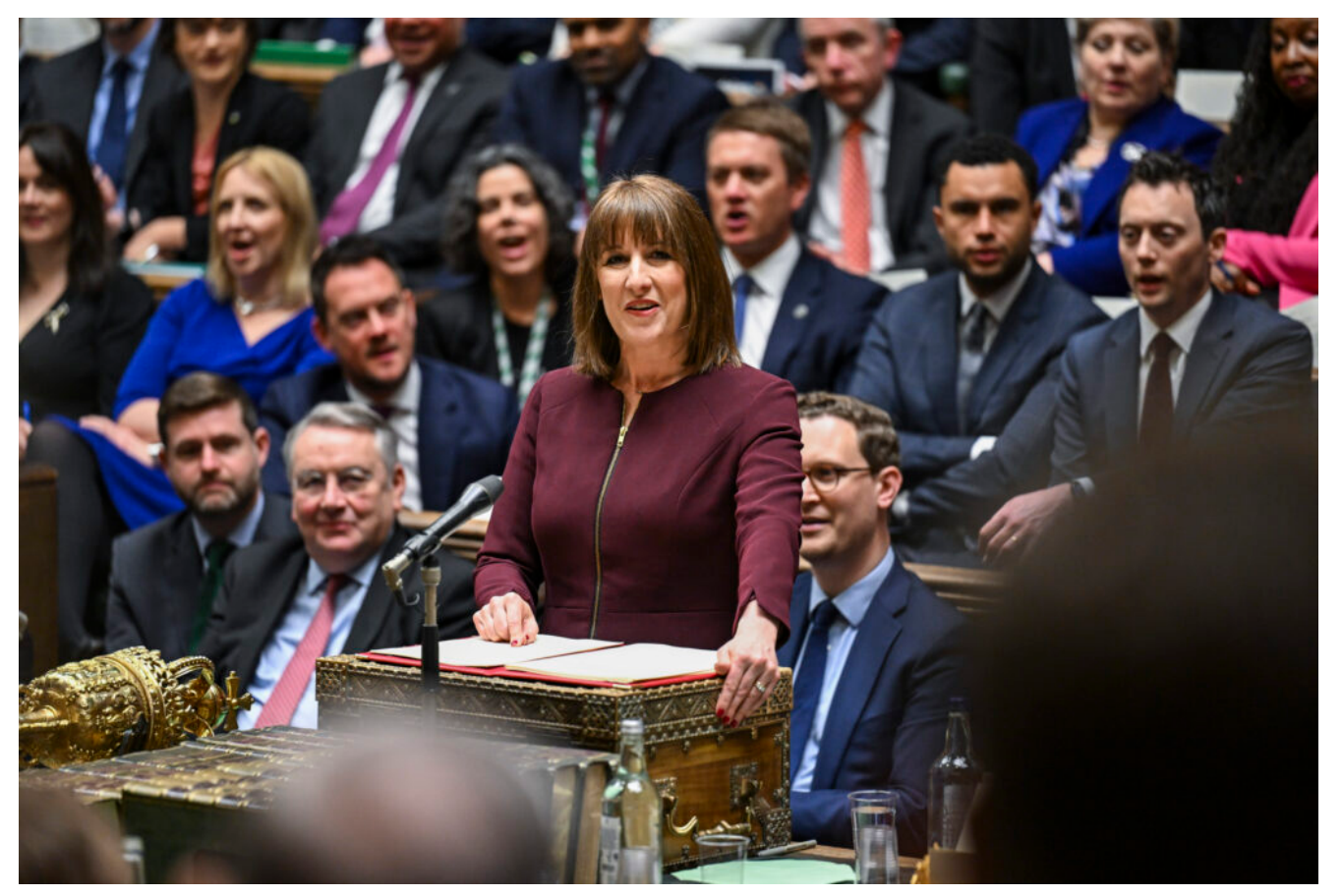
Rachel Reeves MP, The Chancellor of the Exchequer (Leeds West and Pudsey, Labour)

The Treasury Committee will question the Chancellor of the Exchequer, Rt Hon. Rachel Reeves MP, on her Spring Statement at 2.30pm on Wednesday 2 April.