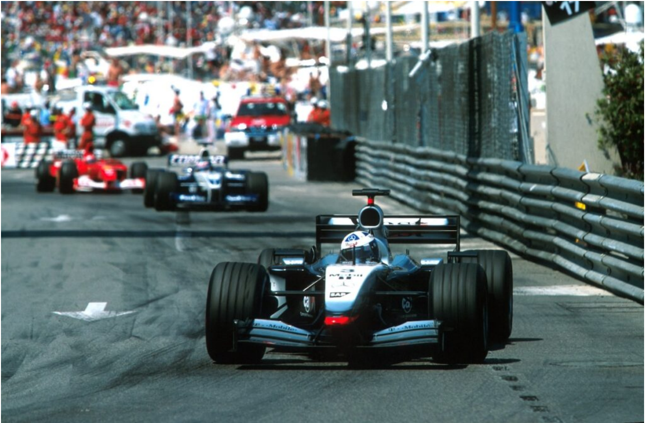
Race winner David Coulthard (GBR) McLaren Mercedes MP4-17 is chased by Juan Pablo Montoya (COL) BMW Williams FW24 and Michael Schumacher (GER) Ferrari F2002. Monaco Grand Prix, Rd7, Monte Carlo, Monaco. 26 May 2002.