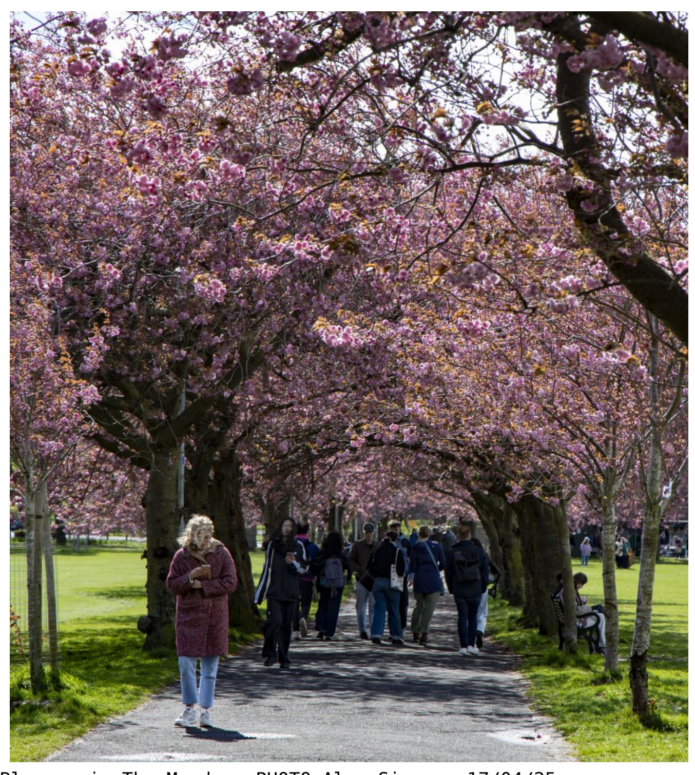
Blossom in The Meadows 17/04/25