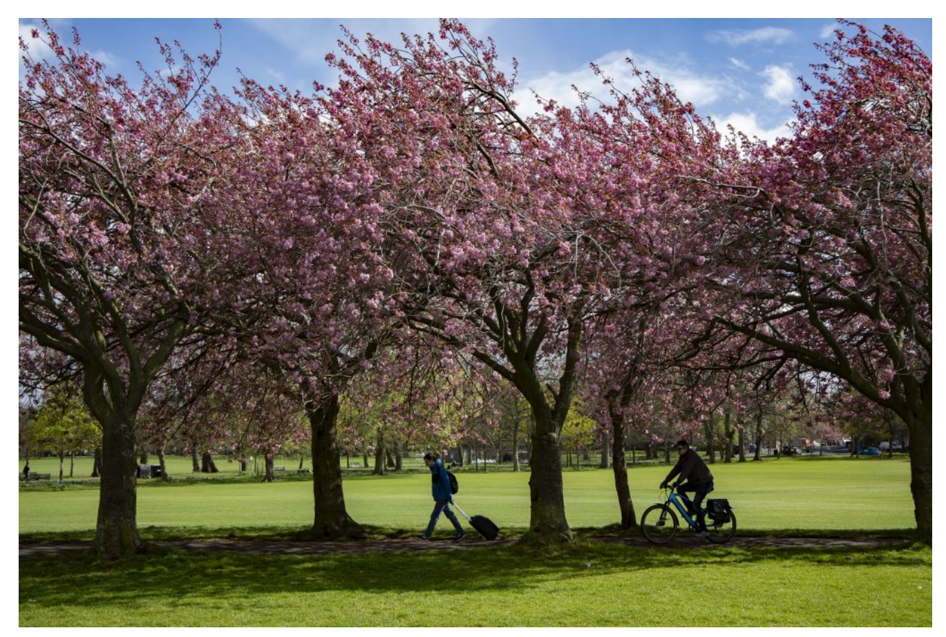
Blossom in The Meadows 17/04/25