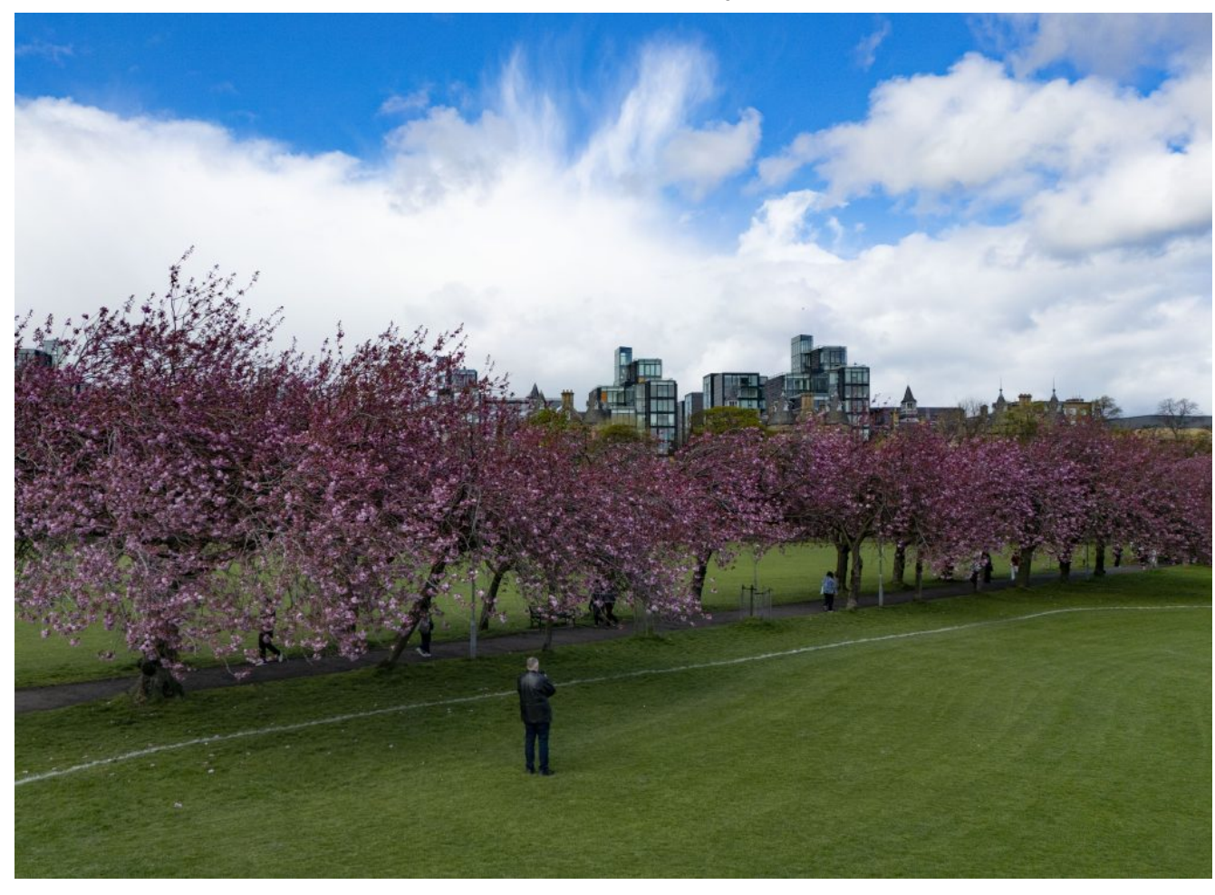
Blossom in The Meadows PHOTO Alan Simpson 17/04/25