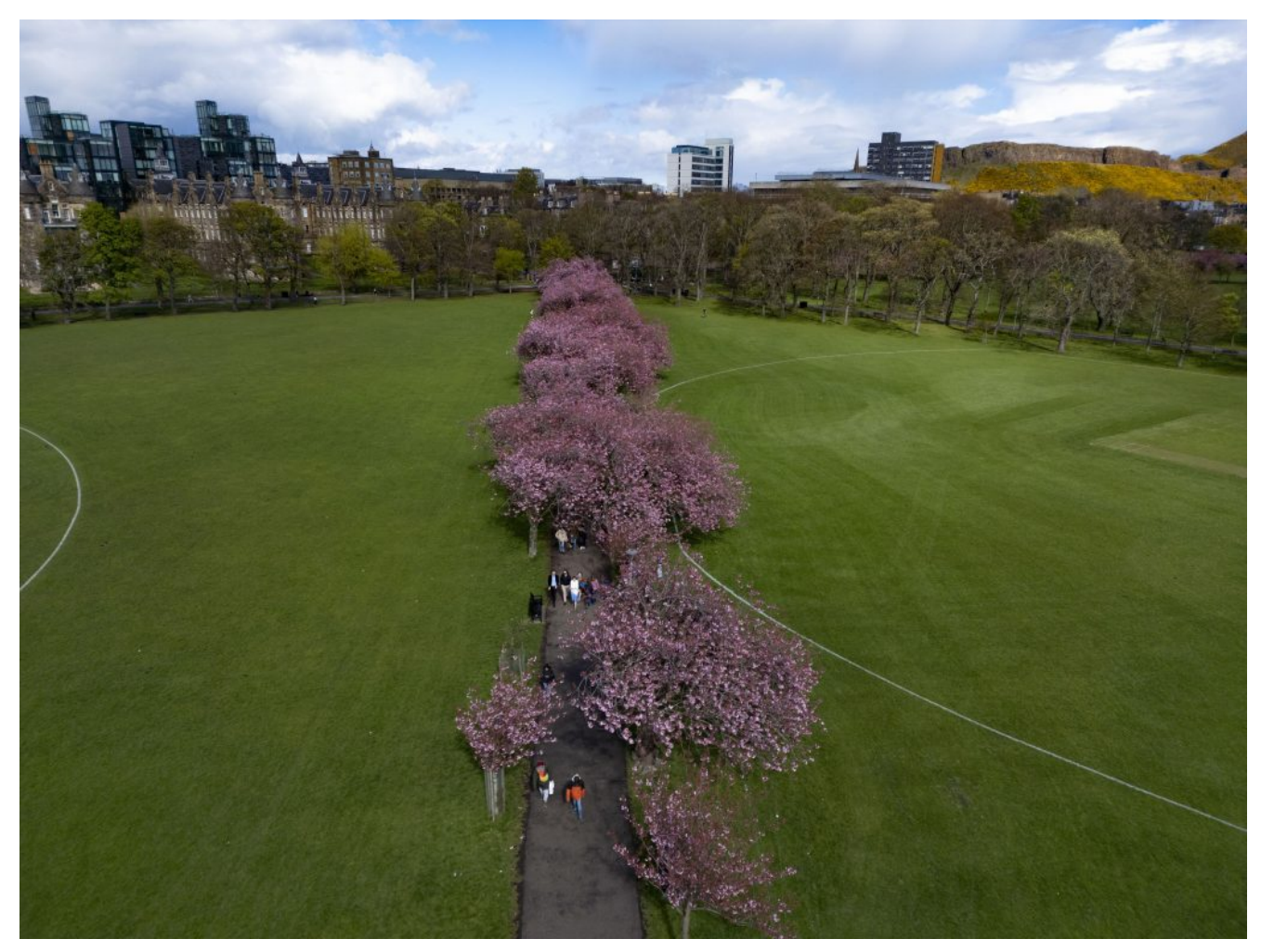
Aerial shot of the blossom in The Meadows PHOTO Alan Simpson 17/04/25