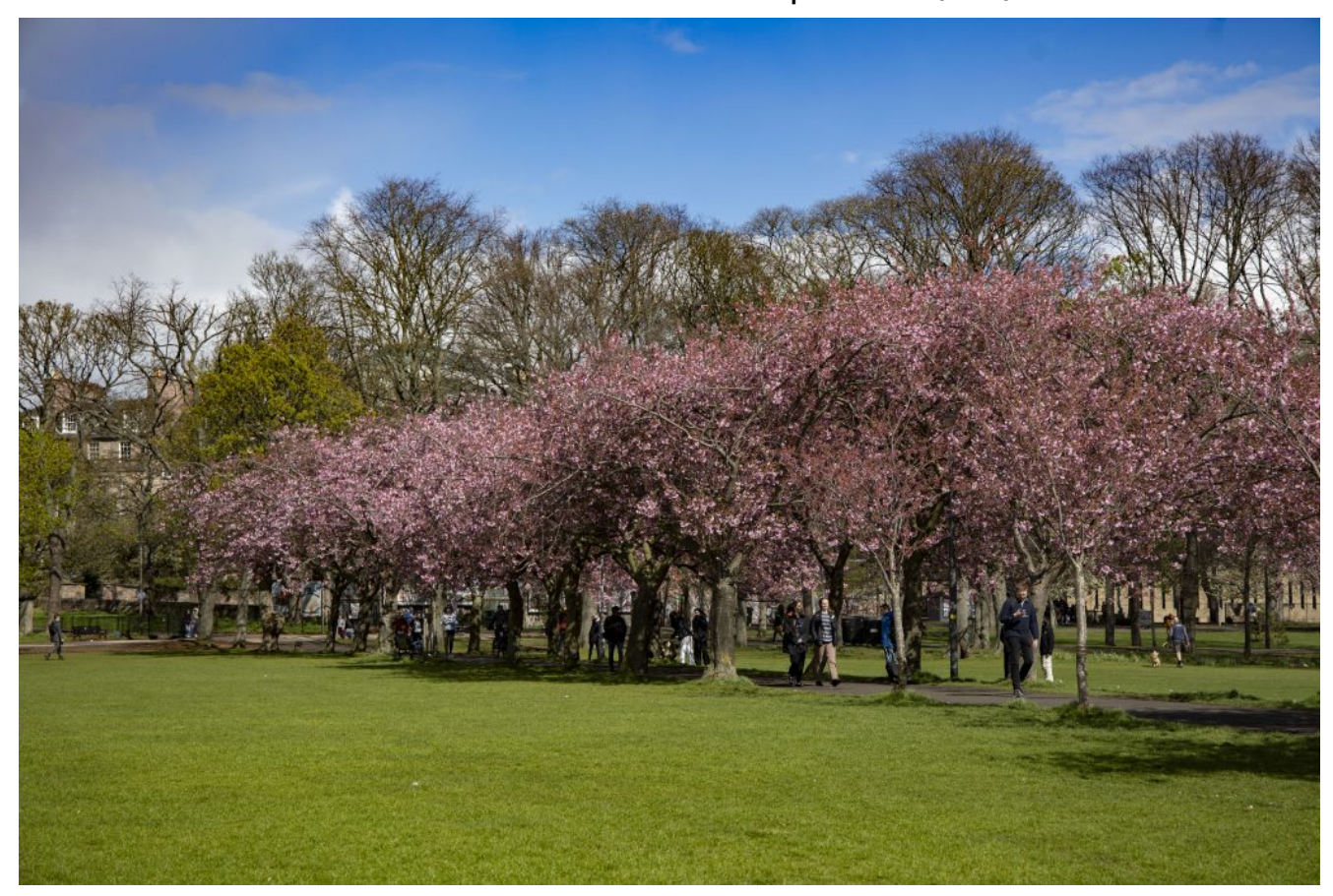
Blossom in The Meadows 17/04/25