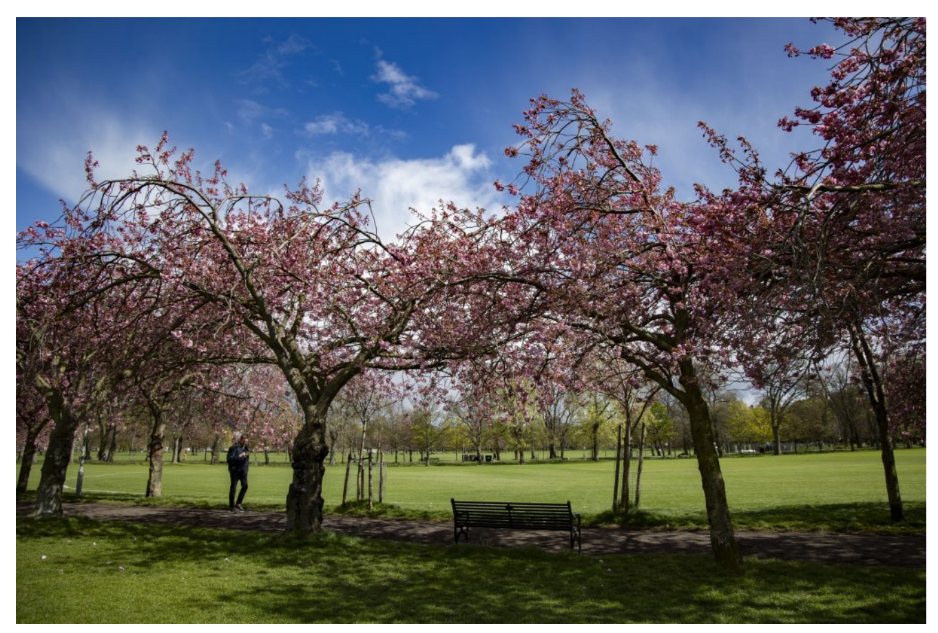
Blossom in The Meadows 17/04/25