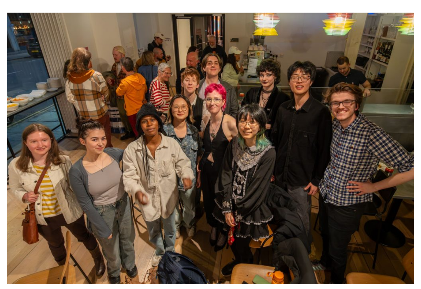
Some of the 20 Edinburgh College of Art students who created the animated film

A post shared by Edinburgh City Of Literature (@edincityoflit)