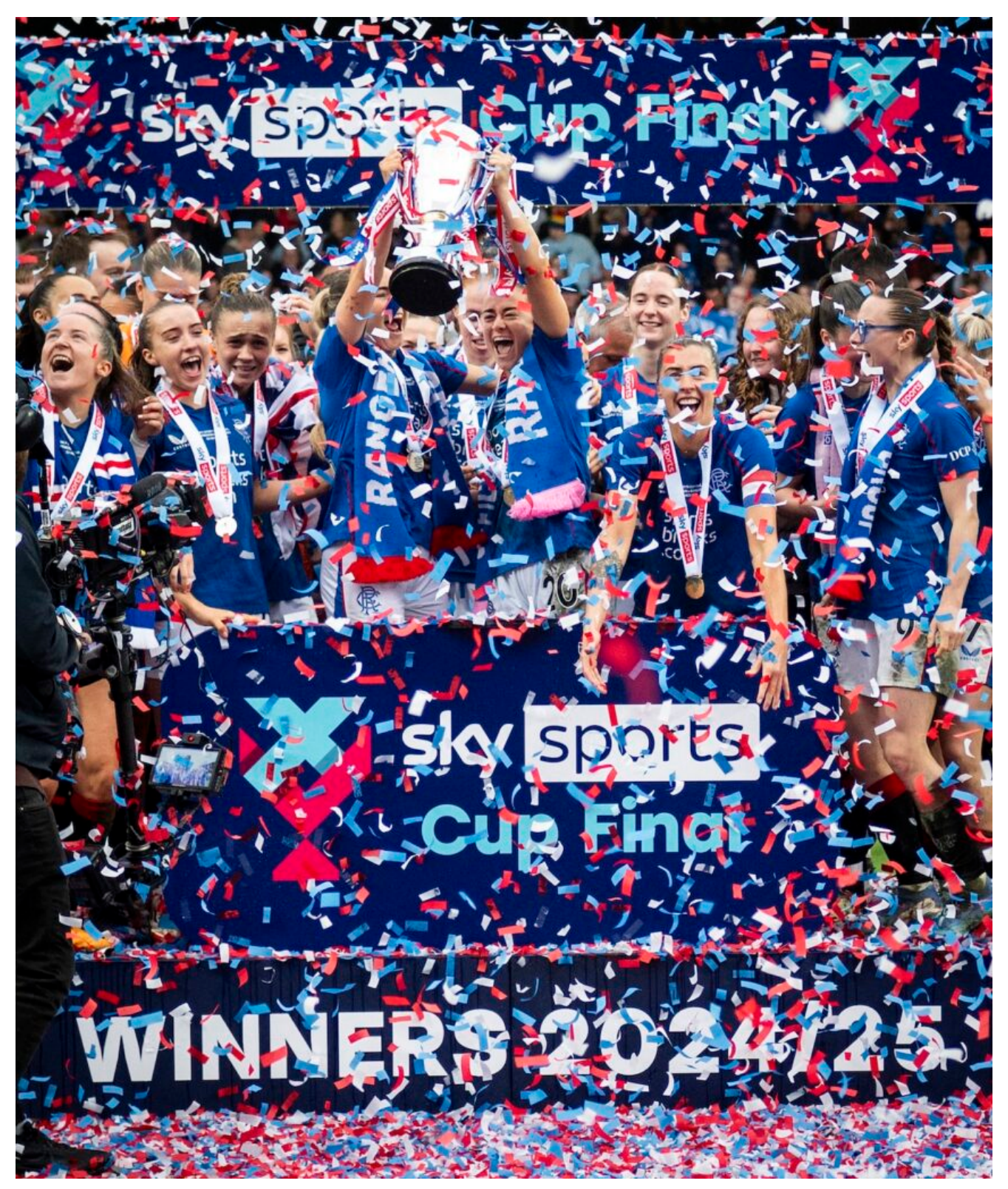
Rangers comfortably beat Hibs 5-0 in the final of the Scottish Women's Premier League Cup at Fir Park, Motherwell.