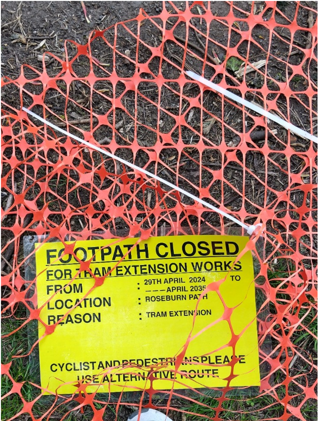
Sign on the Roseburn Path – the campaigners denied that it was anything to do with them.