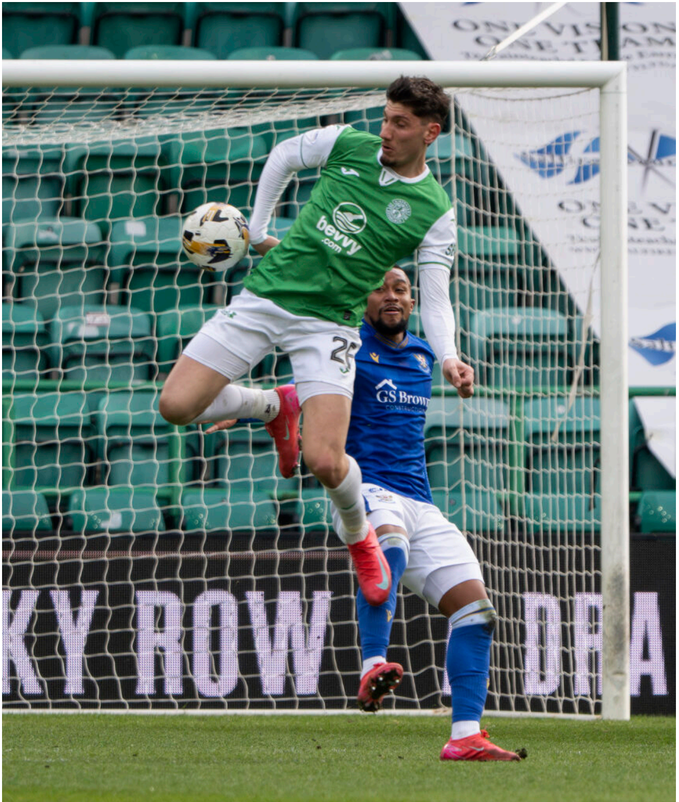
A comfortable 3-0 win for Hibs against a relegation threatened St Johnstone side which moves them into 3rd place in league.