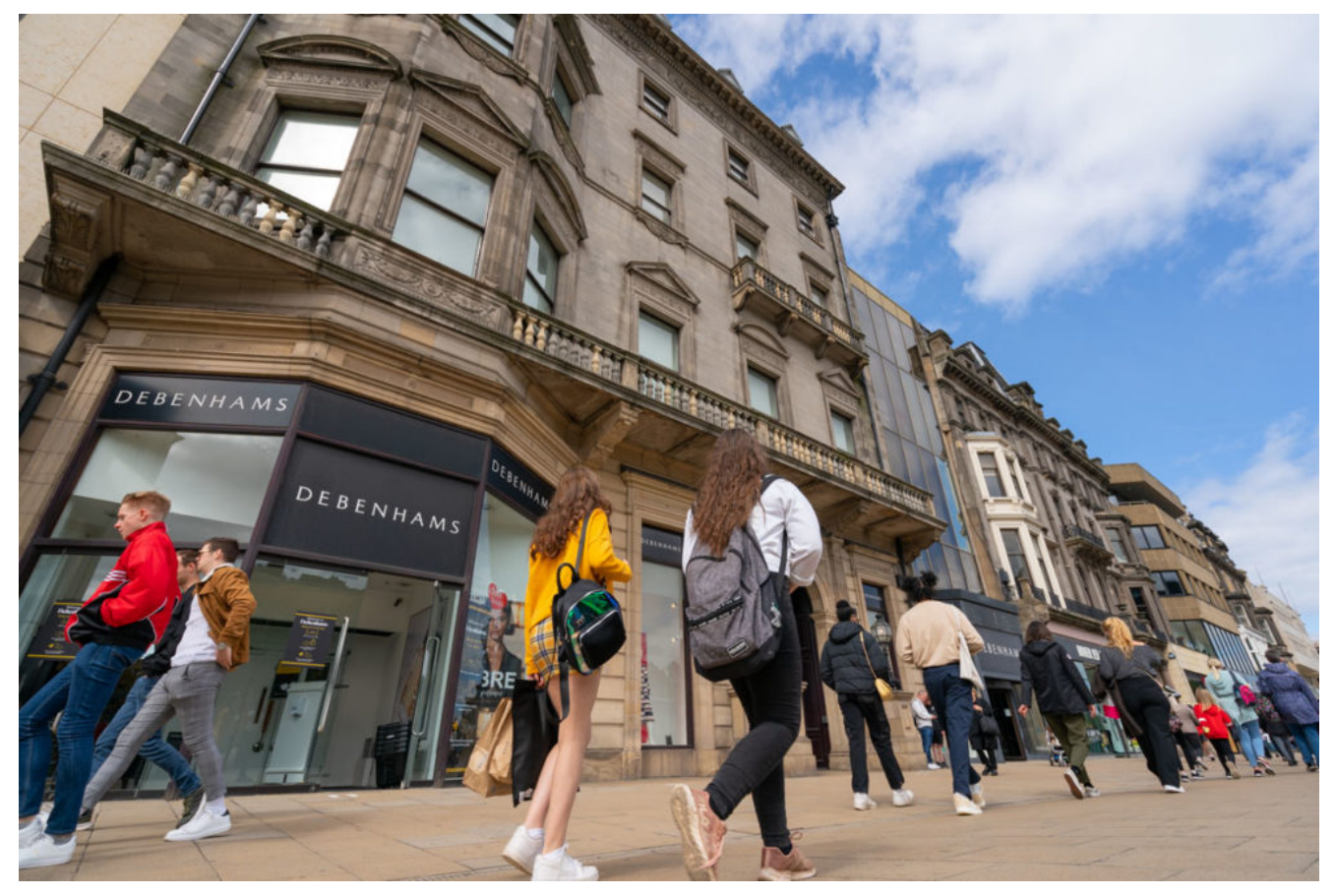
Debenhams, Princes Street, Edinburgh.