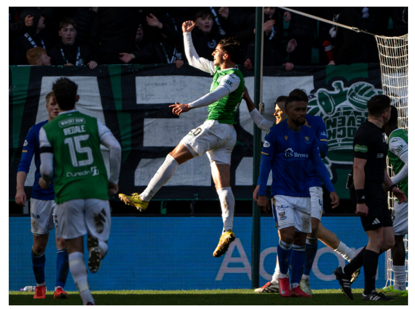
A comfortable 3-0 win for Hibs against a relegation threatened St Johnstone side which moves them into 3rd place in league.