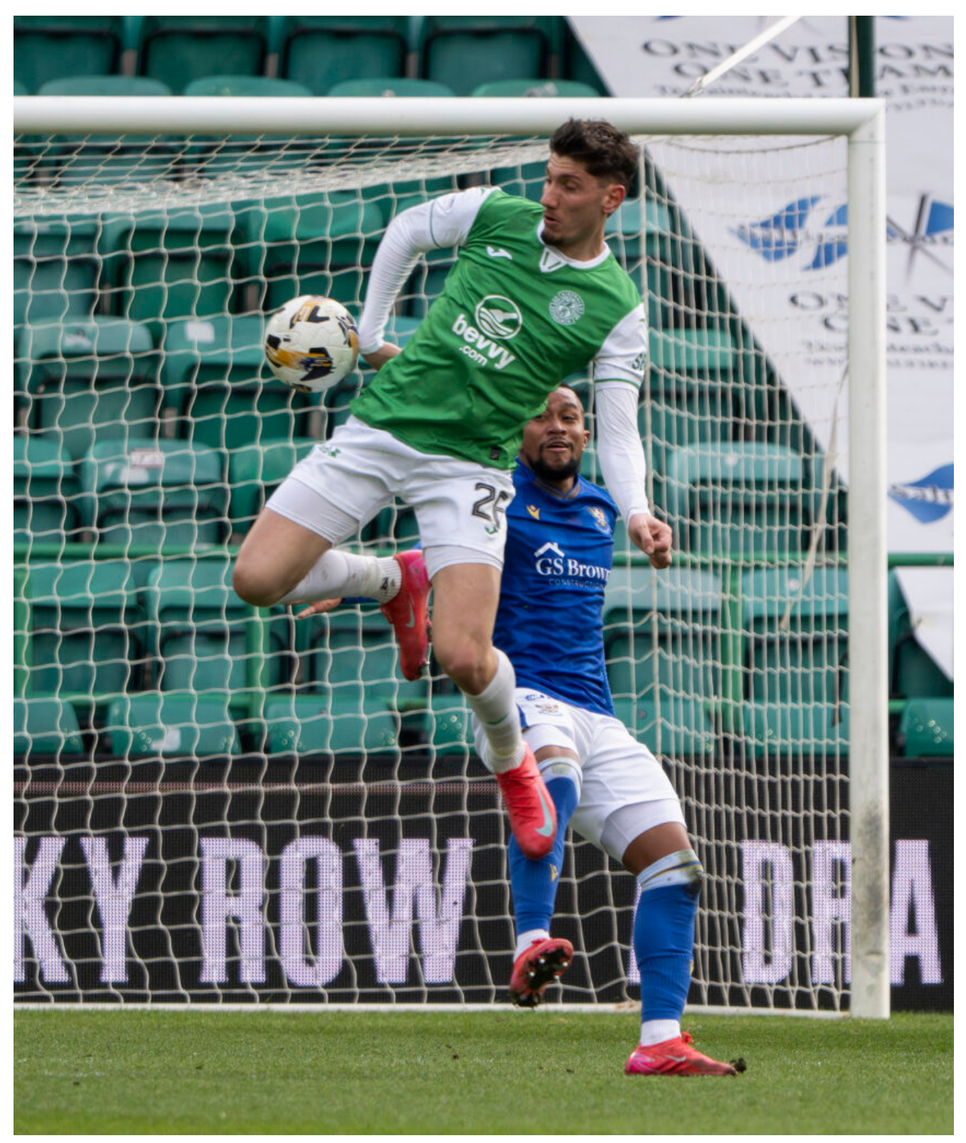
A comfortable 3-0 win for Hibs against a relegation threatened St Johnstone side which moves them into 3rd place in league.

"If you think about the international boys coming back too and the amount of travel they've done, for them to put in that kind of performance is great to see."