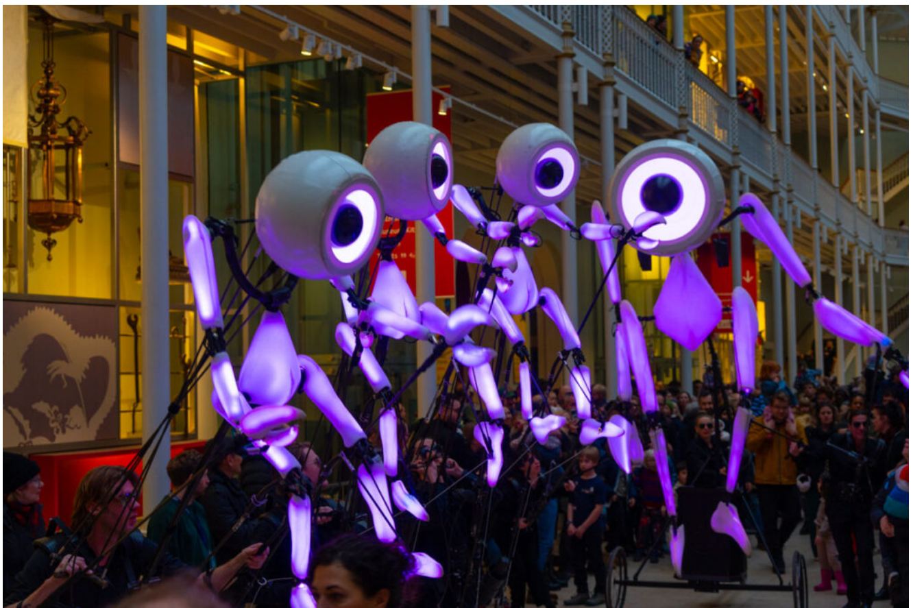
Street theatre by Close Act which wowed the children at Sprogmanay on New Year's Day 2025

Book now nms.ac.uk/events/relaxed-morning-national-museum-of-flight