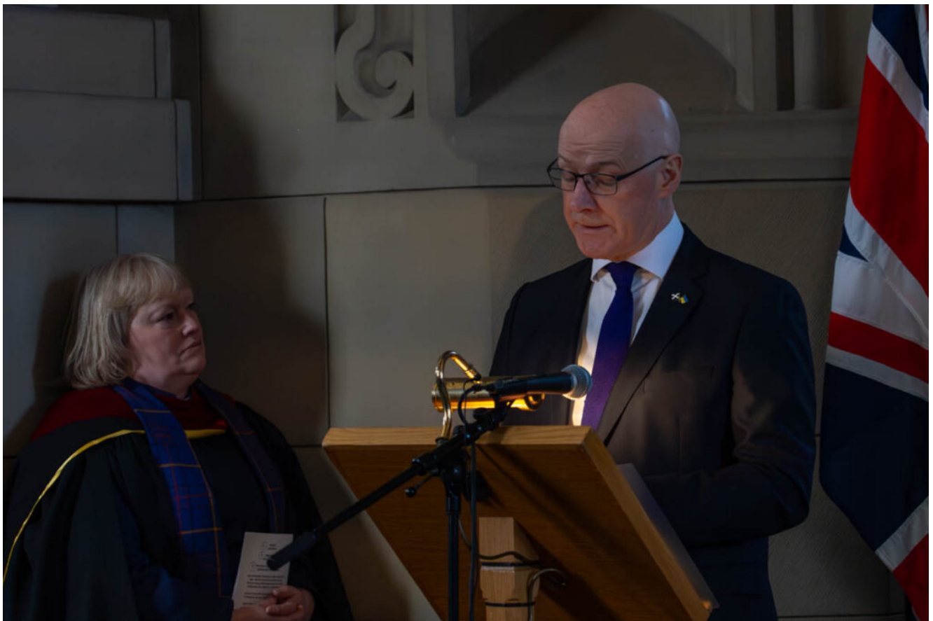
First Minister John Swinney at memorial service at the Scottish National War Memorial