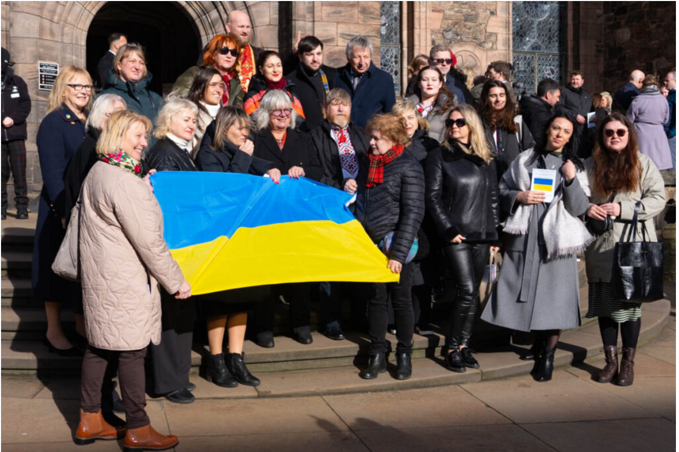
A group of Ukrainians who attended the service