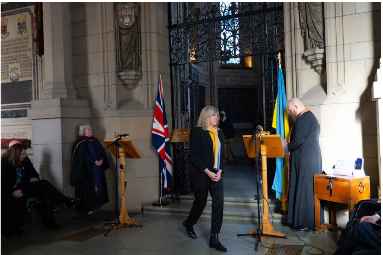
The Presiding Officer of the Scottish Parliament, The Rt Hon