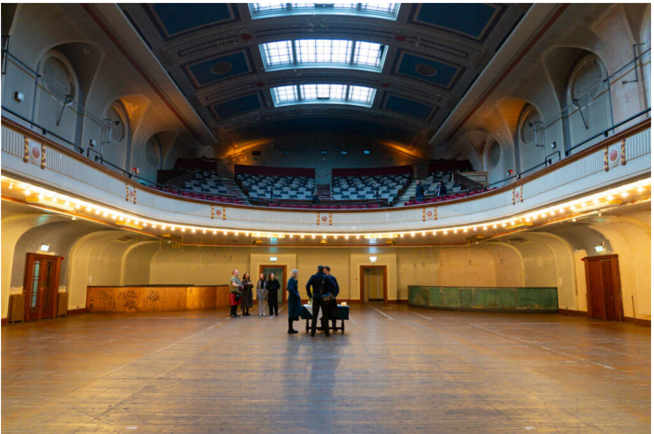
Interior of Leith Theatre