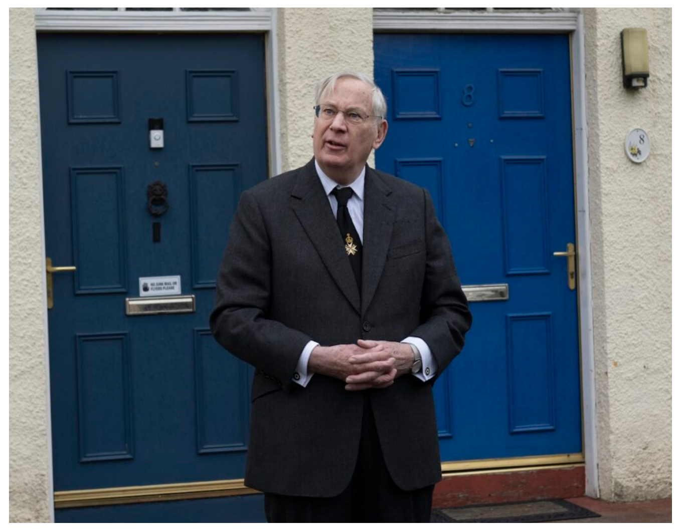
His Royal Highness the Duke of Gloucester