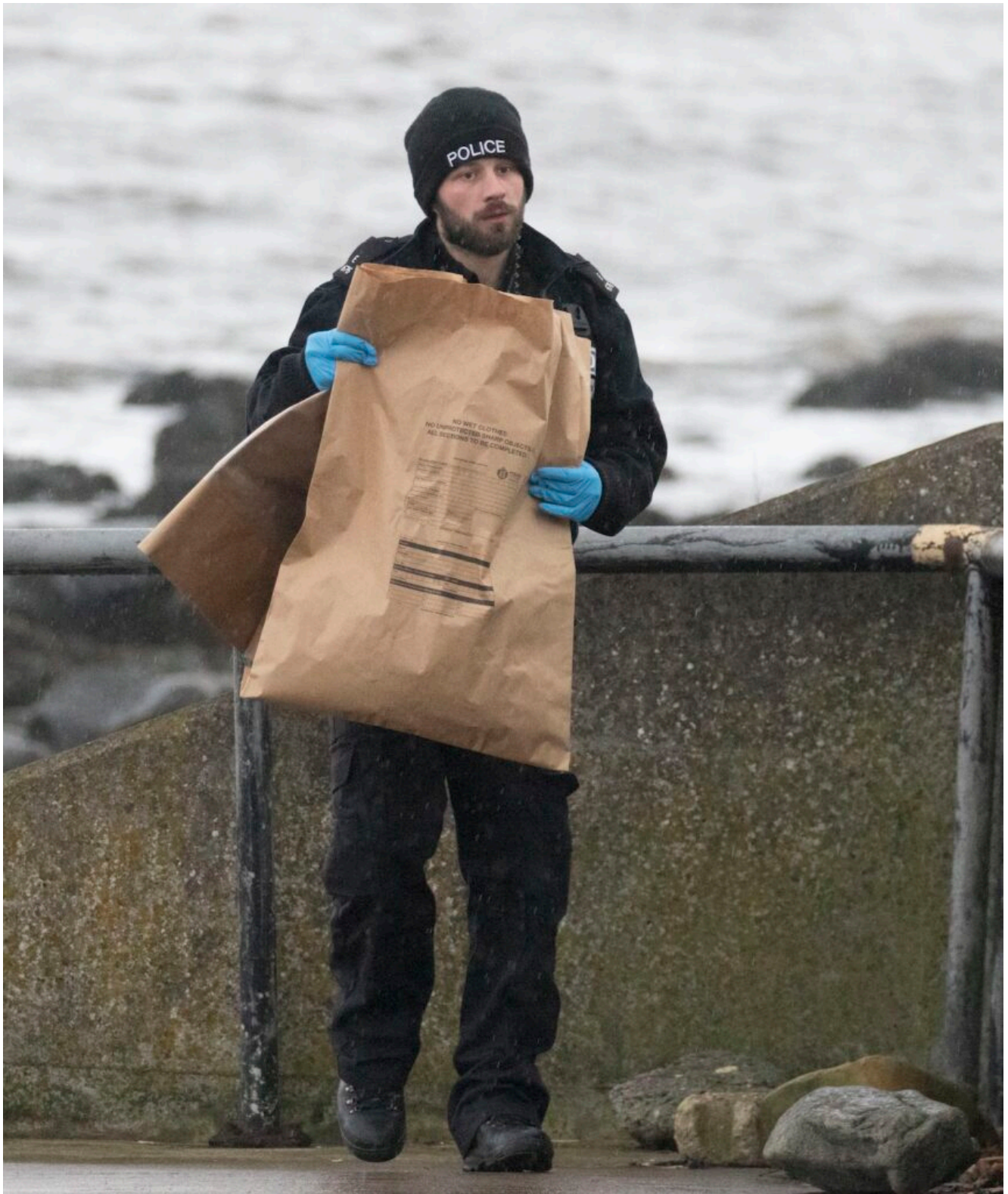
Coastguard and police launched a search at Silverknowes Promenade after abandoned clothing was found on the beach. Police officer carrying evidence bags 9 February 2025