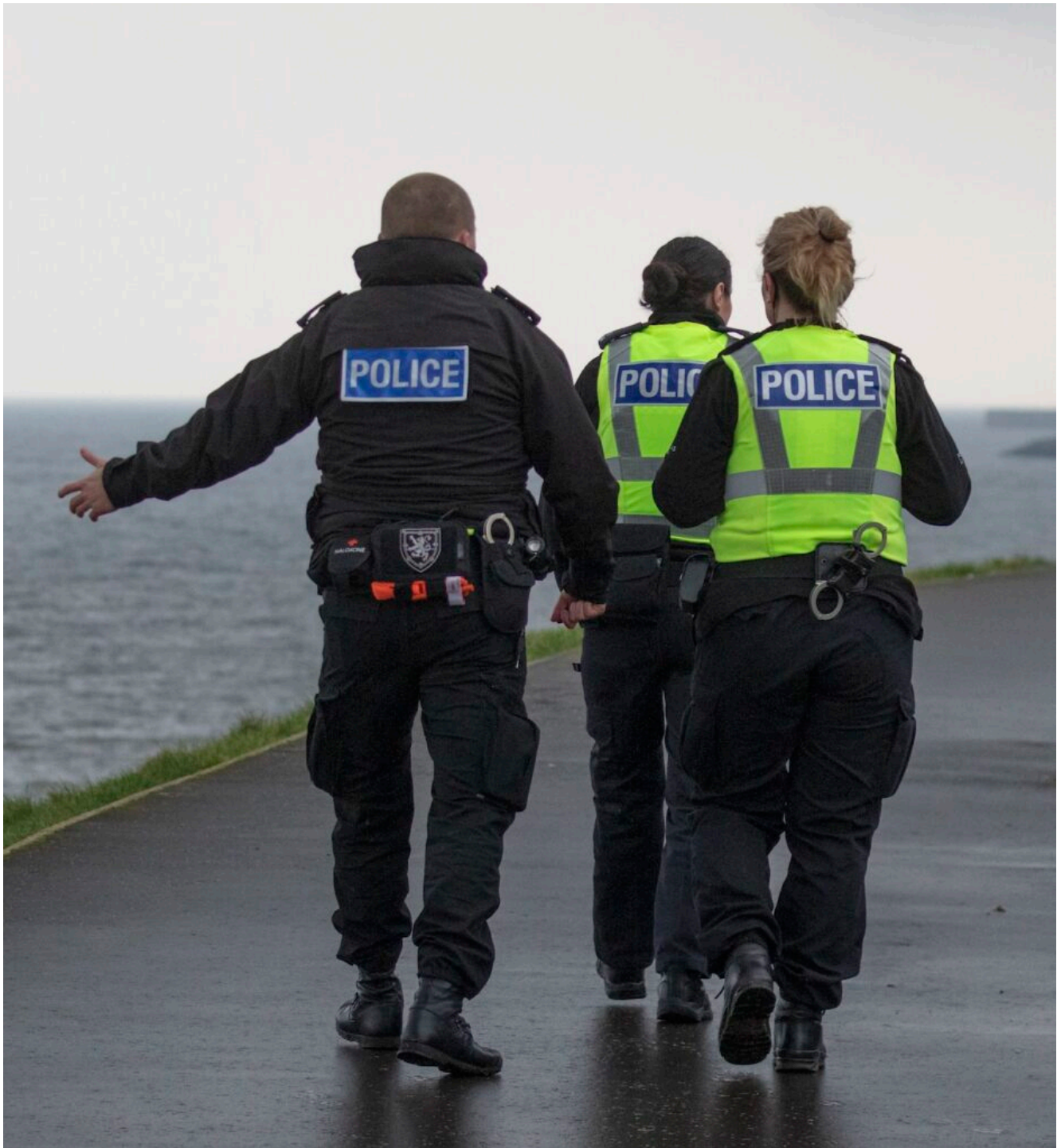
Coastguard and police launched a search at Silverknowes Promenade after abandoned clothing was found on the beach. 9 February 2025