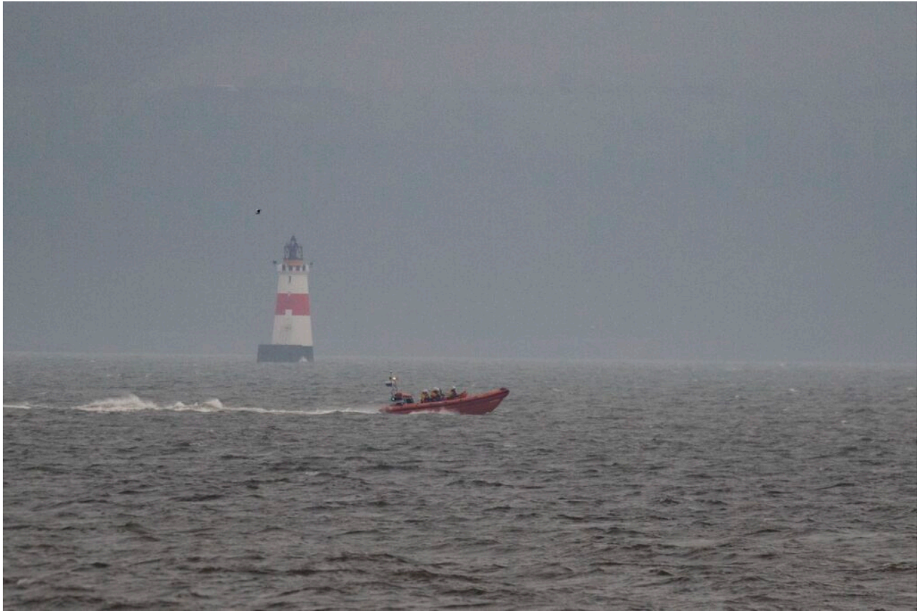
Coastguard, RNLI and police launched a search at Silverknowes Promenade after abandoned clothing was found on the beach. 9 February 2025