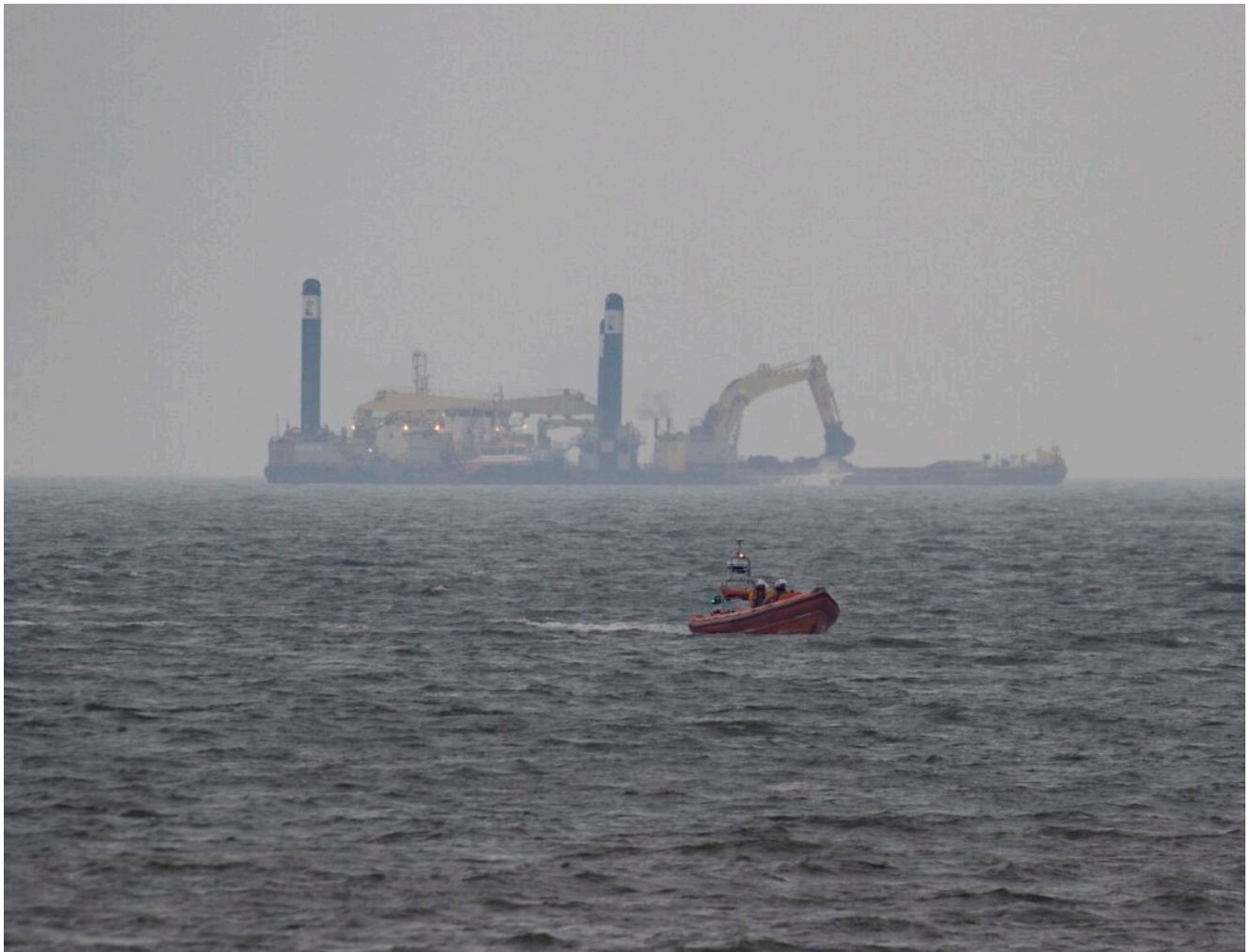
Coastguard, RNLI and police launched a search at Silverknowes Promenade after abandoned clothing was found on the beach. 9 February 2025