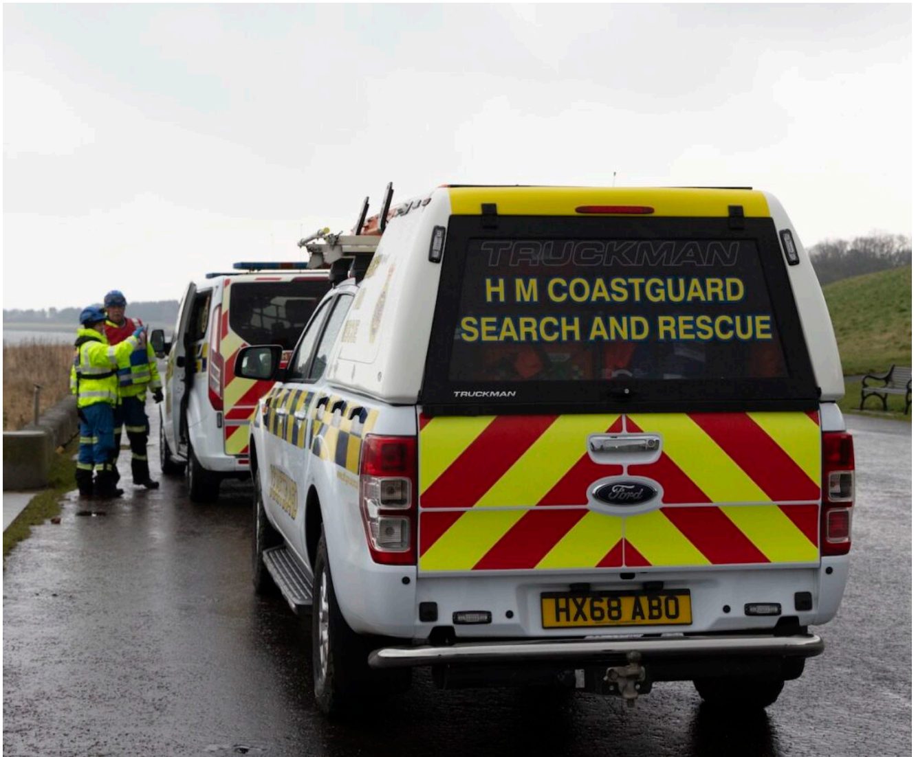
Coastguard and police launched a search at Silverknowes Promenade after abandoned clothing was found on the beach. 9 February 2025