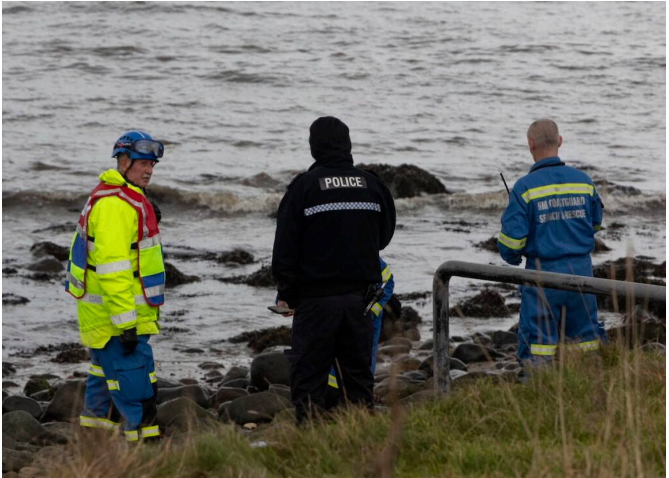
Coastguard and police launched a search at Silverknowes Promenade after abandoned clothing was found on the beach. 9 February 2025