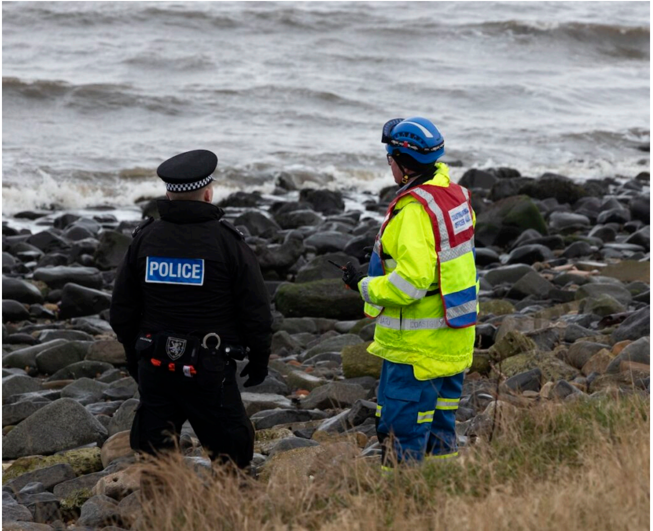
Coastguard and police launched a search at Silverknowes Promenade after abandoned clothing was found on the beach. PHOTO Alan Simpson 9 February 2025