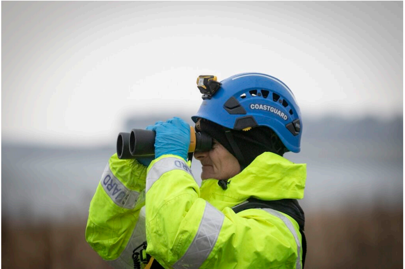
Coastguard and police launched a search at Silverknowes Promenade after abandoned clothing was found on the beach. 9 February 2025