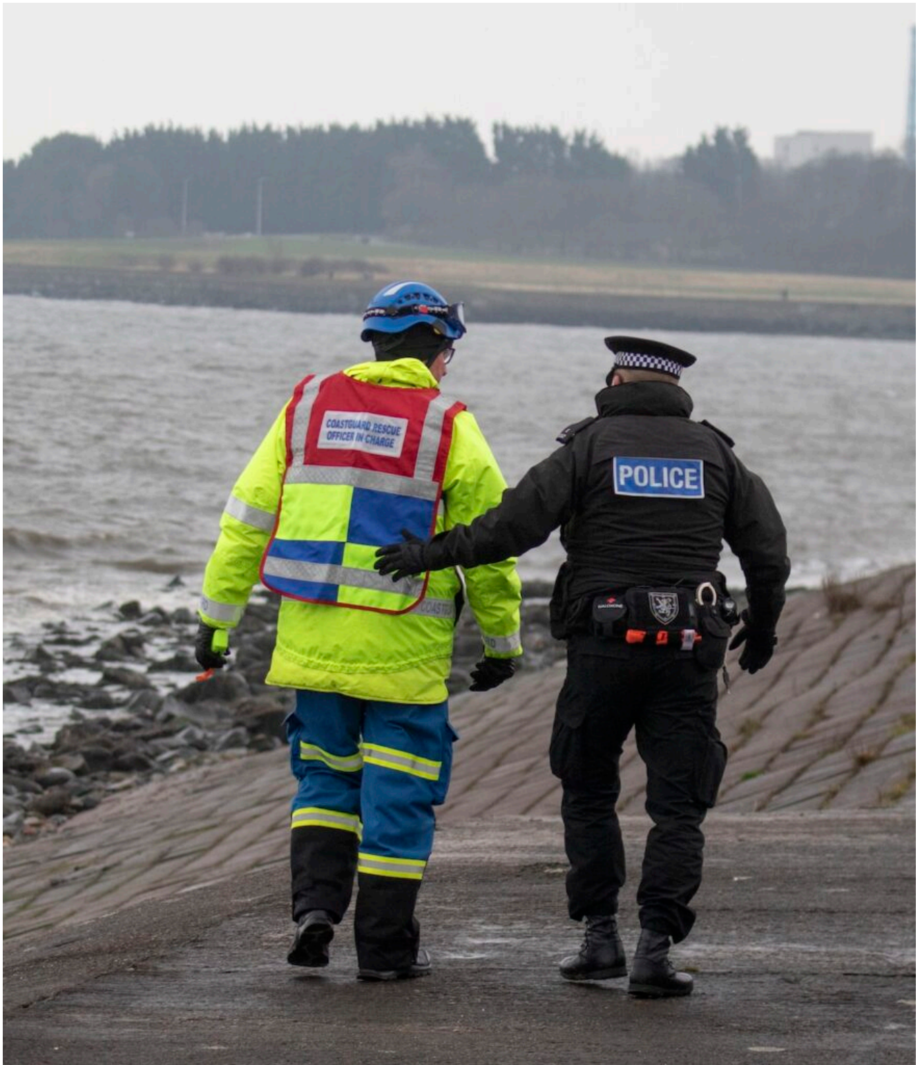
Coastguard and police launched a search at Silverknowes Promenade after abandoned clothing was found on the beach. 9 February 2025