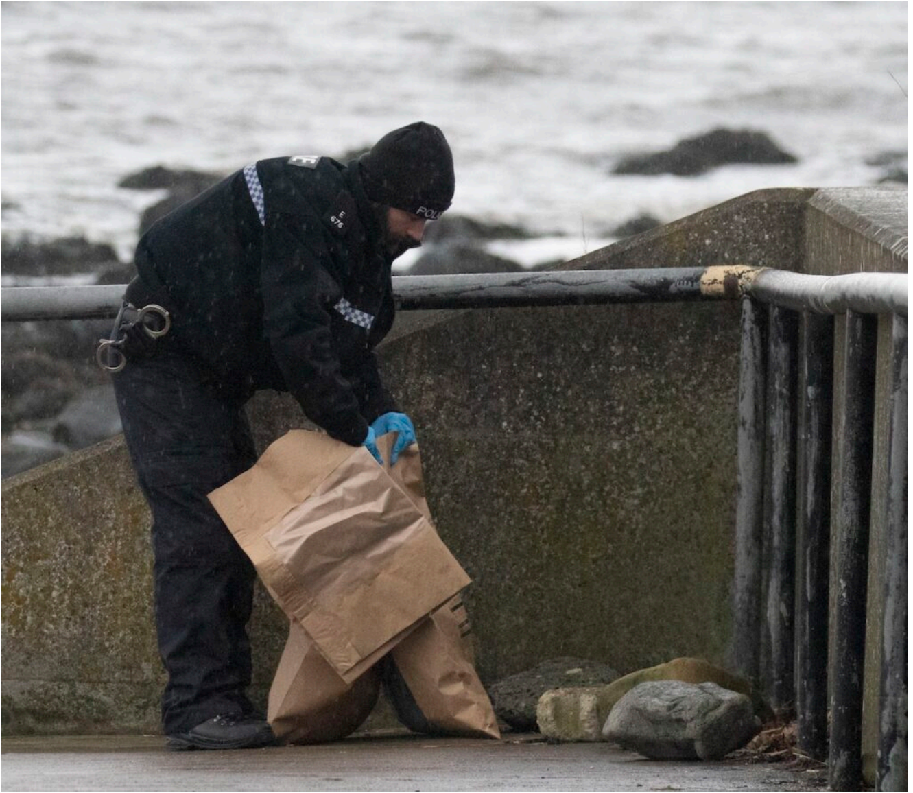
Coastguard and police launched a search at Silverknowes Promenade after abandoned clothing was found on the beach. Police officer carrying evidence bags 9 February 2025