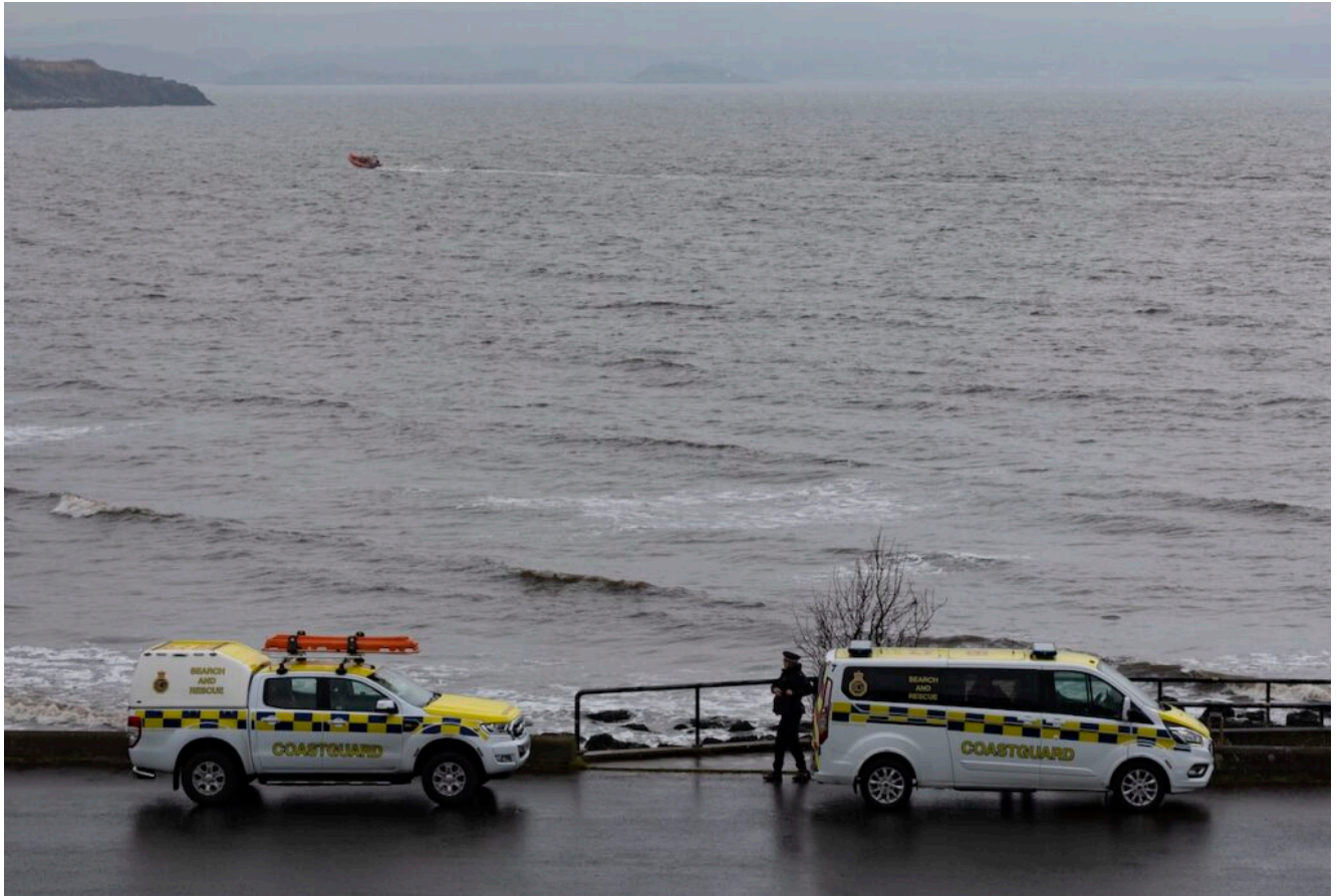
Coastguard and police launched a search at Silverknowes Promenade after abandoned clothing was found on the beach. PHOTO Alan Simpson 9 February 2025