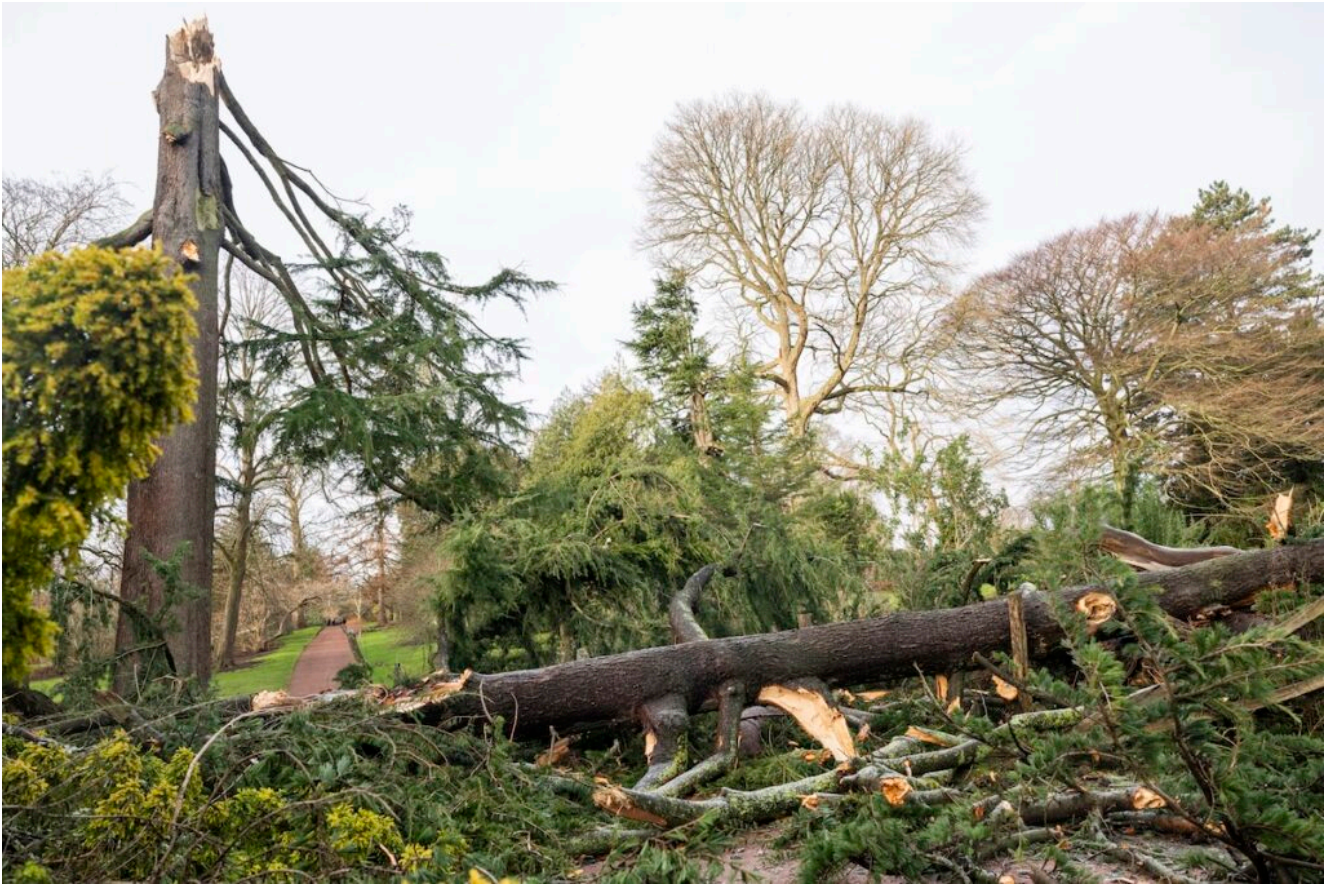
Damage in the Botanics where the tallest tree perished in the storm