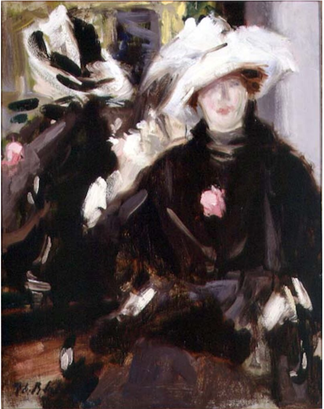
FCB Cadell, The Feathered Hat, c.1914, oil on millboard.