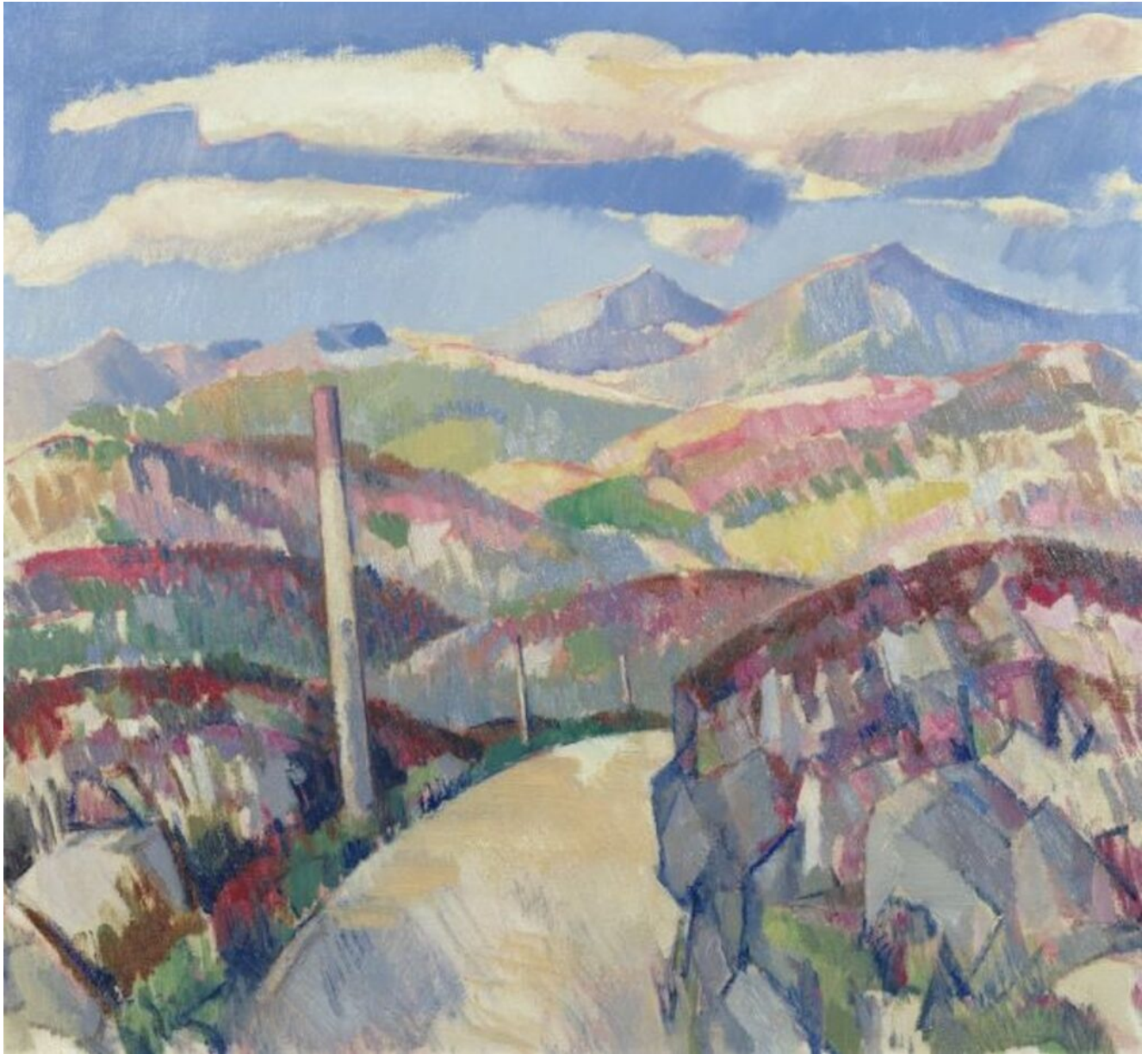
J D Fergusson THE Drift Posts