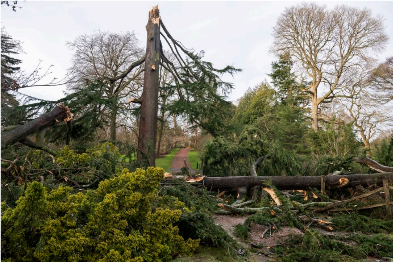
The tallest tree in the Royal Botanic Garden Edinburgh has been damaged beyond recovery