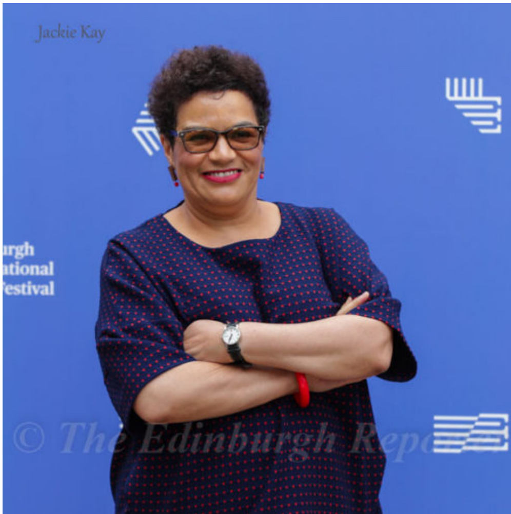
Author Jackie Kay