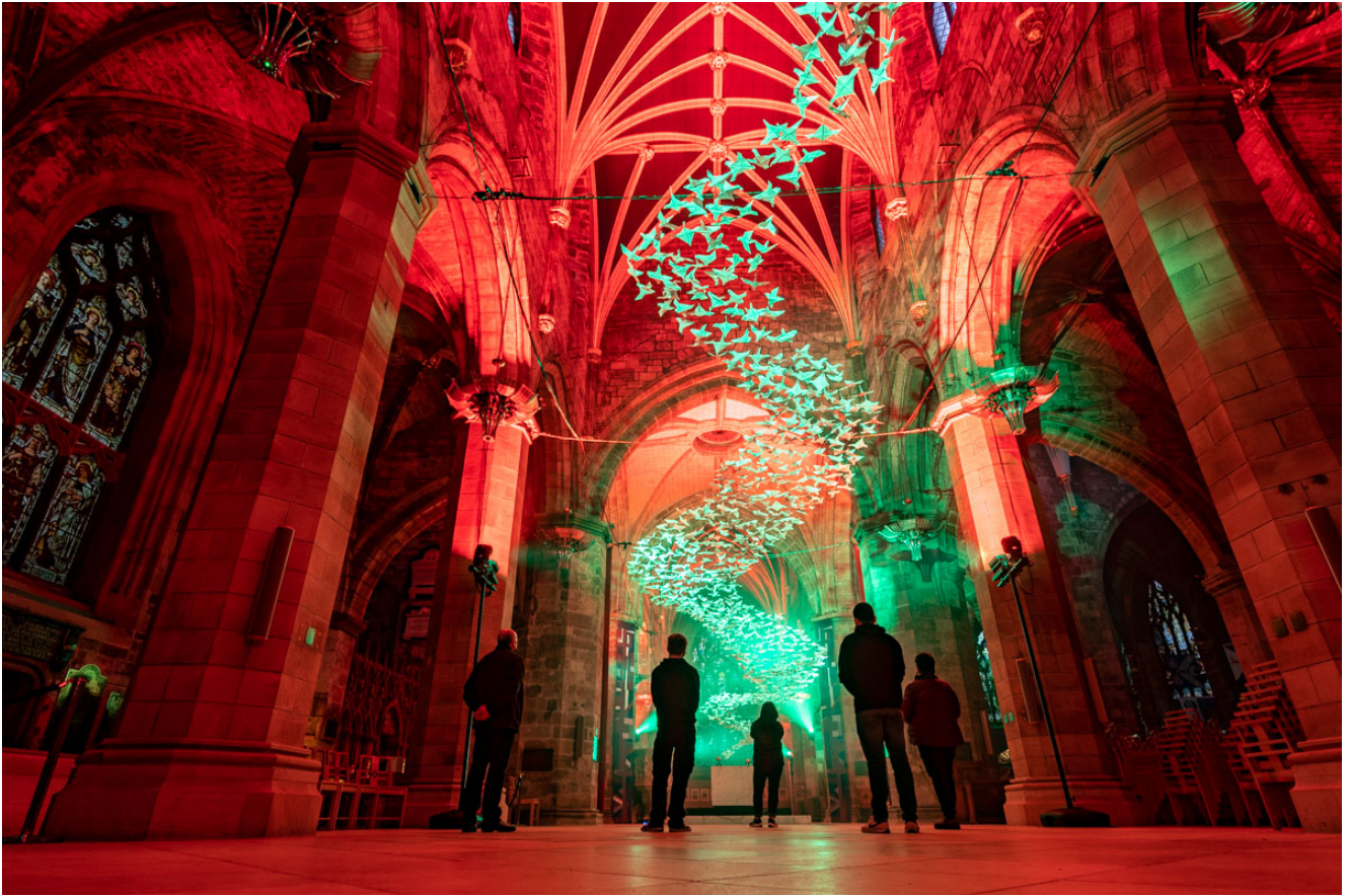
Art for Peace Project Les Colombes at St. Giles Cathedral.