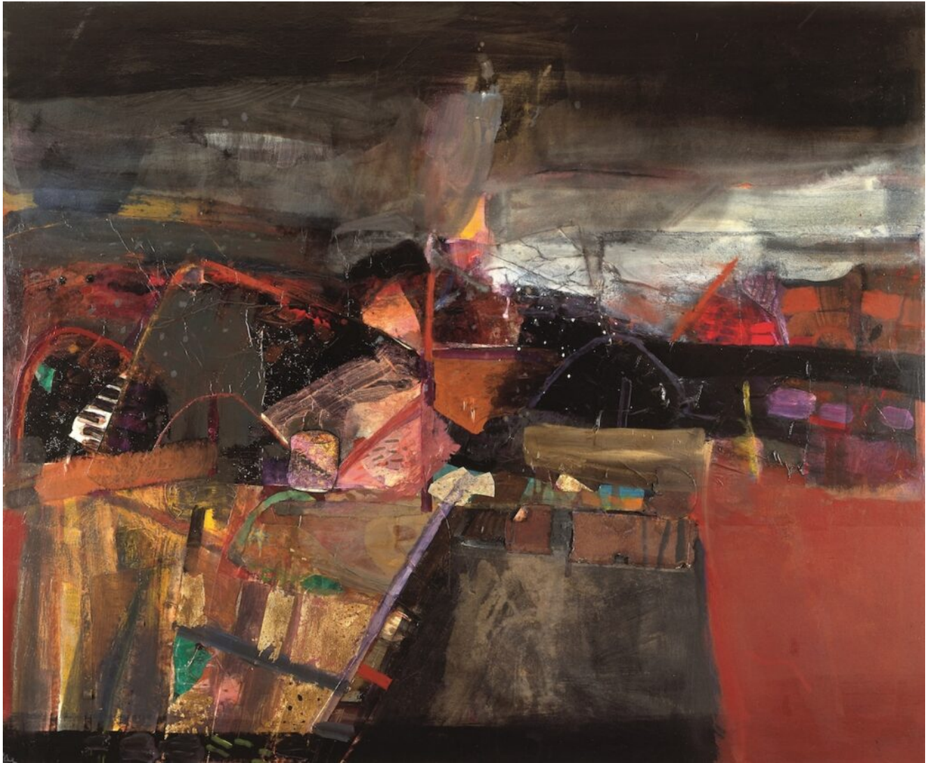
Barbara Rae, 'Peat Bank, South Erradale (West Highland Landscape)', 1987. © the artist.