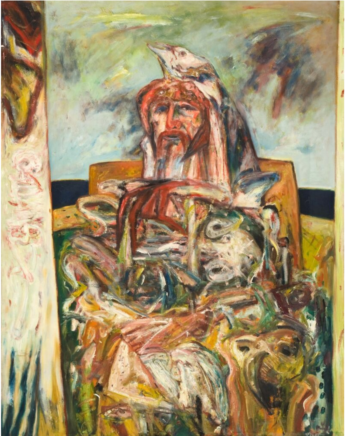
John Bellany, 'Sad Self-Portrait', 1976. © The Estate of John Bellany