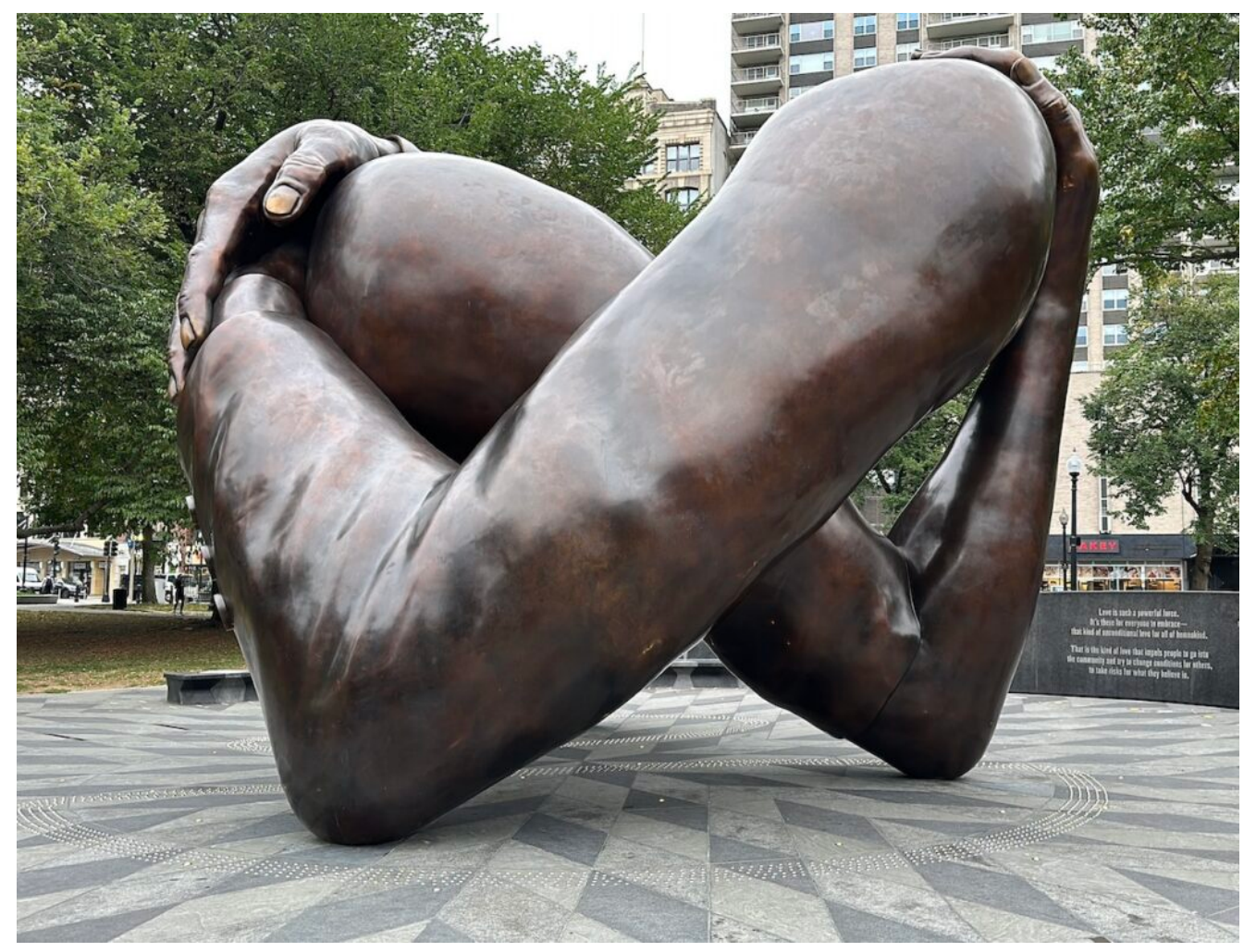
In Boston Common there is a 6.1 metre high 7.6 metre wide bronze sculpture weighing 19 tons. The sculpture depicts four intertwined arms and hands, representing an embrace between Martin Luther King Jr. and Coretta Scott King.