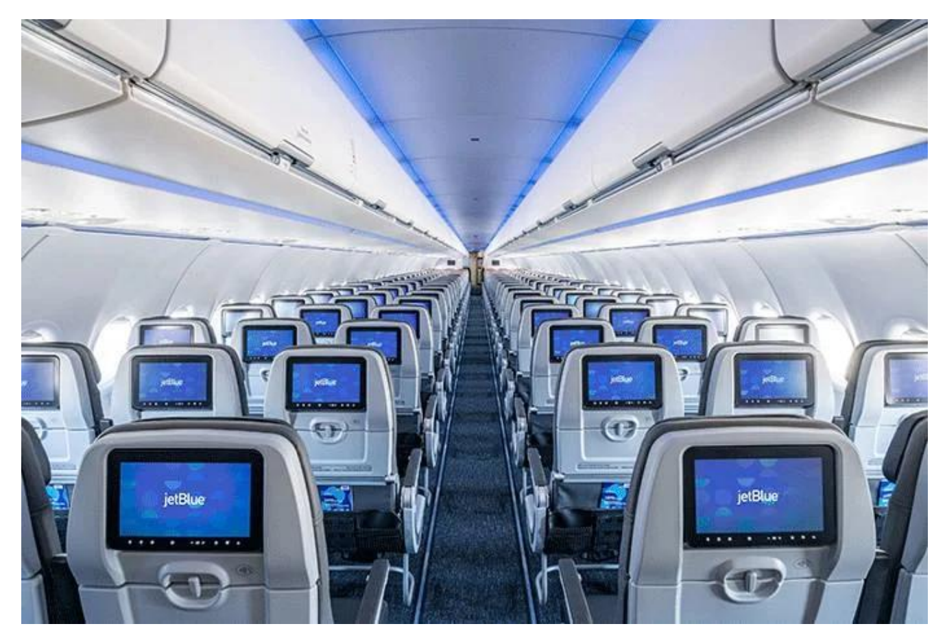
A321 neo mint cabin