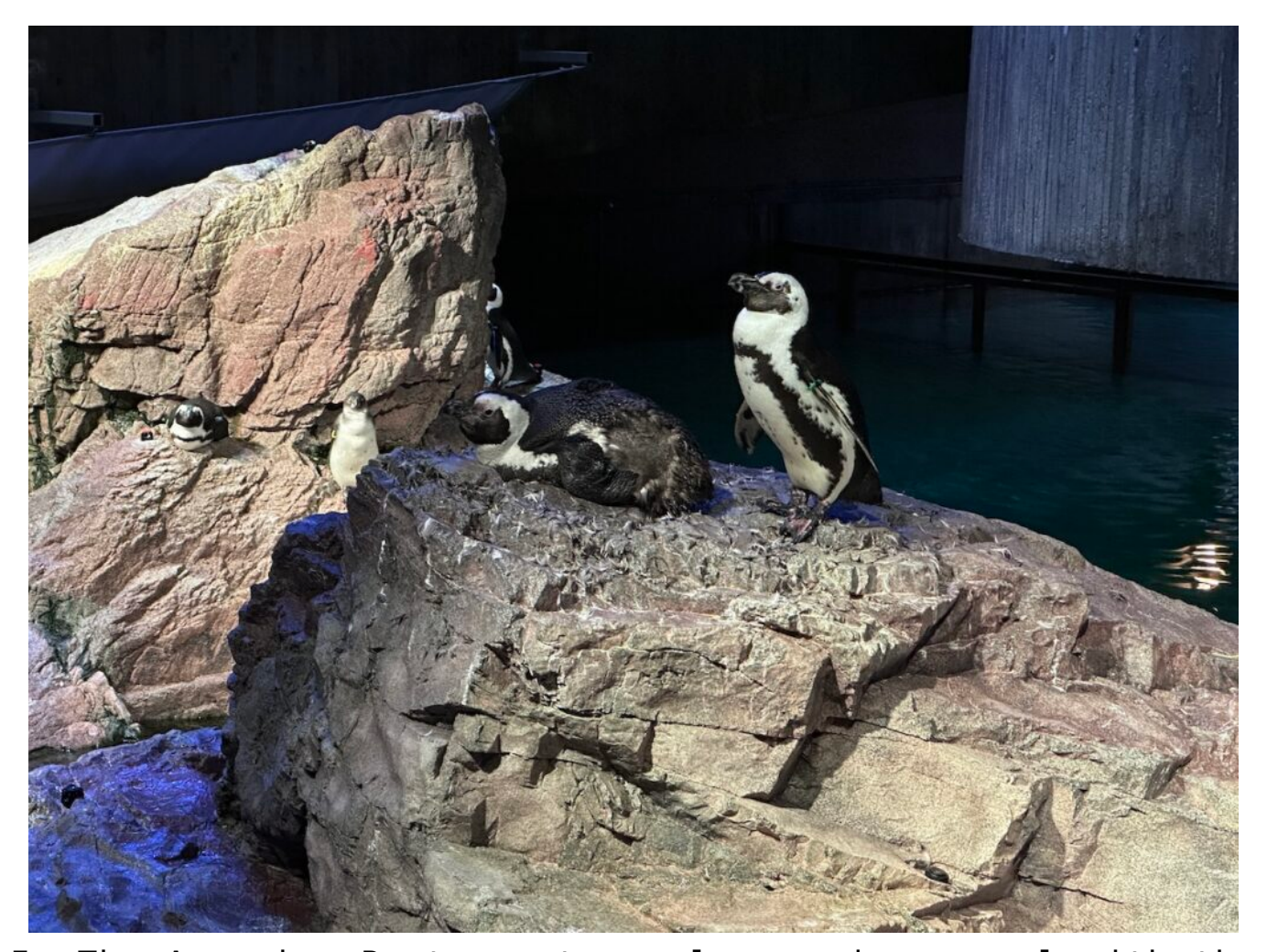
In The Aquarium Boston get up close and personal with the penguins