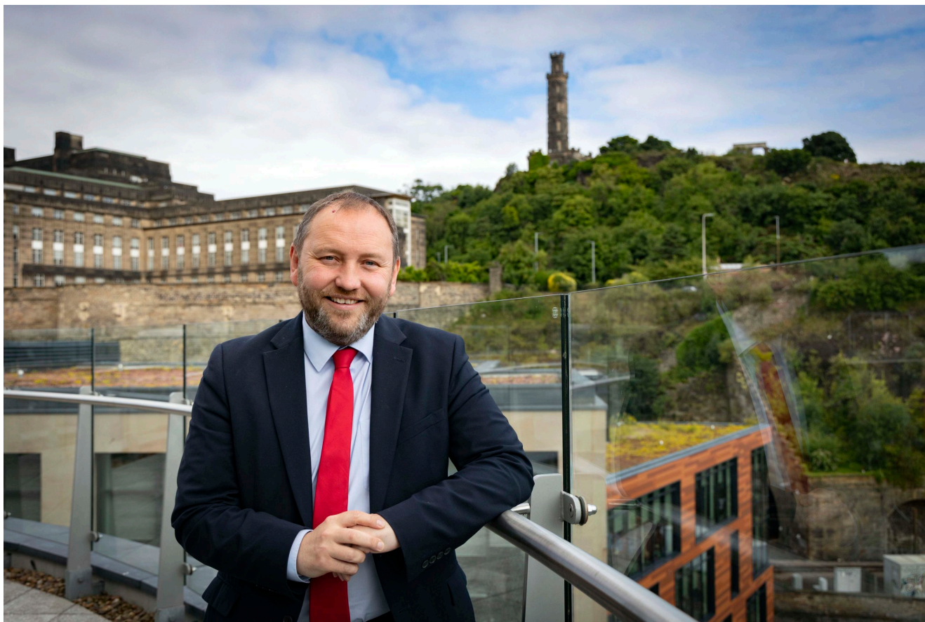
12/7/2024 Secretary of State for Scotland Ian Murray MP on rooftop terrace at Queen Elizabeth House

the gift of football, and make our most iconic game accessible for all, not just for those that can afford it.”