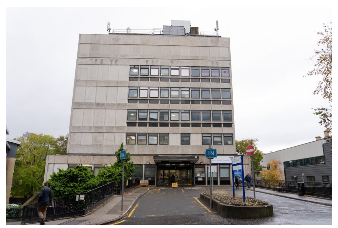
The Princess Alexandra Eye Pavilion

"Patients and campaigners deserve clarity and I hope The Health Secretary takes up my suggestion to meet with stakeholders."