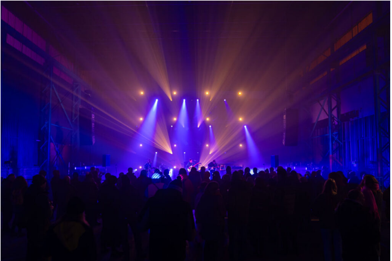
Hidden Door at the Paper Factory