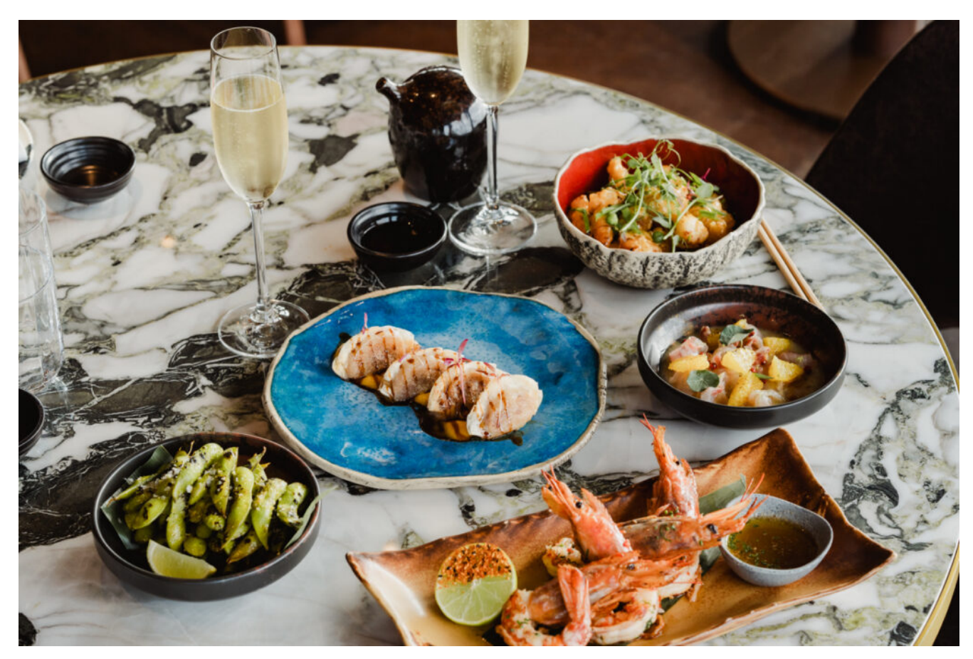
SushiSamba at the W